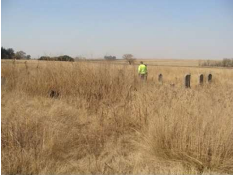
Figure 6: Site LP as it was during the 2014 assessment.

In summary the following can be said about the graves exhumed from Site LP: