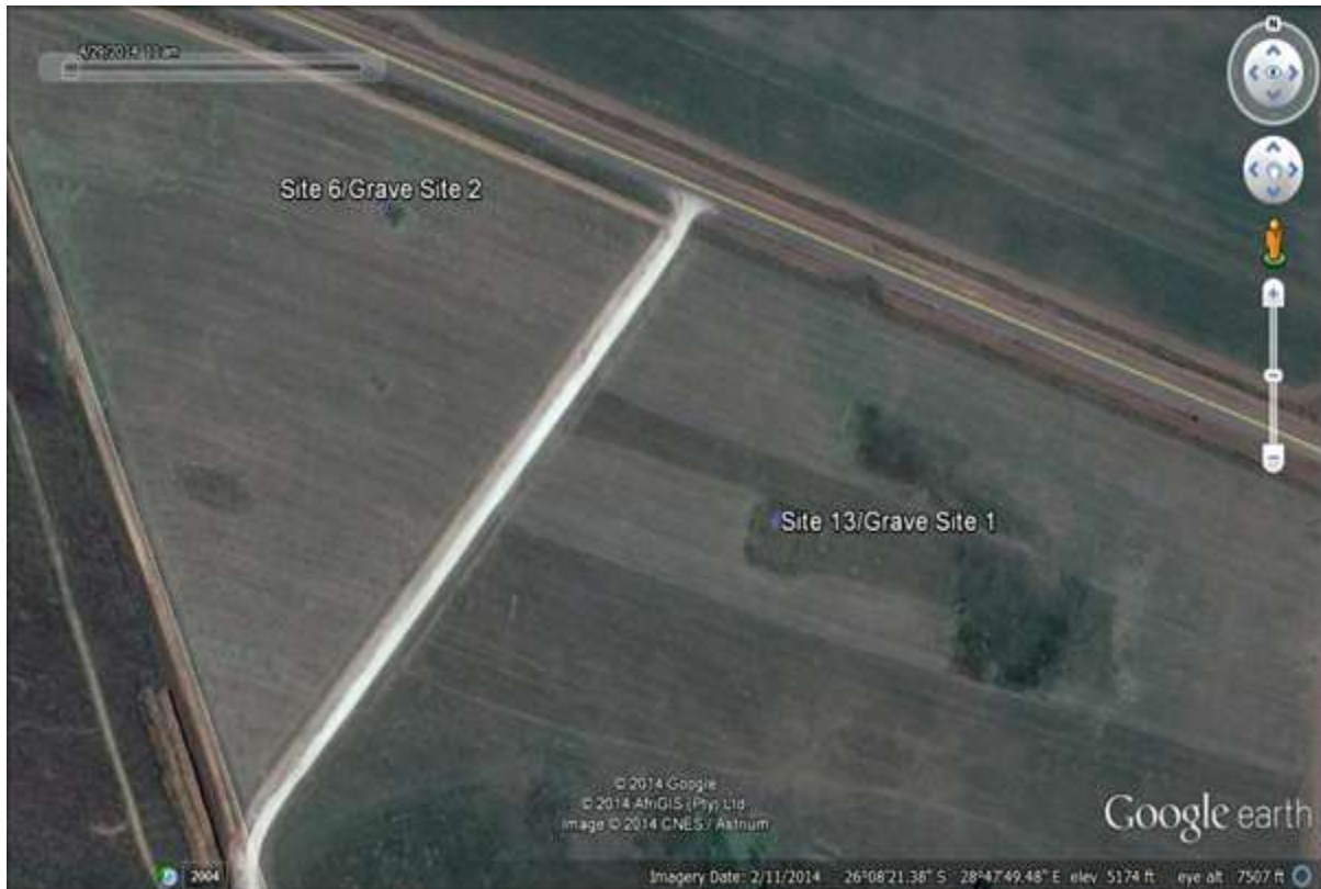
Figure 4: Aerial view of location of two grave sites that needed to be relocated (Google Earth 2014). Site 6/Grave Site 2 is the new Site MV & Site 13/Grave Site 1 is now numbered LP. The old numbers are related to the earlier 2012 & 2014 assessment numbers.