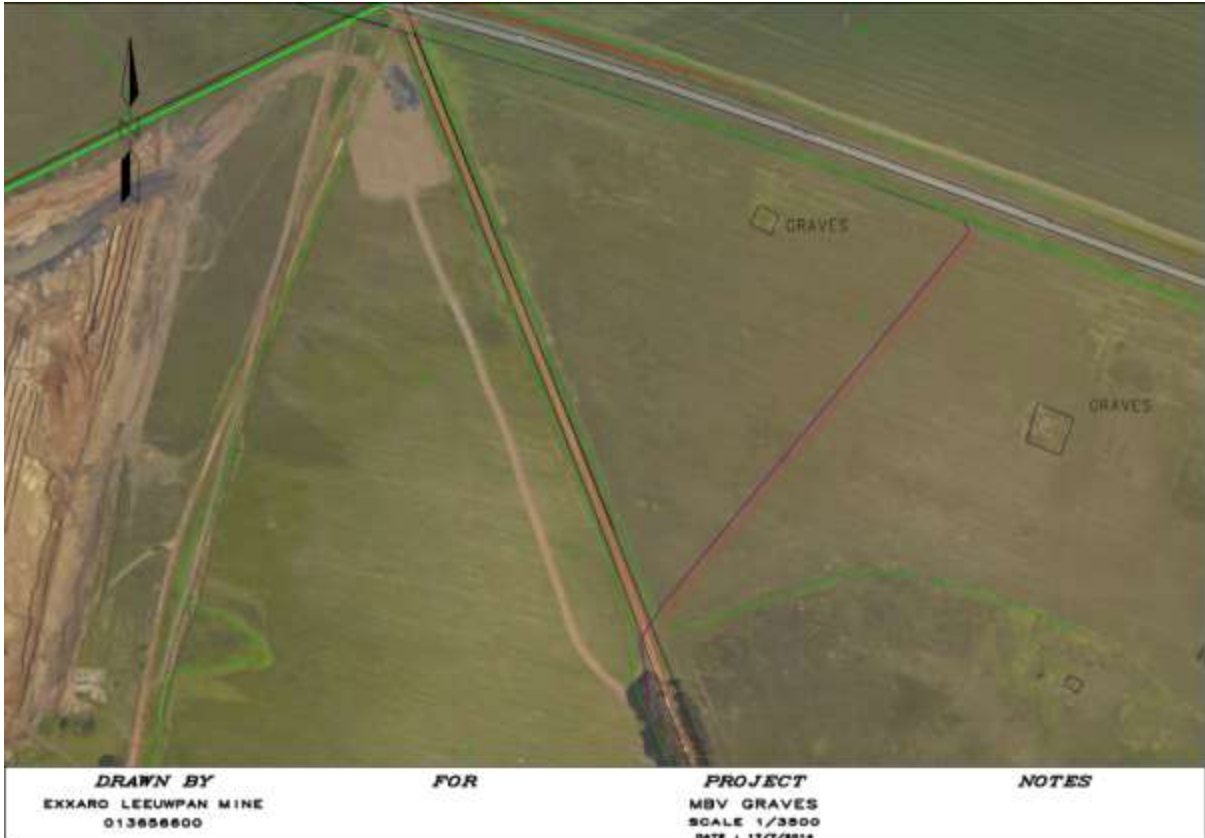
Figure 3: Map of area showing the location of the two grave sites that needed to be relocated.