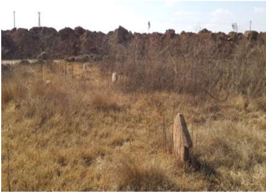
Figure 5: Site MV in 2014.

As indicated earlier a total of 32 graves were exhumed and relocated from Site MV. Four (4) possible graves were also tested, but declared Non Graves after investigation. All the burials positively identified and exhumed were relocated to Botleng Cemetery near Delmas. It needs to indicated here as well that another 4 possible graves that were initially identified as graves were also test excavated but found not be and was declared NON GRAVES. These graves were MV06, MV33, MV34 and MV35.