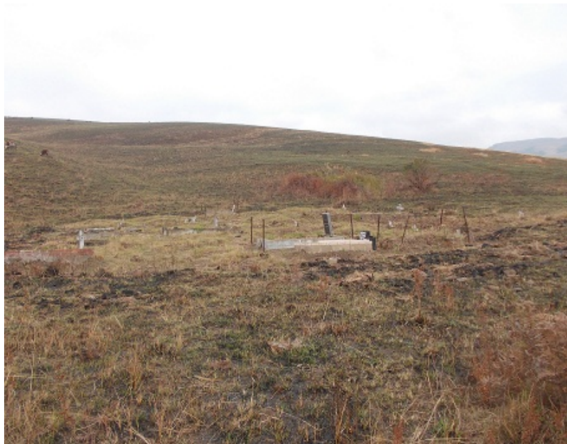
Fig 3. View of community cemetery