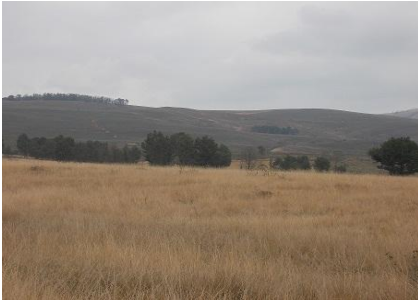
Fig 1. General view of proposed development area

General GPS co-ordinate: S30° 17' 10.3" E29° 55' 02.6"