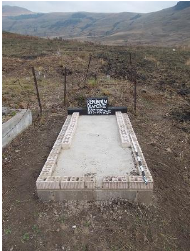
Fig 2. View of a grave in the community cemetery.