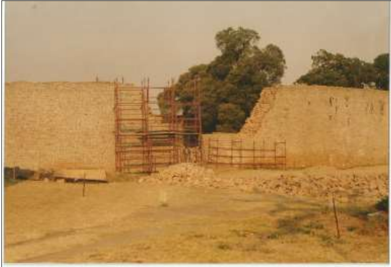
Fig 3: Systematic dismantling of the wall