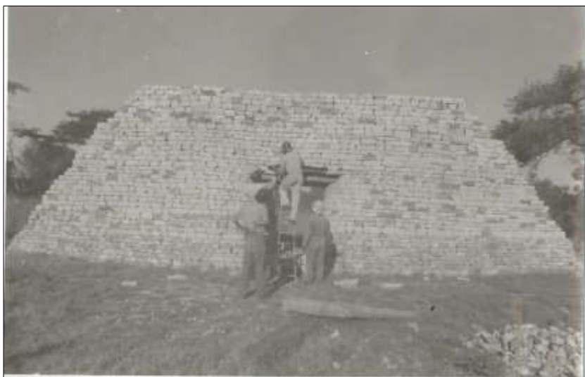
Fig 2: Experimental wall (training phase)