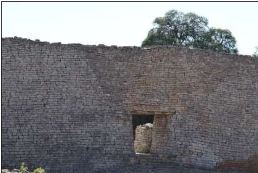
Fig 6: The restored entrance has been standing intact since 1995.