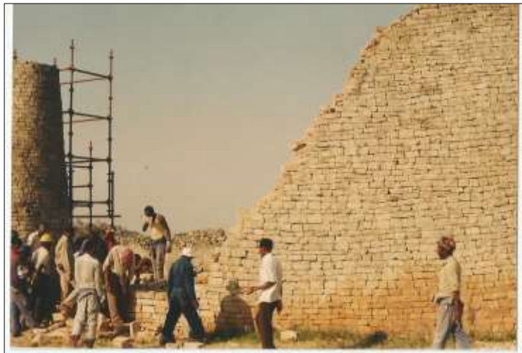
Figure 4: Restoration work