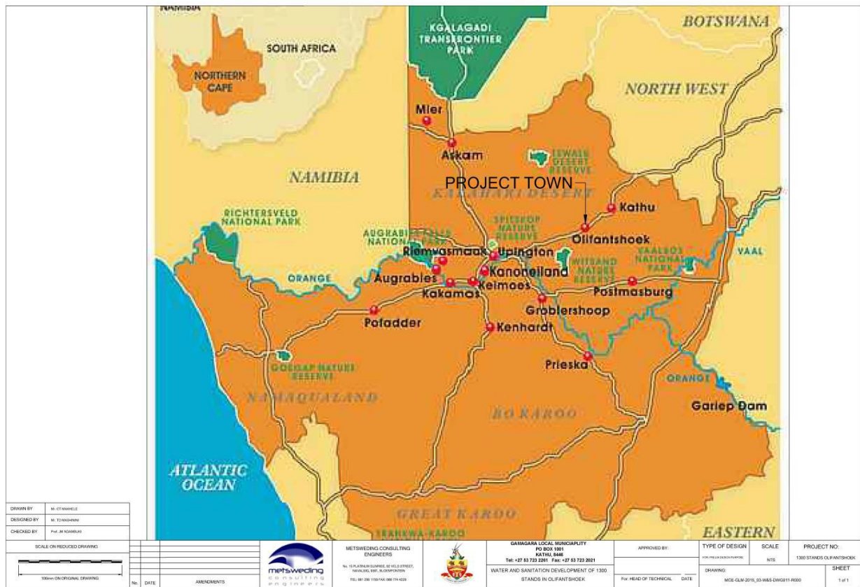
Figure 3: Project Location