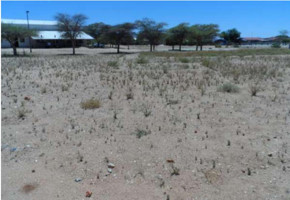
Figure 6: General view of the site. The existing hall and its parking lot can be seen in the top left of the image.