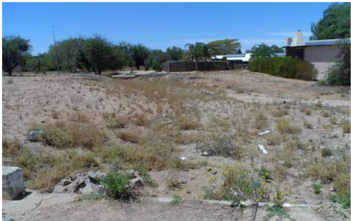
Figure 4: View of the ephemeral stream, looking south-west.