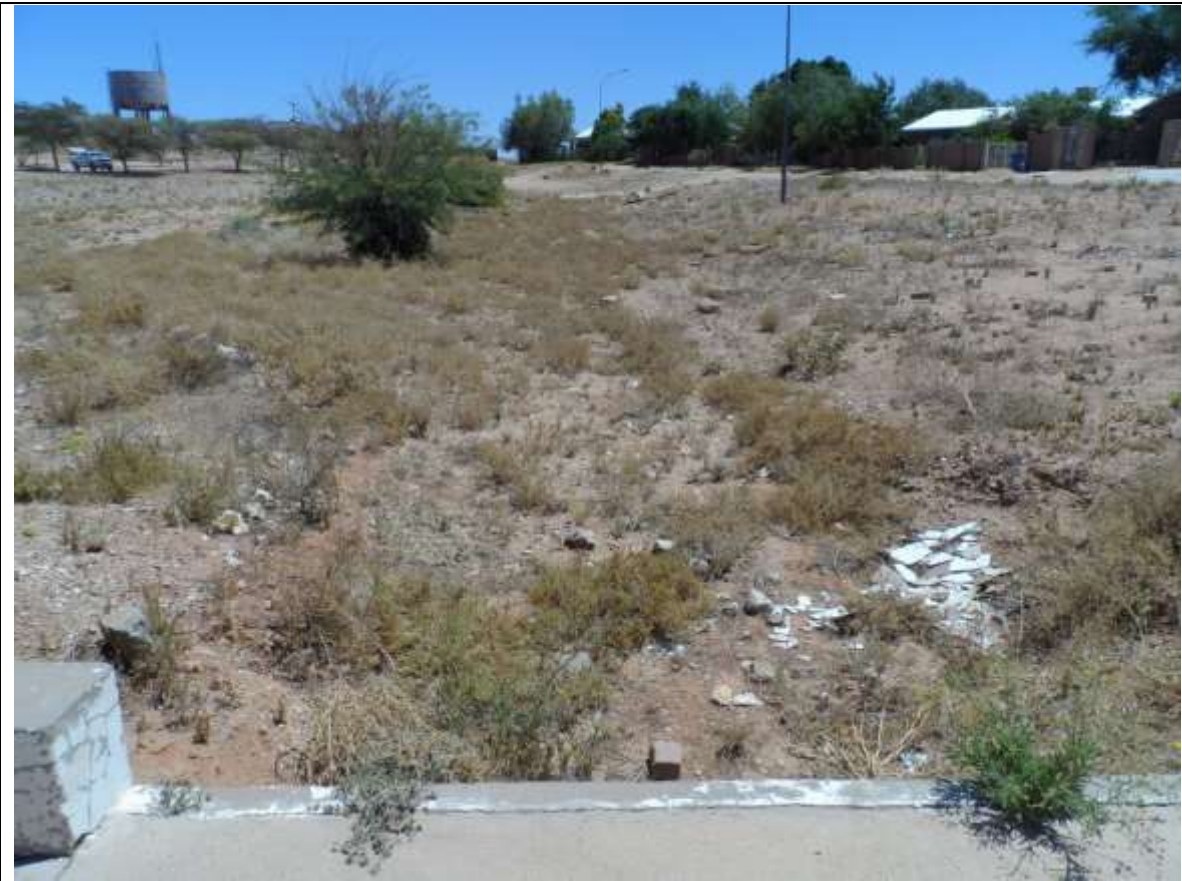
Figure 3: View of the ephemeral stream, looking north west.