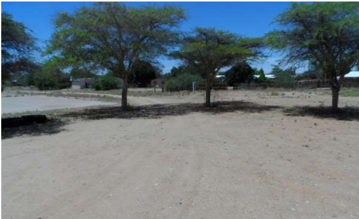
Figure 7: General view of the site. The existing tennis/netball court can be seen to the left of the image. There are thorn trees (soet doring) on site, but these appear to have been planted for landscaping purposes. There is no environmental advantage of keeping these, although where possible, they should be retained.