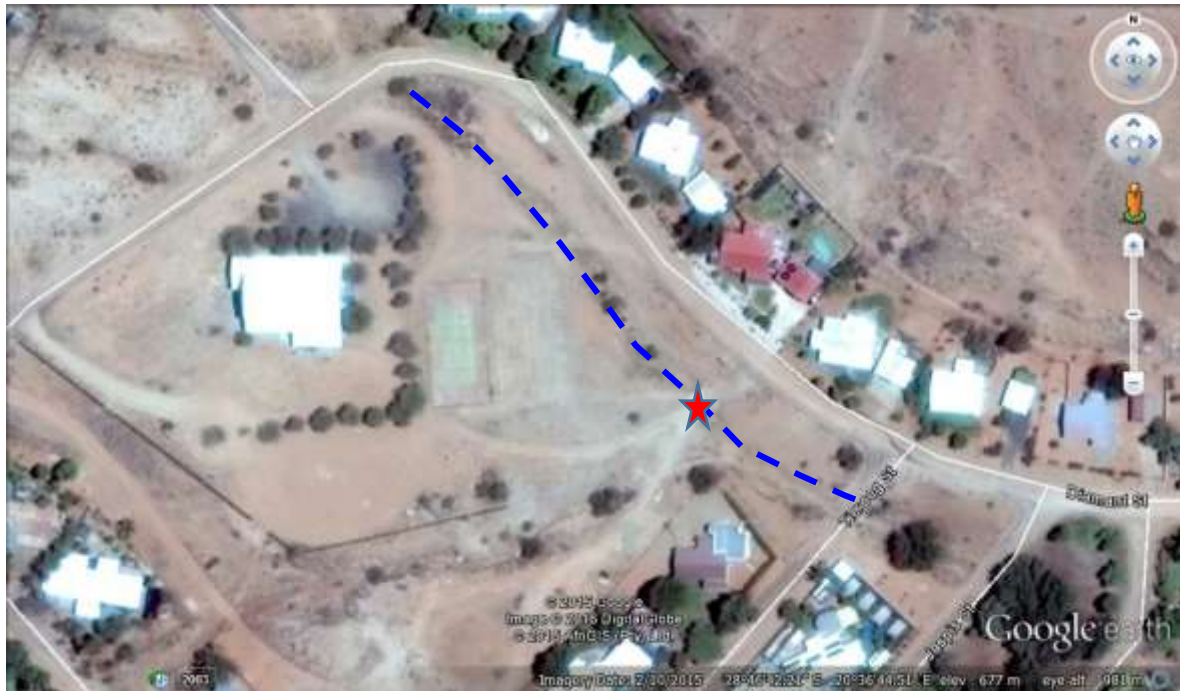
Figure 2: Google Earth image of the site, showing the ephemeral stream (blue dashed line). The red star indicates the location of the photographs taken in Figure 3 and 4 below.

A small ephemeral stream or stormwater drain crosses the site the northern part of the site to the south-east. This stream is currently dry, and only appears to briefly flow during heavy rain or storm events. The stream will be incorporated into the stormwater system of the proposed development.