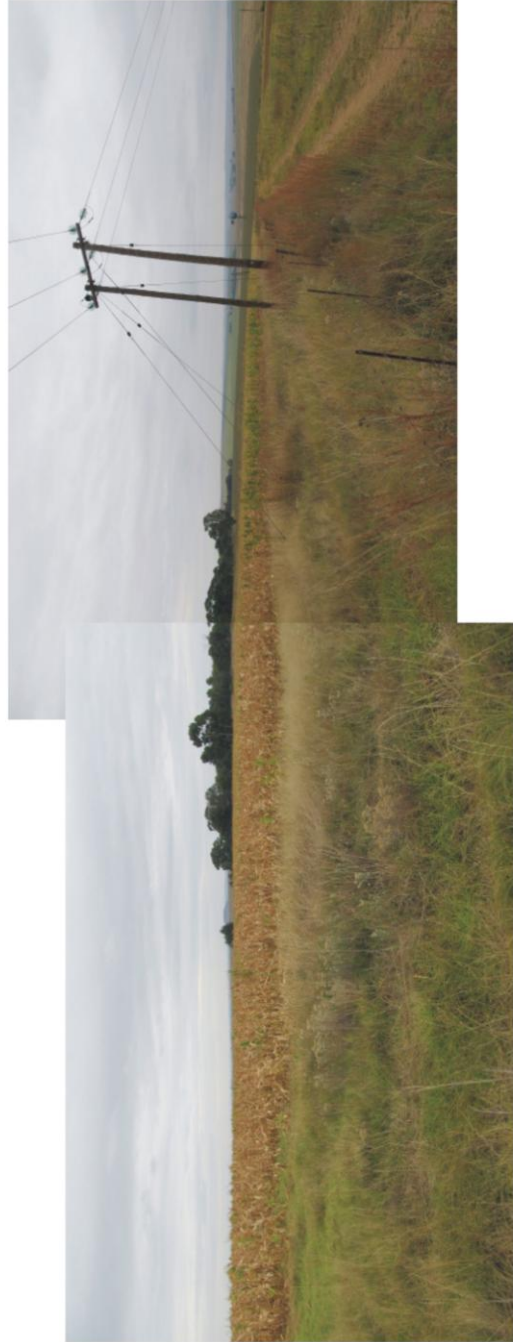
Figure 4. General view of the agricultural areas designated for development.