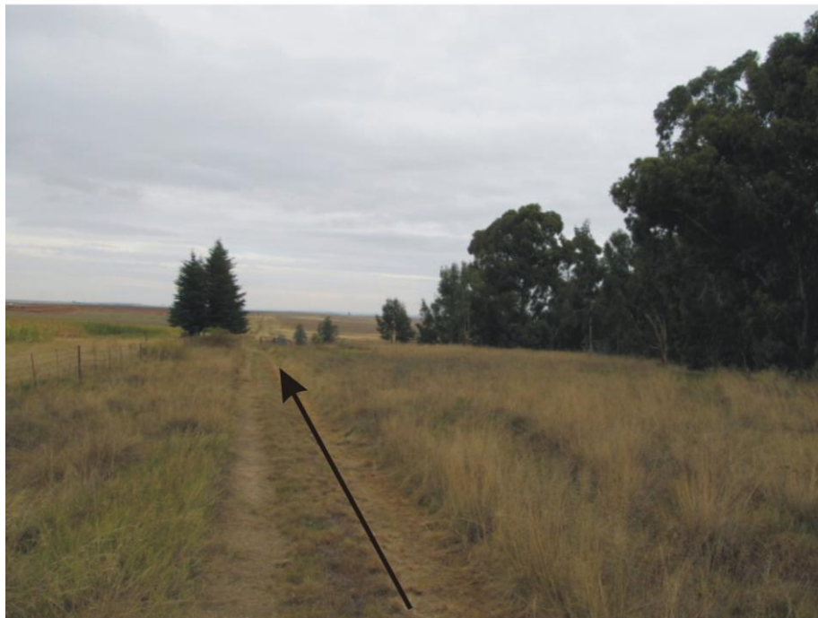
Figure 3. Existing access roads to the sites.