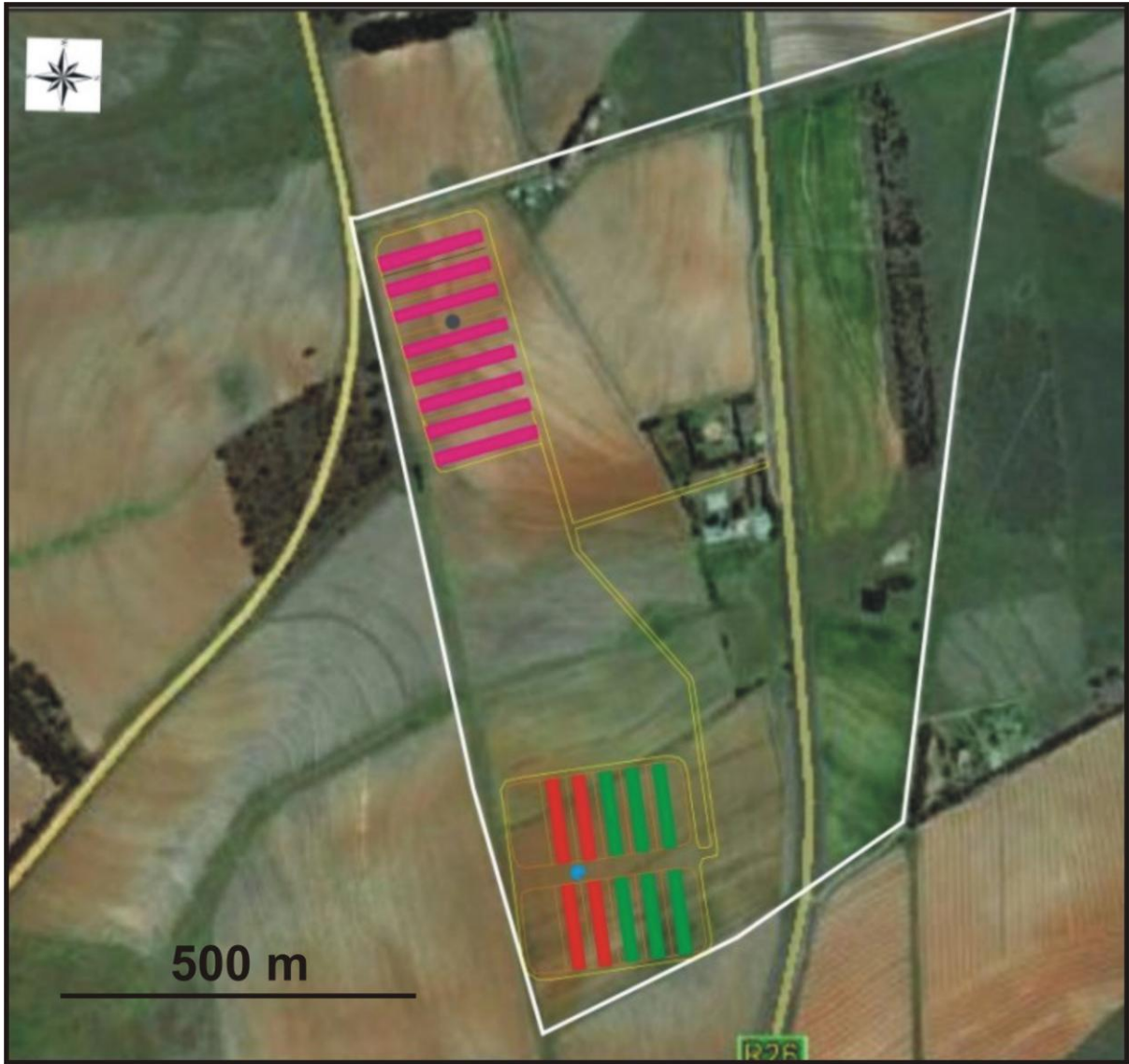
Figure 2. Aerial view of the proposed development. The broiler units will be erected on existing agricultural land currently utilized for crops.