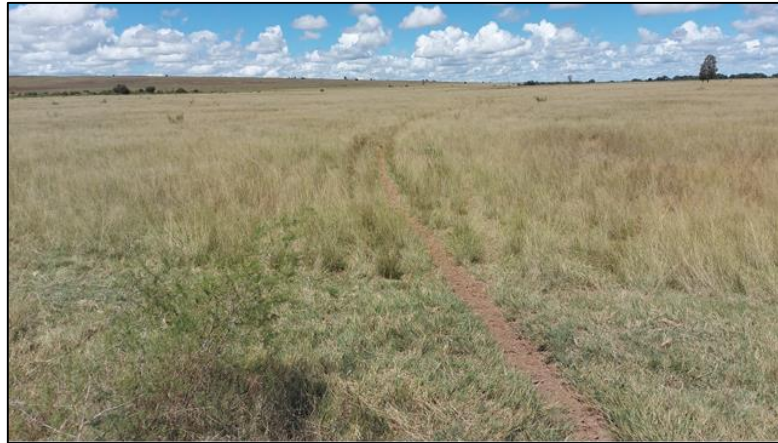
Figure 5. Typical site conditions on old cropped areas on the Vlakfontein site.