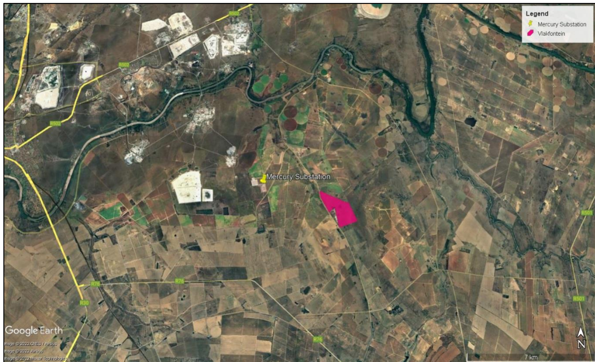
Figure 4. Locality of the proposed Vlakfontein Solar PV facility