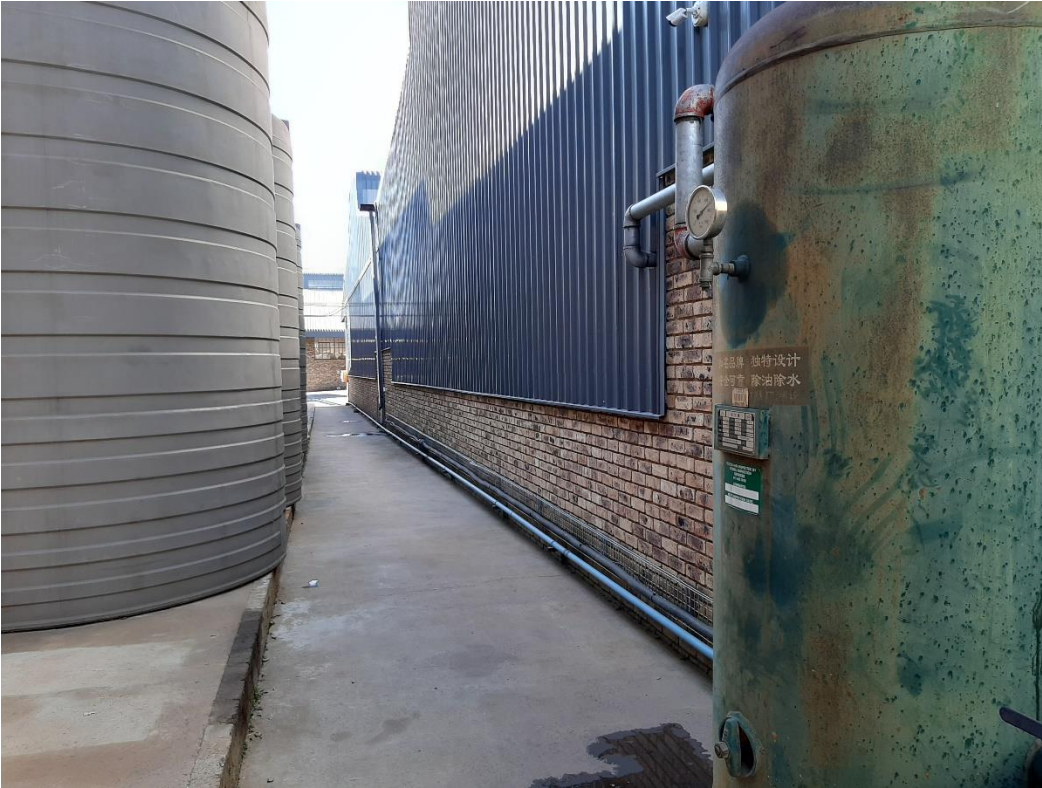
Figure 5: Fuel Facility northwest aspect 26^{\circ}12'35.22''\text{S} 28^{\circ}20'01.47''\text{E}