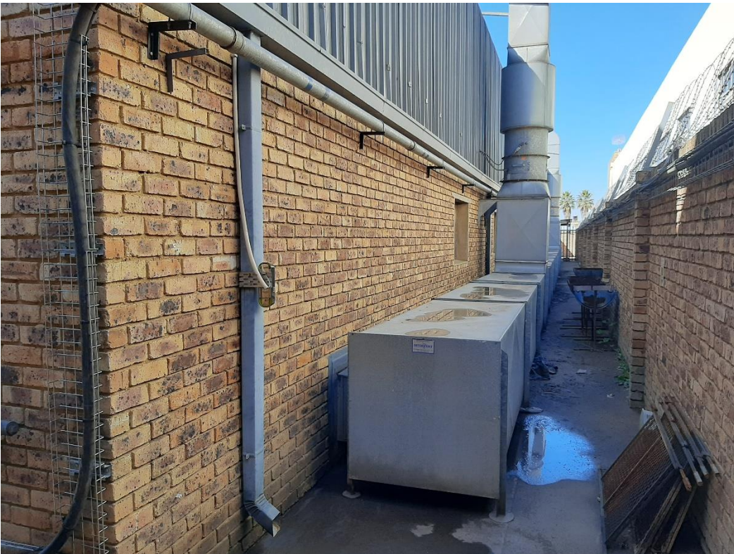
Figure 6: Fuel Facility southwest aspect 26^{\circ}12'35.22''\text{S} 28^{\circ}20'01.47''\text{E}