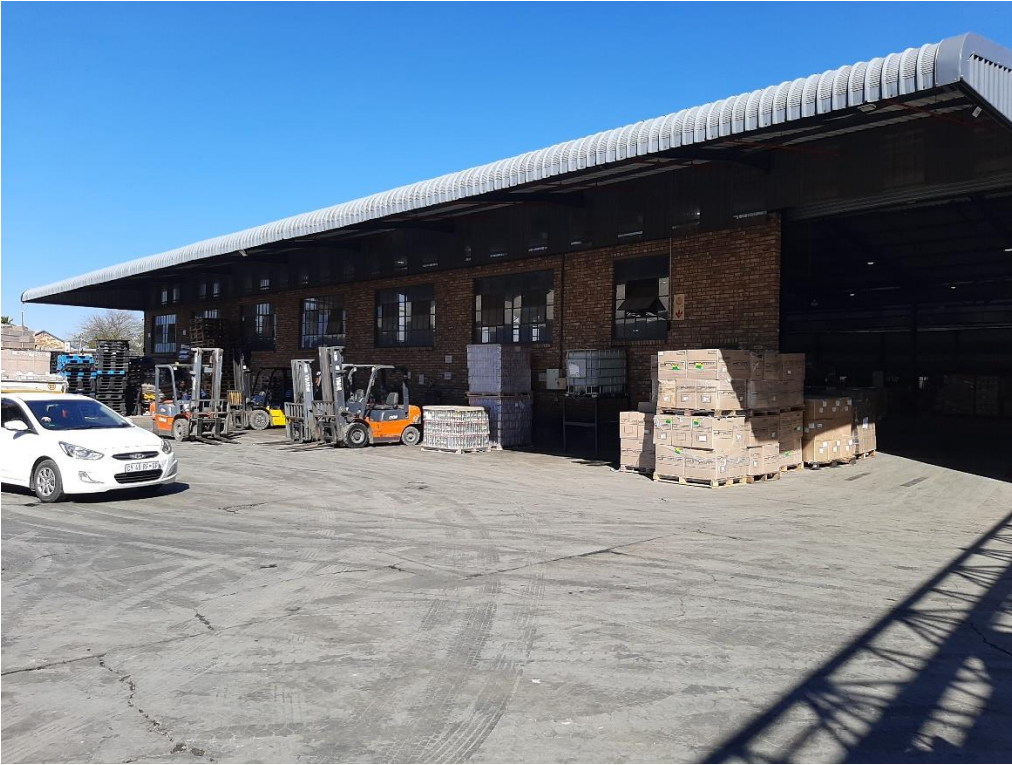
Figure 3: North-eastern aspect of the Fuel Facility 26^{\circ}12'33.64''\text{S} 28^{\circ}20'02.86''\text{E}