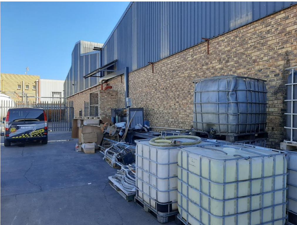
Figure 4: South-eastern aspect of the Fuel Facility 26^{\circ}12'34.69''\text{S} 28^{\circ}20'04.05''\text{E}