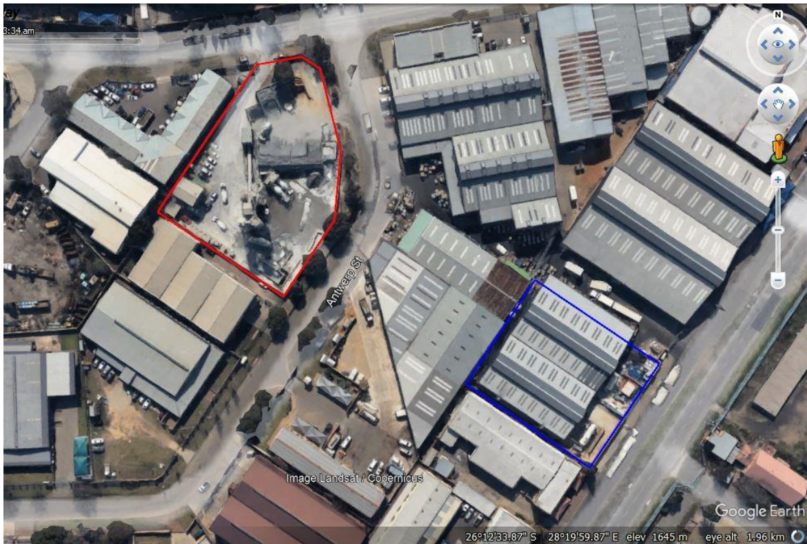
Figure 1: Google Earth photo indicating the study sites (red: Chemical Facility, blue: Fuel Facility)

The study sites were visited and the relevant literature and geological map for the study area in which the development is proposed to take place (see Fig. 1) have been studied for a Palaeontological Impact Assessment.