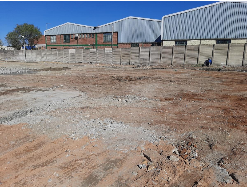
Figure 8: Chemical Facility facing southwest from 26^{\circ}12'31.33''S 28^{\circ}19'58.81''E