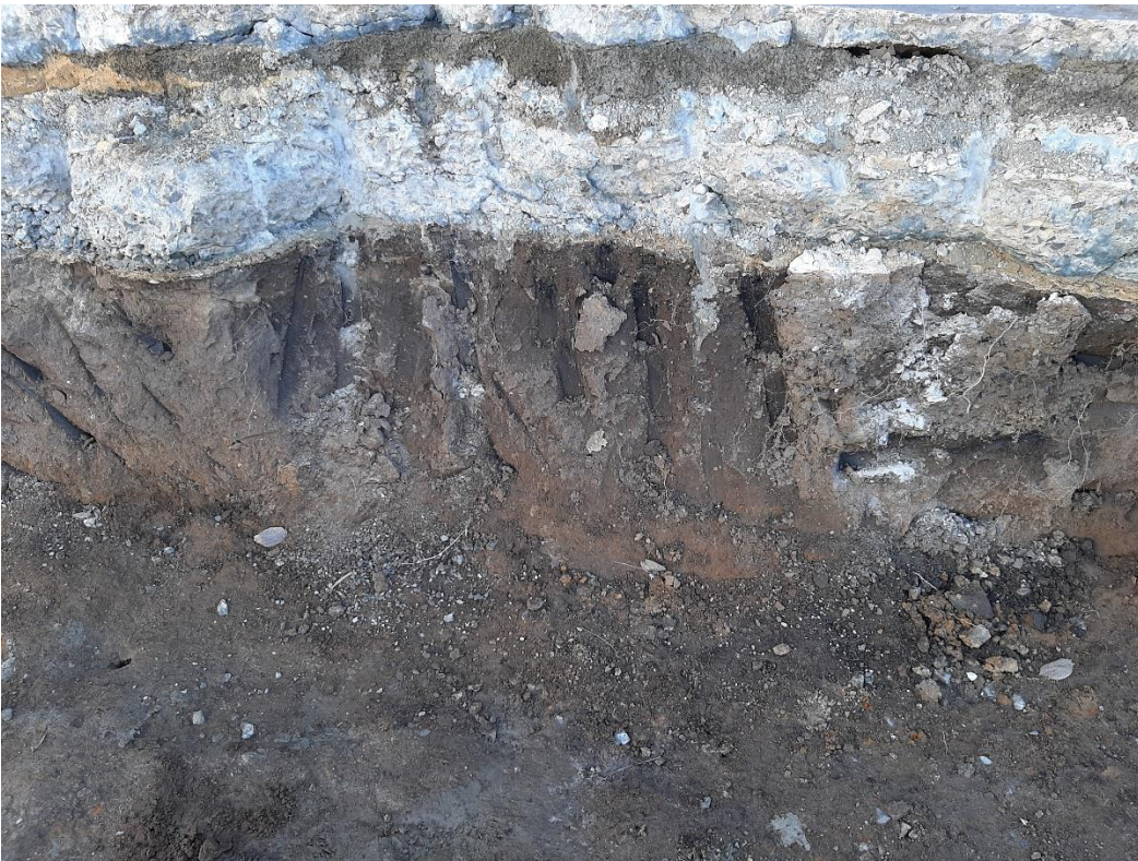
Figure 10: Excavation exposing weathered rock and soil under old concrete surface at 26°12'31.10"S 28°19'58.83"E