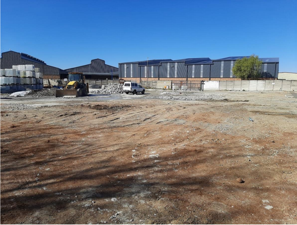
Figure 9: Chemical Facility facing south from 26°12'31.33"S 28°19'58.81"E