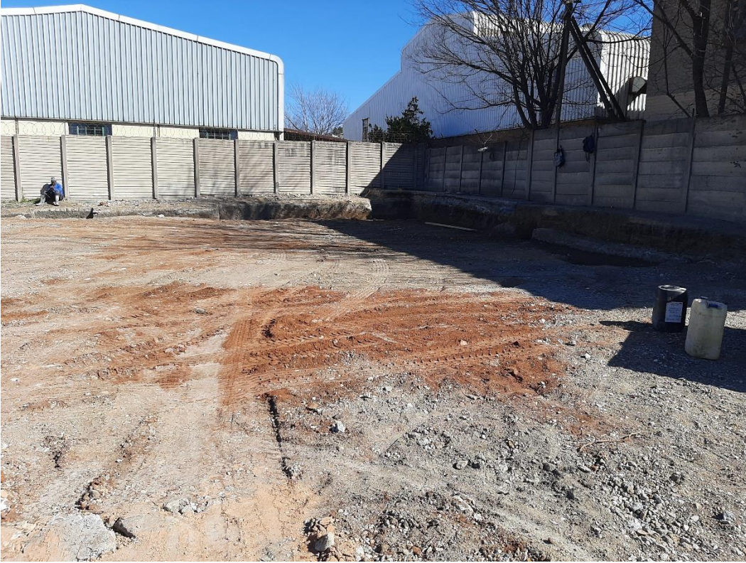
Figure 7: Chemical Facility facing northwest from 26^{\circ}12'31.81''S 28^{\circ}19'59.46''E