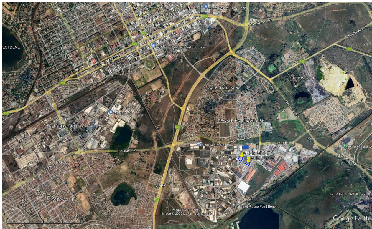
Figure 2: Location of the sites in relation to Benoni.