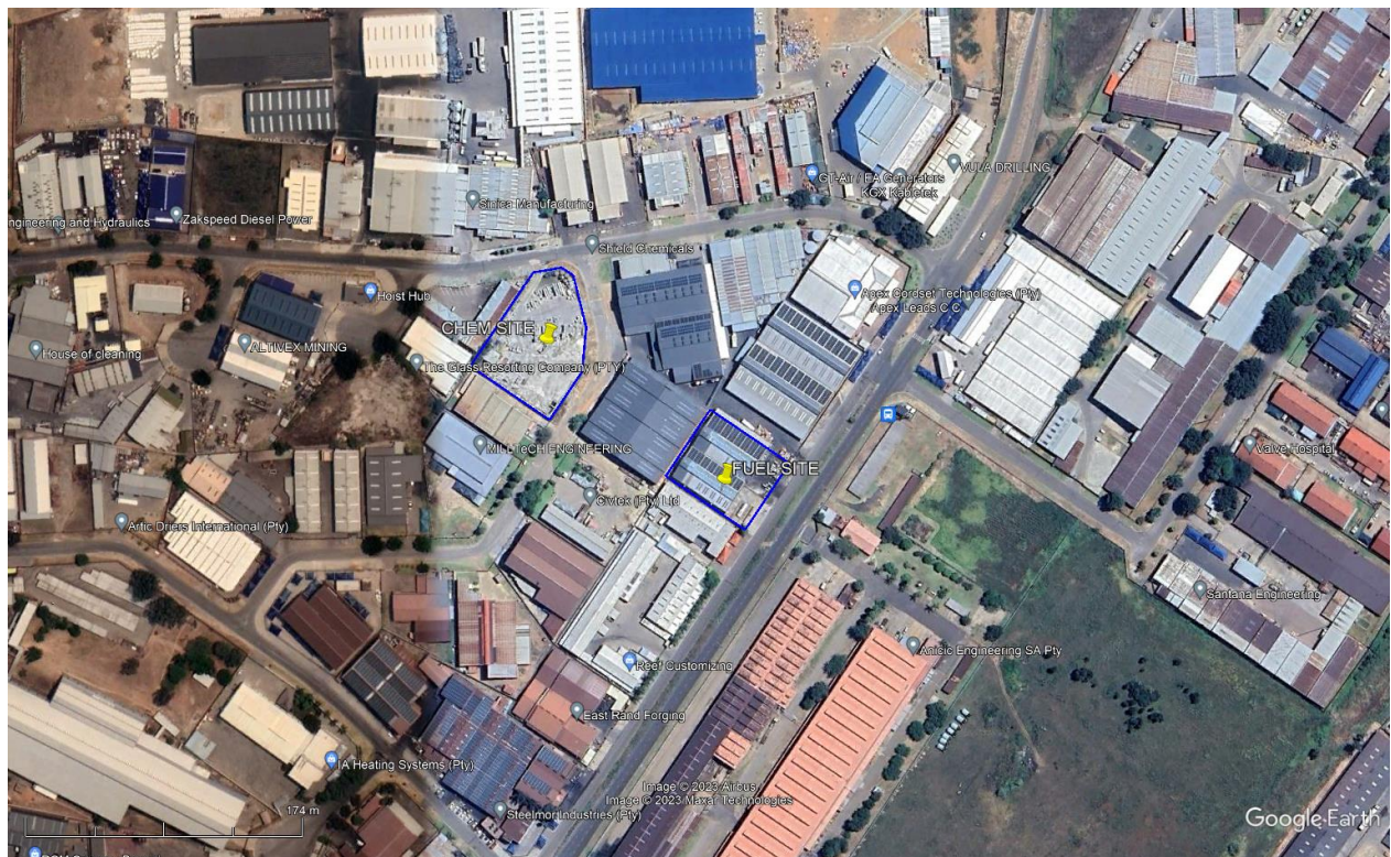
Figure 3: Detailed view of the location of the sites.