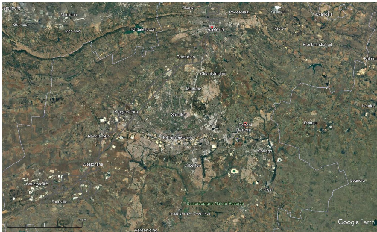
Figure 1: Location of Benoni in the Gauteng Province.

The above-mentioned project refers. The project consists of two sites, namely at Erf 179 Apex X3, 18 Apex Road West, Benoni, City of Ekurhuleni and Erven 265 & 266 Apex X4, corner London and Antwerp streets, Benoni, City of Ekurhuleni (Figure 1-4). The applicant is Shield Chemicals (Pty) Ltd (Figure 1-3).