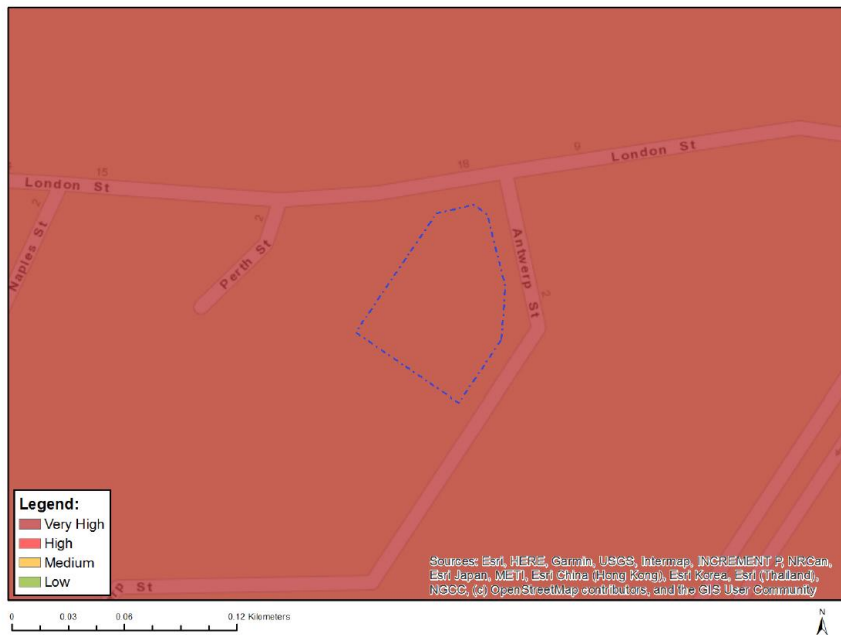
Figure 6: Environmental Screening Tool map for the chem site indicating archaeology as a high risk.

In light of these factors, the chances of finding any heritage related features are indeed extremely slim, if any. This letter serves as an exemption request to the relevant heritage authority.