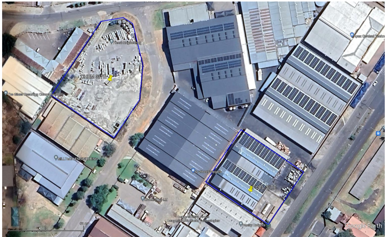
Figure 4: Detailed view of the sites. Note it being entirely disturbed by recent human interventions