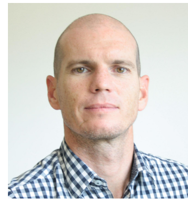
YEARS WITH THE FIRM 13