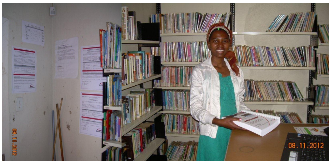
Figure 3.12: Perdekop Public Library