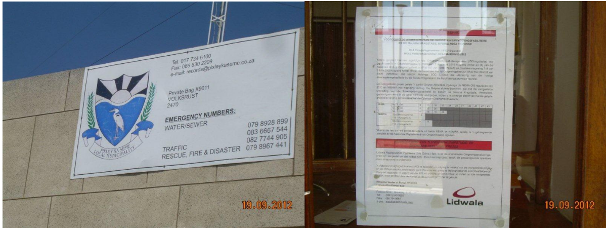
Figure 3.2: Amersfoort Local Municipal Offices