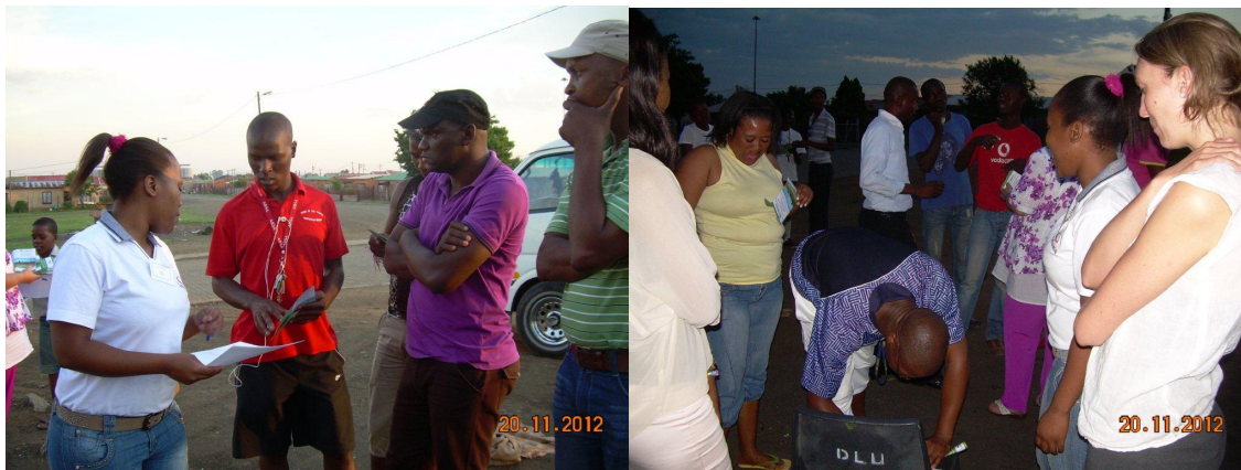
Figure 3.8: Consultation with the local community at the Public meeting in Amersfoort

The comments raised during the meetings were recorded in the updated C&RR and included in Final Scoping Report ( Appendix E ).