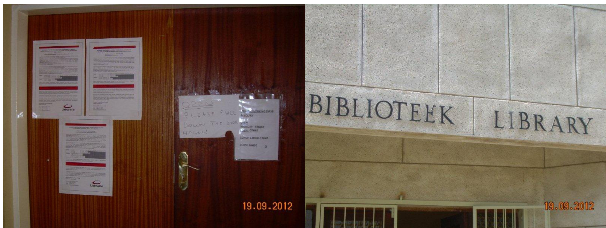
Figure 3.3: Amersfoort Library