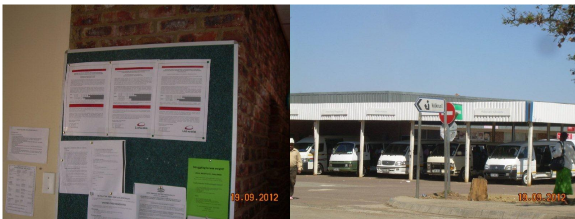
Figure 3.6: Volksrust Library