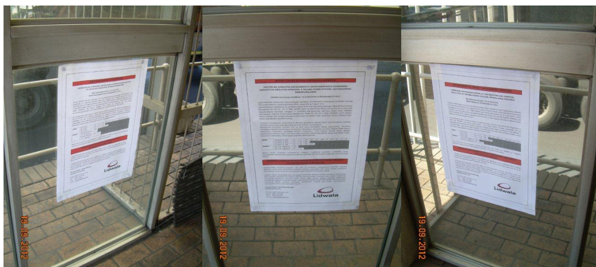
Figure 3.1: Majuba Power Station - Reception