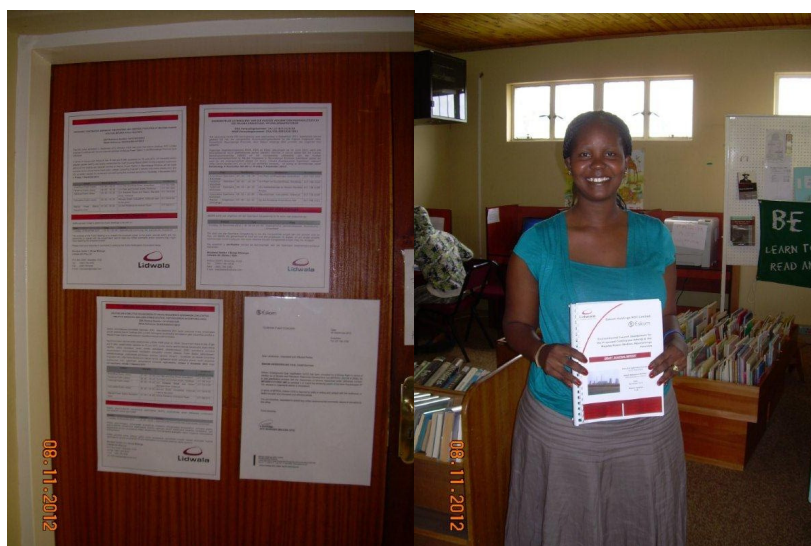
Figure 3.10: Amersfoort Public Library

All registered I&APs were notified of the availability of the DSR and invited to attend the public meeting in writing. A 30 day comment period was provided for public review and comments. Comments received during the review period were included in the C&RR which will be included in the Final Scoping Report.