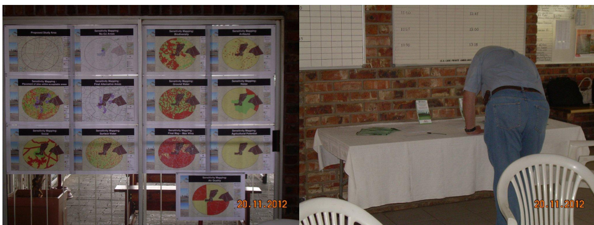
Figure 3.9: Landowner meeting held at the Amersfoort Country Club