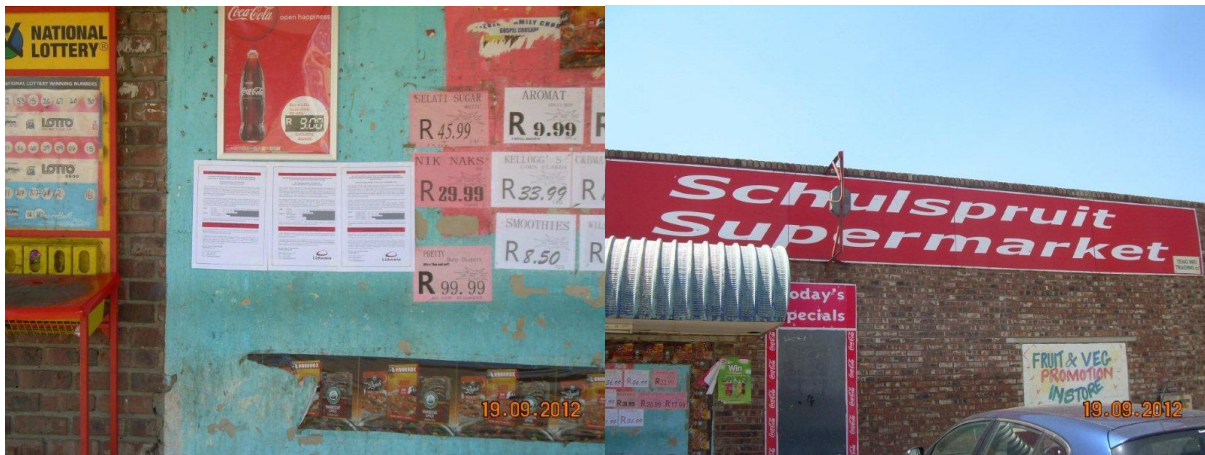
Figure 3.5: Schulspruit Supermarket