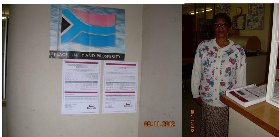
Figure 3.13: Vukuzakhe Public Library