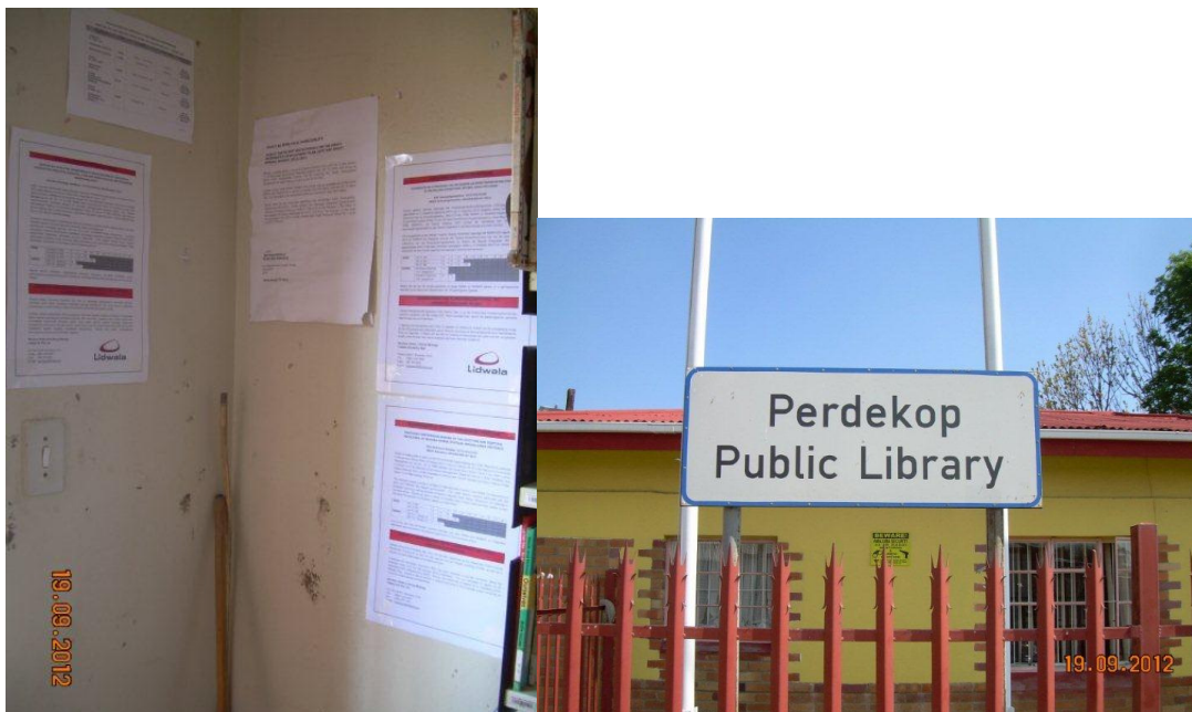
Figure 3.4: Perdekop Public Library