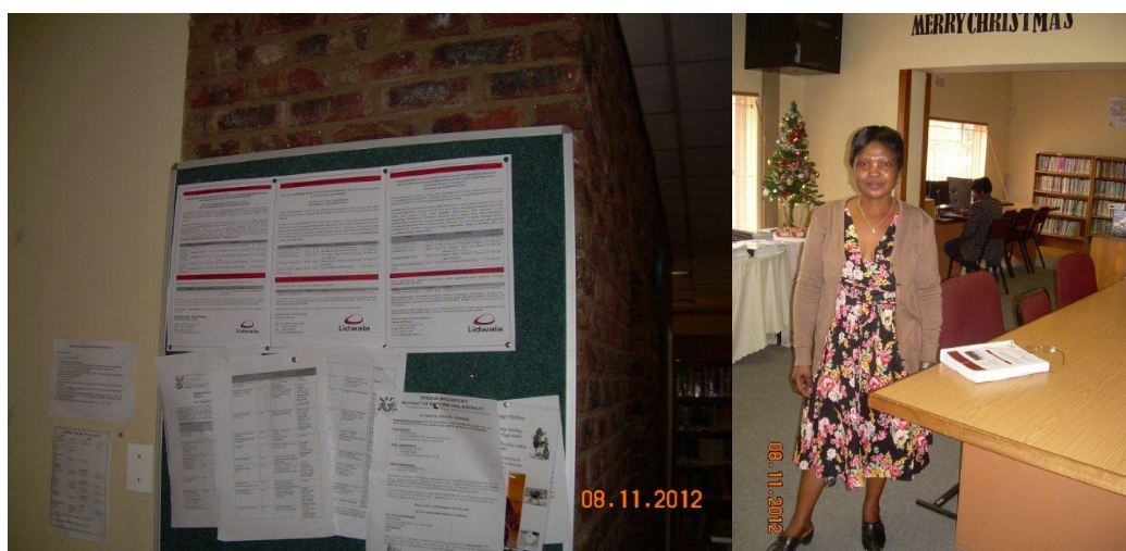
Figure 3.11: Volksrust Public Library