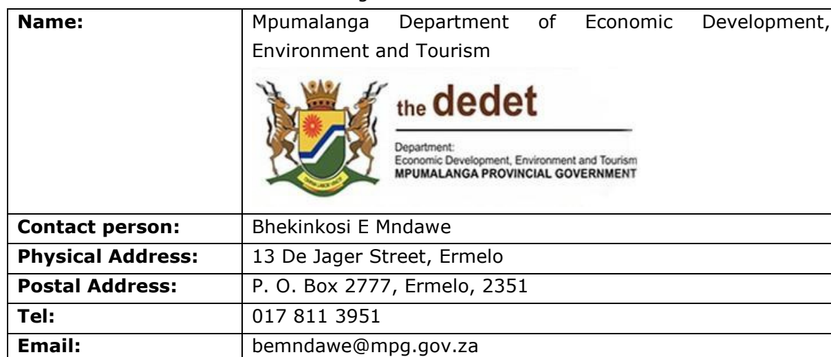
Table 2.5: Details of the commenting authorities – MDEDET

The Mpumalanga Department of Economic Development, Environment and Tourism (MDEDET) and the Department of Water Affairs (DWA) will act as a commenting authority for this application.