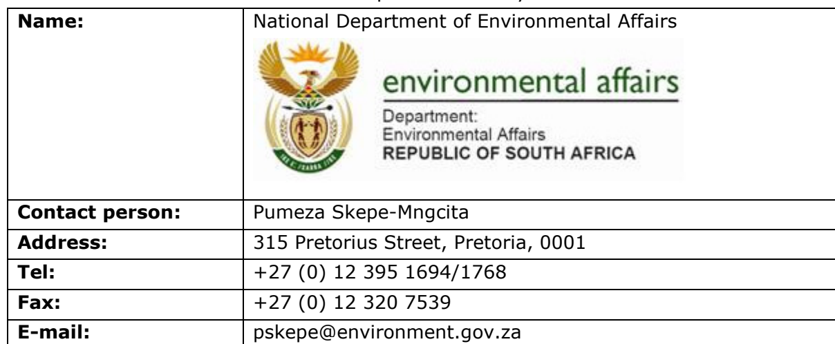
Table 2.4: Details of the relevant competent authority – DEA

The National Department of Environmental Affairs (DEA) will act as the competent authority and the DWA and MDEDET as the commenting authority for this application. The mandate and core business of DEA is underpinned by the Constitution and all other relevant legislation and policies applicable to the government.