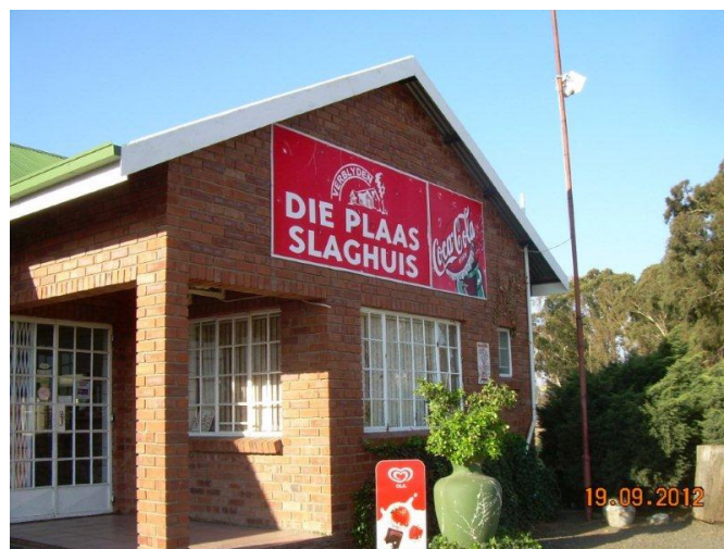
Figure 3.4: Die Plaas Slaguis