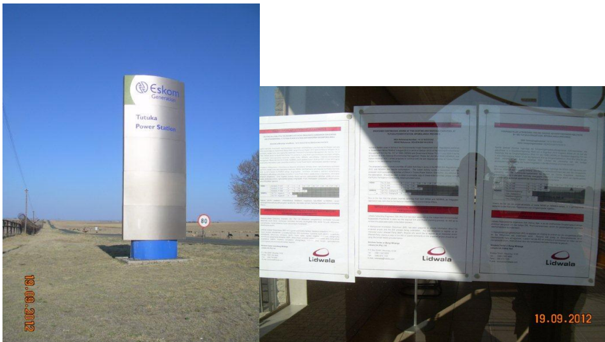
Figure 3.1: Tutuka Power Station