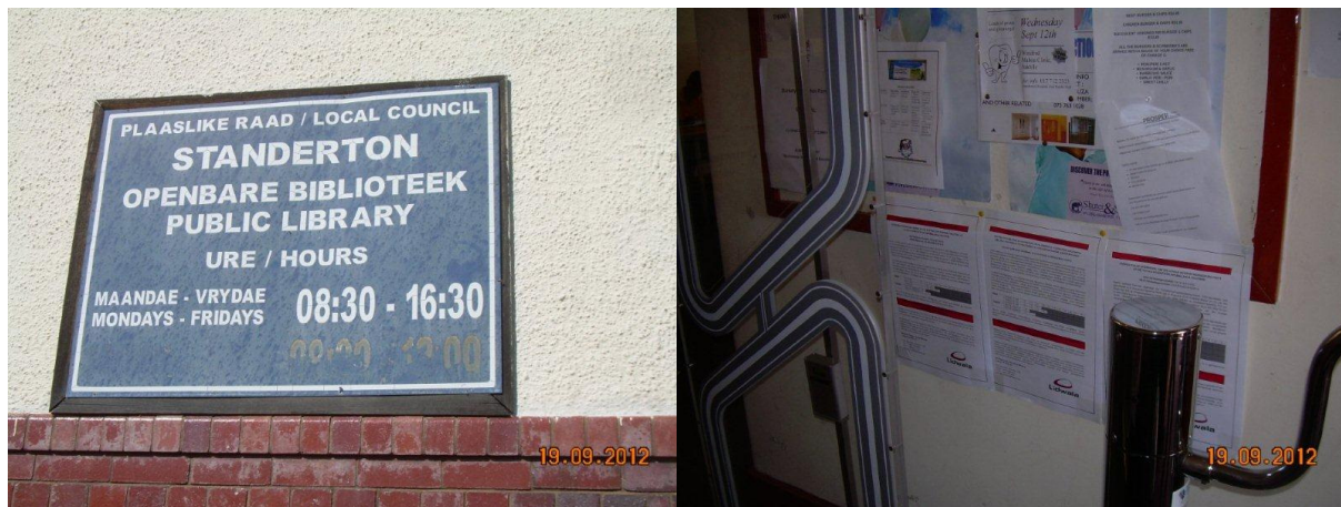
Figure 3.3: Standerton Public Library