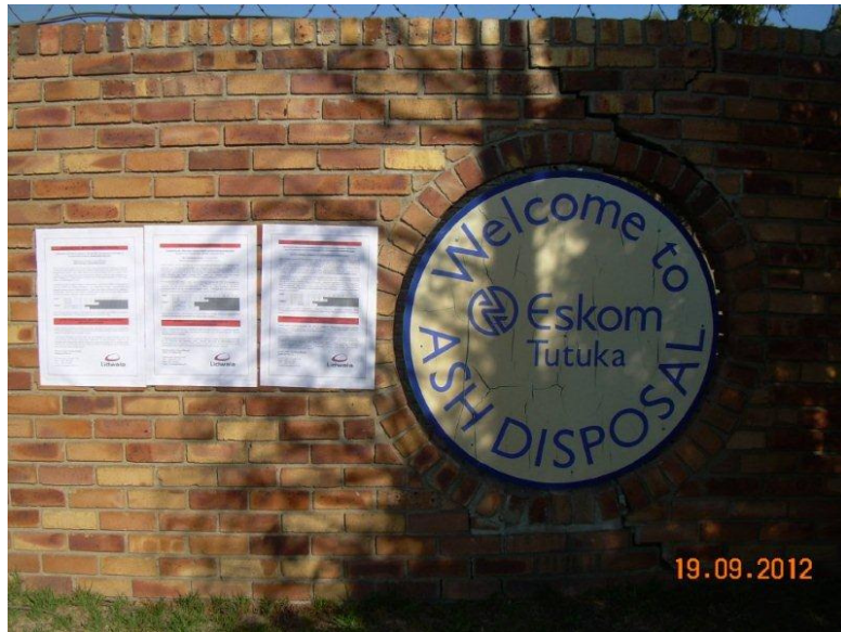
Figure 3.2: Tutuka Power Station Ash Disposal Site (Entrance)