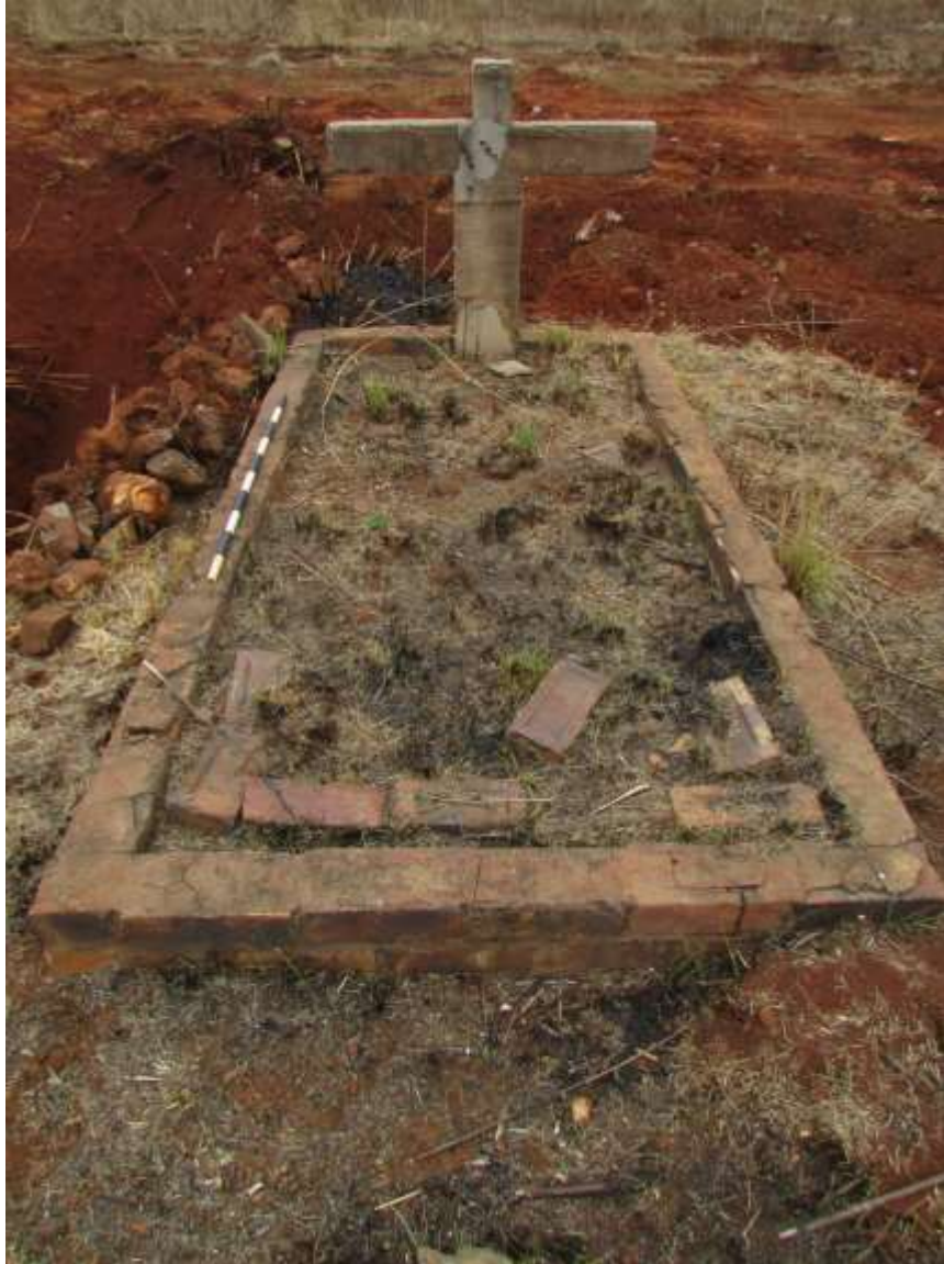
Figure 6: Cement cross on grave SF55.