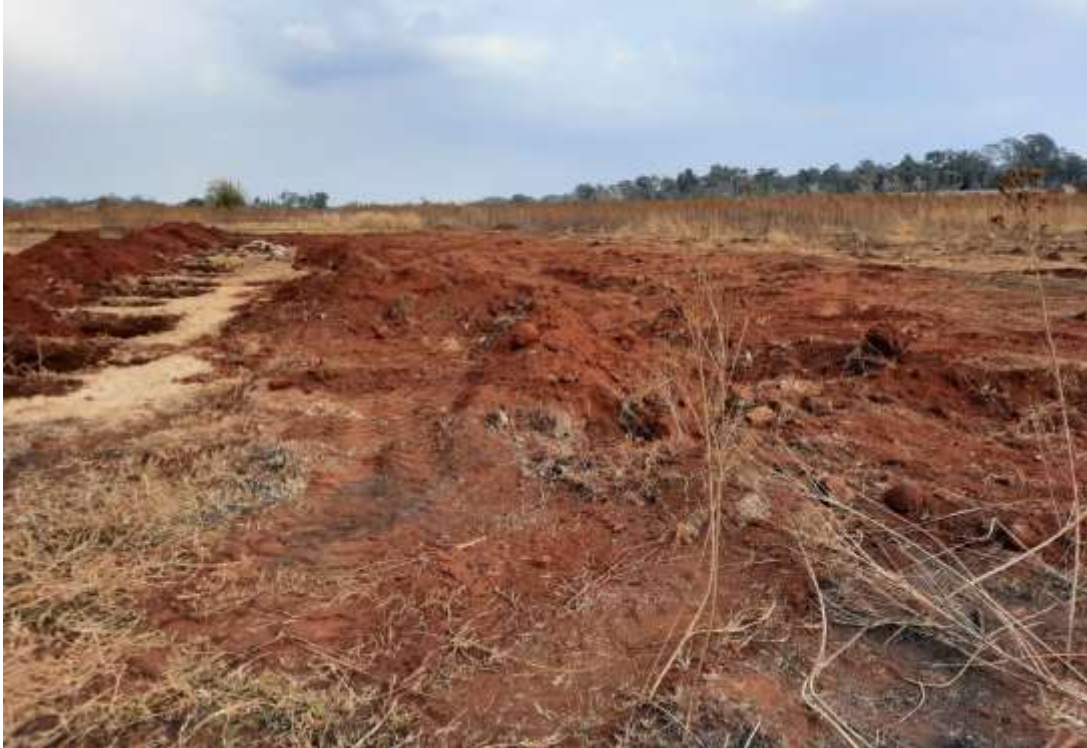
Figure 4: General view of the site after completion of the exhumation & relocation work in June 2021.