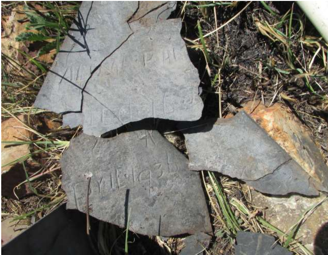
Figure 5: The slate headstone on the grave of Alina R. Jali (Grave SF28). She died on the 16 th of April 1936.

The headstones of these three individual were on slate with the inscriptions carved into them. Because of factors such as veld fires and other natural exposure these do crack and fracture, with parts of the headstones where these inscriptions would have been not preserved anymore. Two other graves had headstones. One was a formal cement headstone in the form of a cross, while the other was a metal plaque. Both had no inscriptions on them.