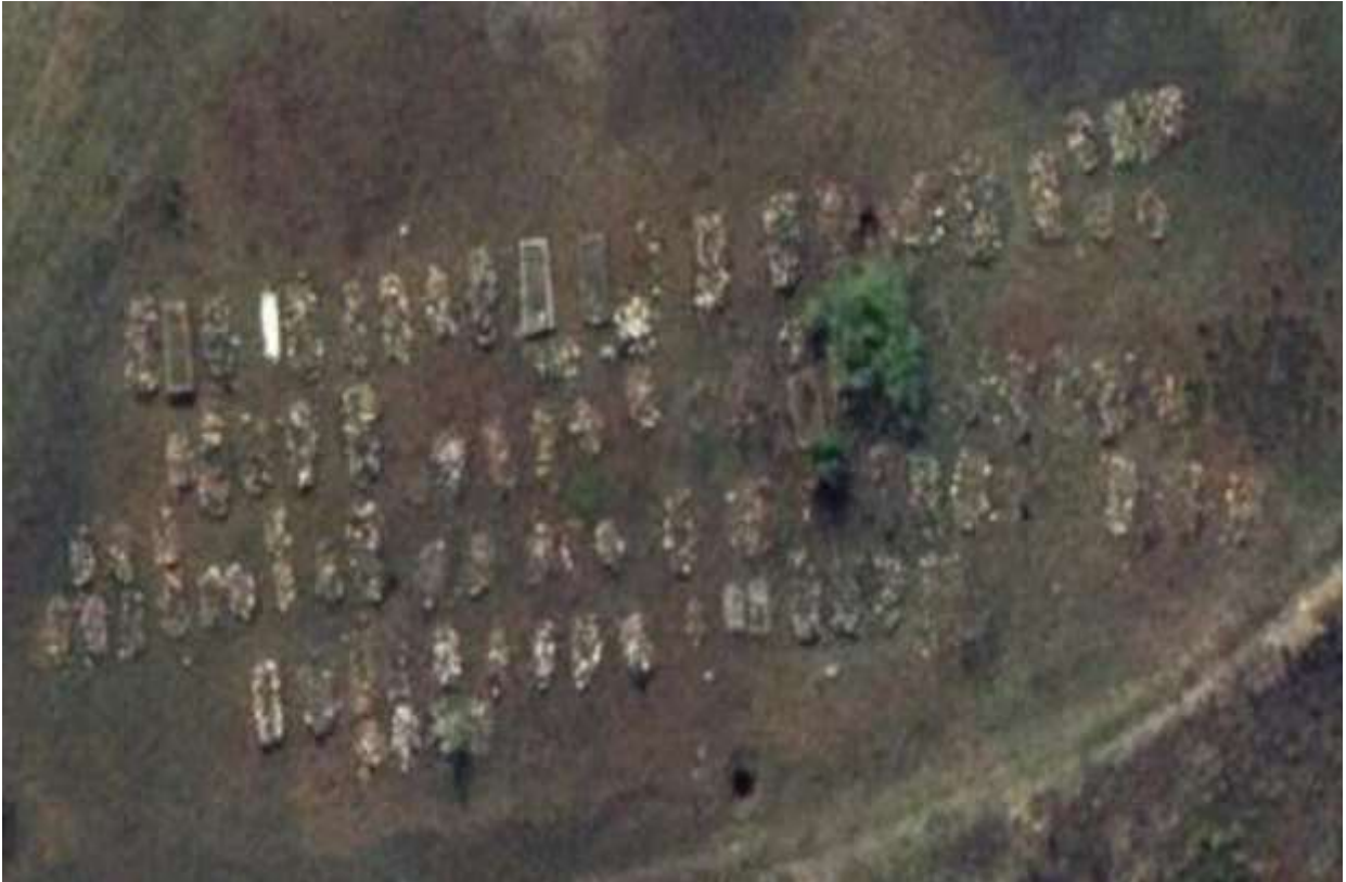
Figure 3: Detailed view of grave site showing the individual graves.