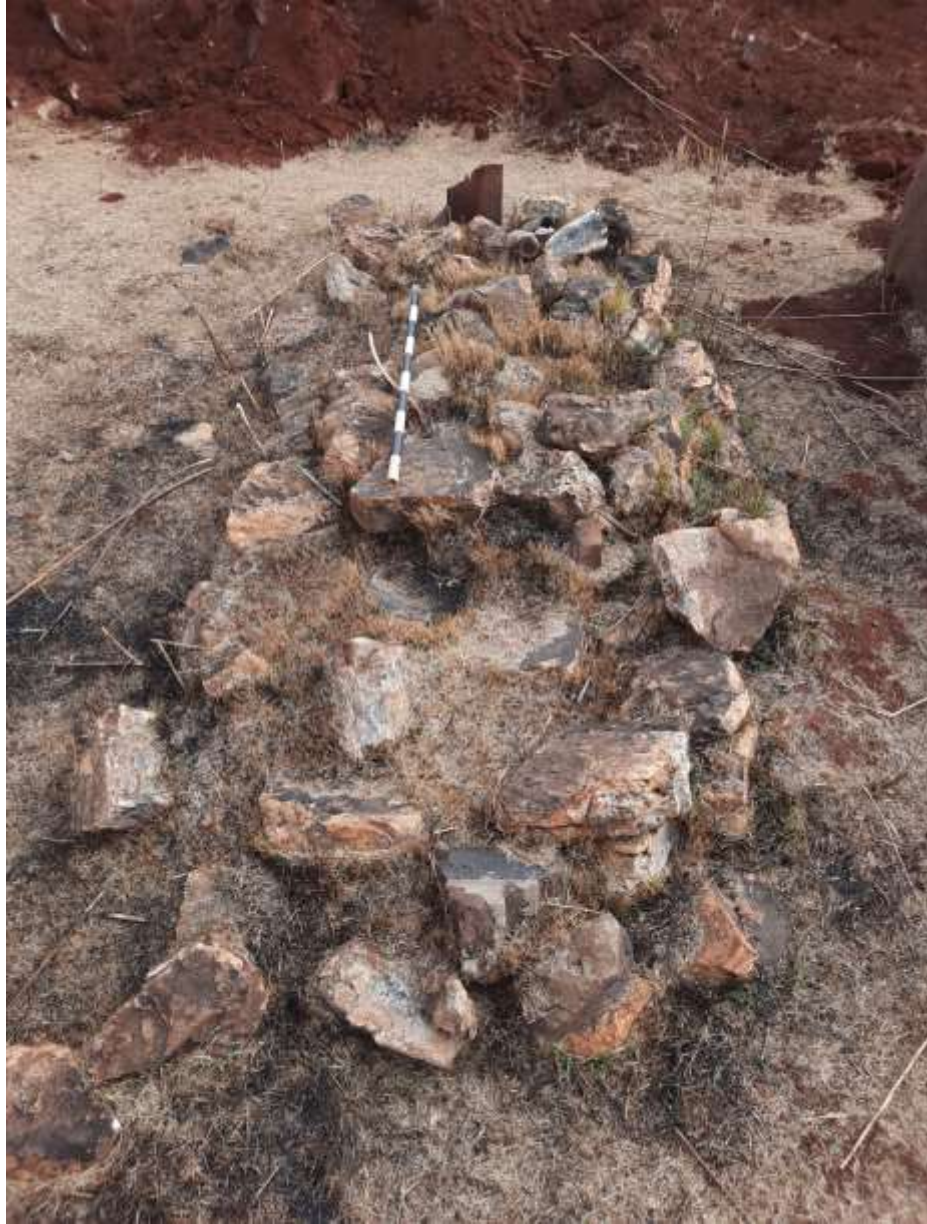
Figure 8: Grave SF102 had a metal plaque as headstone.