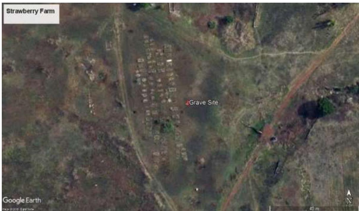
Figure 2: Closer view of Strawberry Farm Grave Site Location.