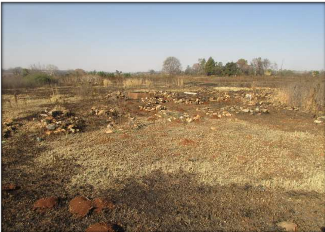
Figure 3: General view of the grave site.