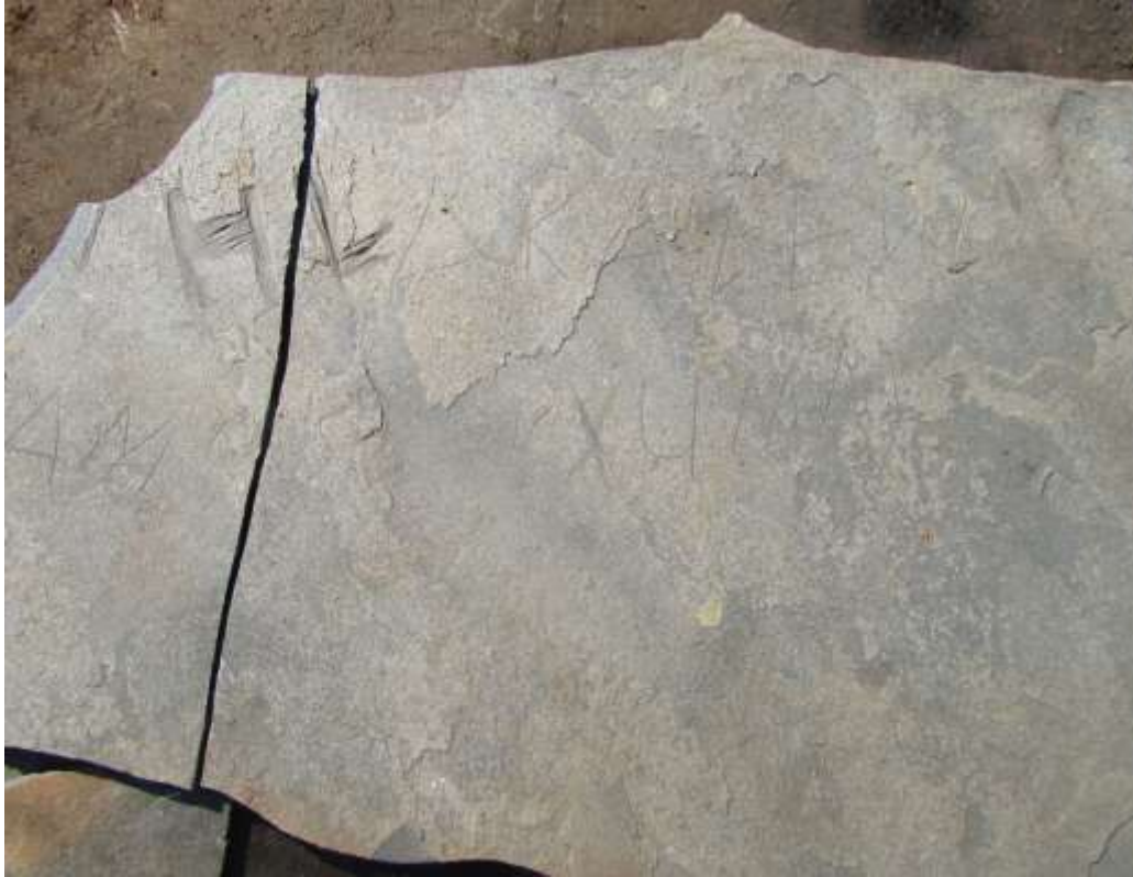
Figure 7: The slate headstone from the grave of Nhlakazeni Amos Nxumalo Grave SF64.