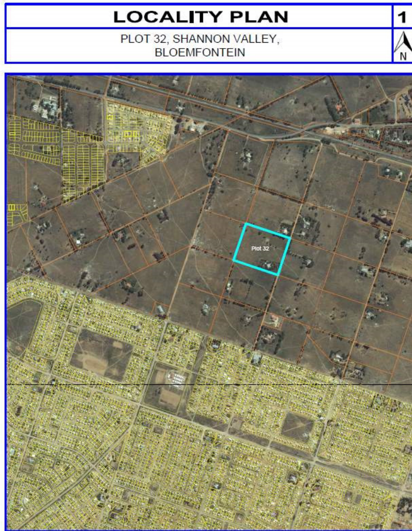
FIGURE 1 – LOCALITY OF THE PROPOSED SITES SHOWING THE RELEVANT PLOTS

THIS APPLICATION DEALS WITH THE PROPOSED ESTABLISHMENT OF A TOWN ON PLOT 32, SHANNON VALLEY HOLDINGS, BLOEMFONTEIN. THE SITE IS 4.2827HA IN EXTENT. THE ABOVE MENTIONED PROPERTY CAN BE SEEN ON THE PLANS BELOW AND ATTACHED APPENDIX A & C.