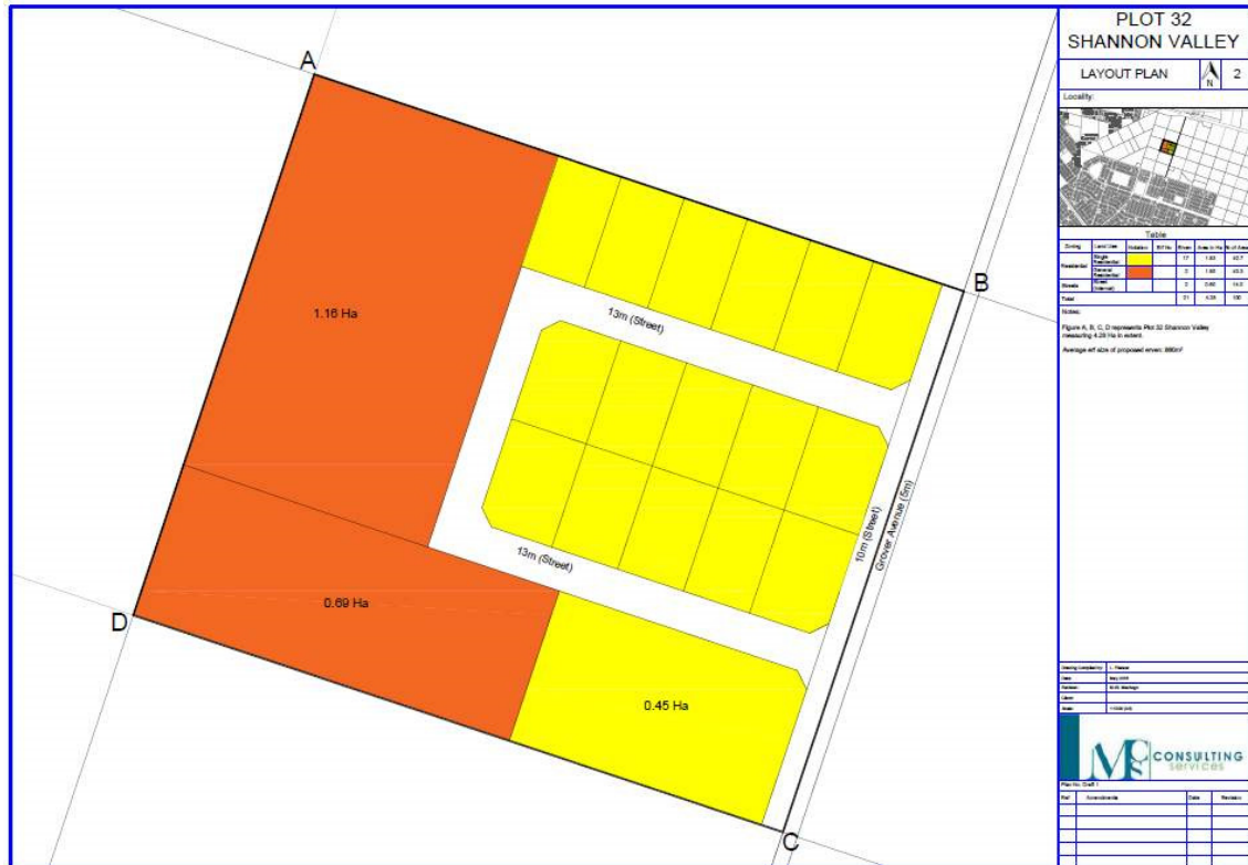
FIGURE 2 – LAYOUT MAP OF THE PROPOSED TOWNSHIP DEVELOPMENT

THE PROPOSED TOWNSHIP DEVELOPMENT WILL CONSIST OF 19 ERVEN AND STREET BROKEN DOWN INTO: