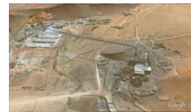
BMM concentrate plant site

Ore concentrate will be transported from the mine to the Port of Saldanha for export to global markets.