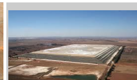
Typical tailings dam