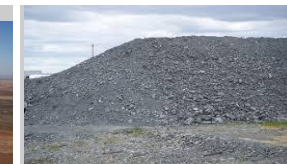
Typical waste rock dump