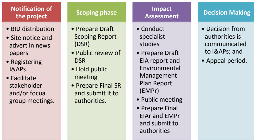
Figure 1: EIA process

Public Participation Process (PPP) is an integral part of the EIA process and aims to regularly involve I&APs by informing them on the progress of the project and encourage them to express their views and concerns. Through the EIA process the project will be transparent and allow I&APs to comment and raise concerns which are to be included in the Scoping and Impact Assessment Reports. A summary of key elements of EIA process is provided in figure 1 below: