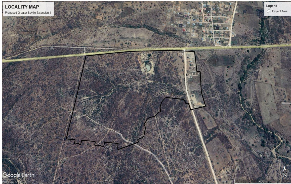
Figure 1: Aerial locality map of the proposed development site

KU in Seville, Mpumalanga Province. The project area is located approximately 18km from Thulamahashe town. The site is located roughly at the following GPS coordinates: 24° 39' 20.41" S; 31° 24' 34.19"E. Figure 1 and 2 below indicate the locality of the proposed development site and the SG 21 Digit Code is: TOKU000000002240000