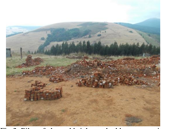
Fig 3. Piles of cleaned bricks packed by community