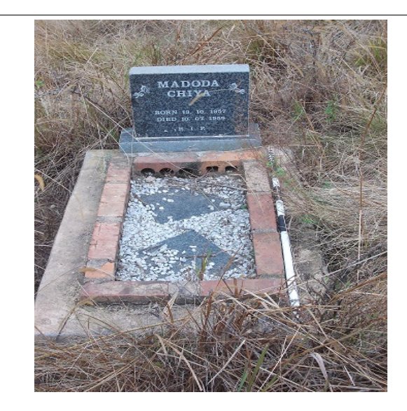
Fig 3. View of a grave at the cemetery

Mrs Sibayi mentioned that she knew of 2 other graves on the farm, a thorough survey of the area could not locate these graves. Care must be taken when developing the farm.