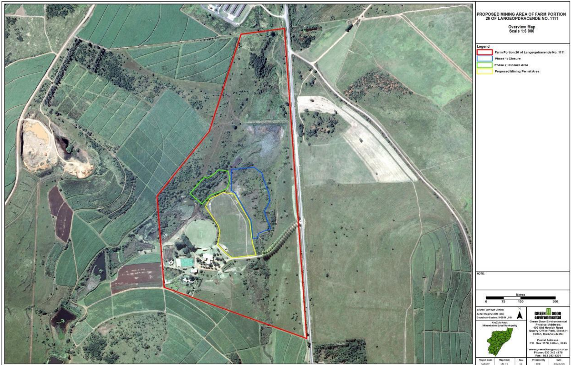
Figure 2: Overview Map of the site.