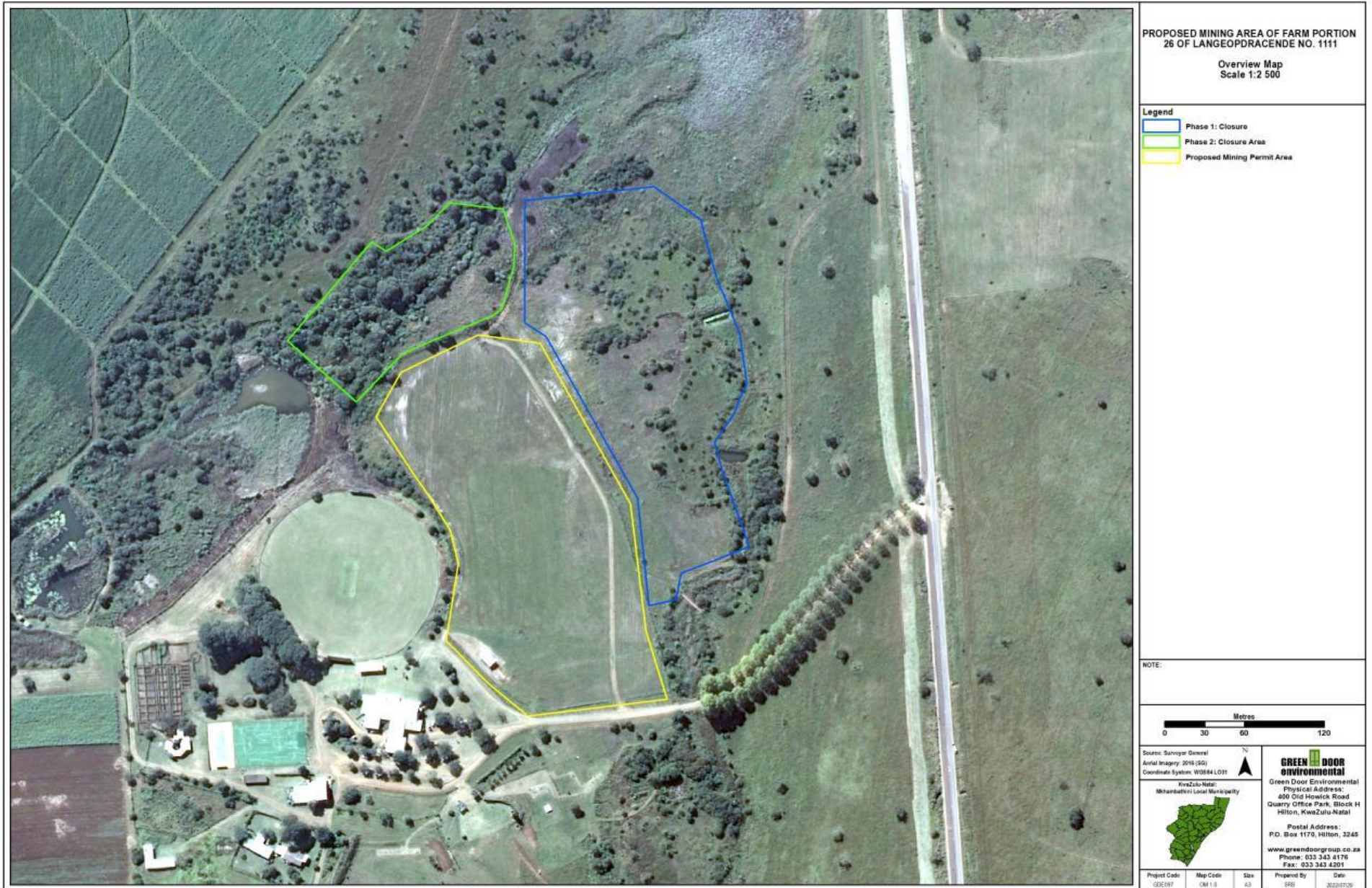
Figure 3: Overview Map showing the mining areas.