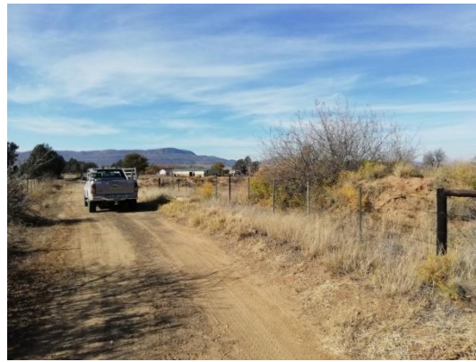
Existing gravel access road to the proposed project site passing neighbouring landowners.