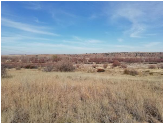
View to the south towards the proposed site from the dolerite outcrop.