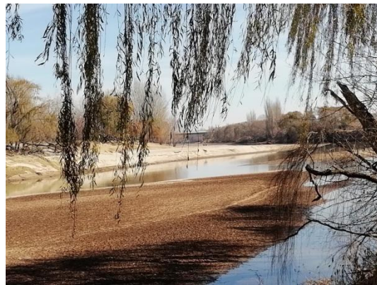
Indication of large sand deposits stretching along the bend at the preferred site.