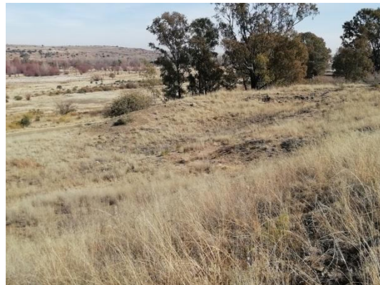
View to the south towards the existing farm house from the dolerite outcrop.