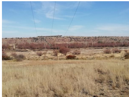
Powerline transecting the property in a north-south direction.