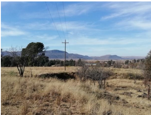
Powerline transecting the property in an east-west direction.