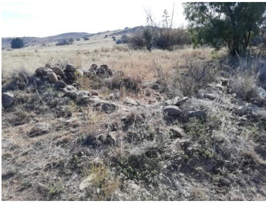
Remains of stone-wall enclosures on the dolerite outcrop approximately 1 km to the northwest of the proposed site.

Environmental Planning Services (PTY) Ltd