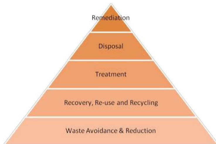
Figure 1: Waste Hierarchy: NWMS 2010

The fundamental focus of the NWMS, which aims to meet the key objectives of the Waste Act, is implementing the waste hierarchy, which is depicted in figure 1 below.