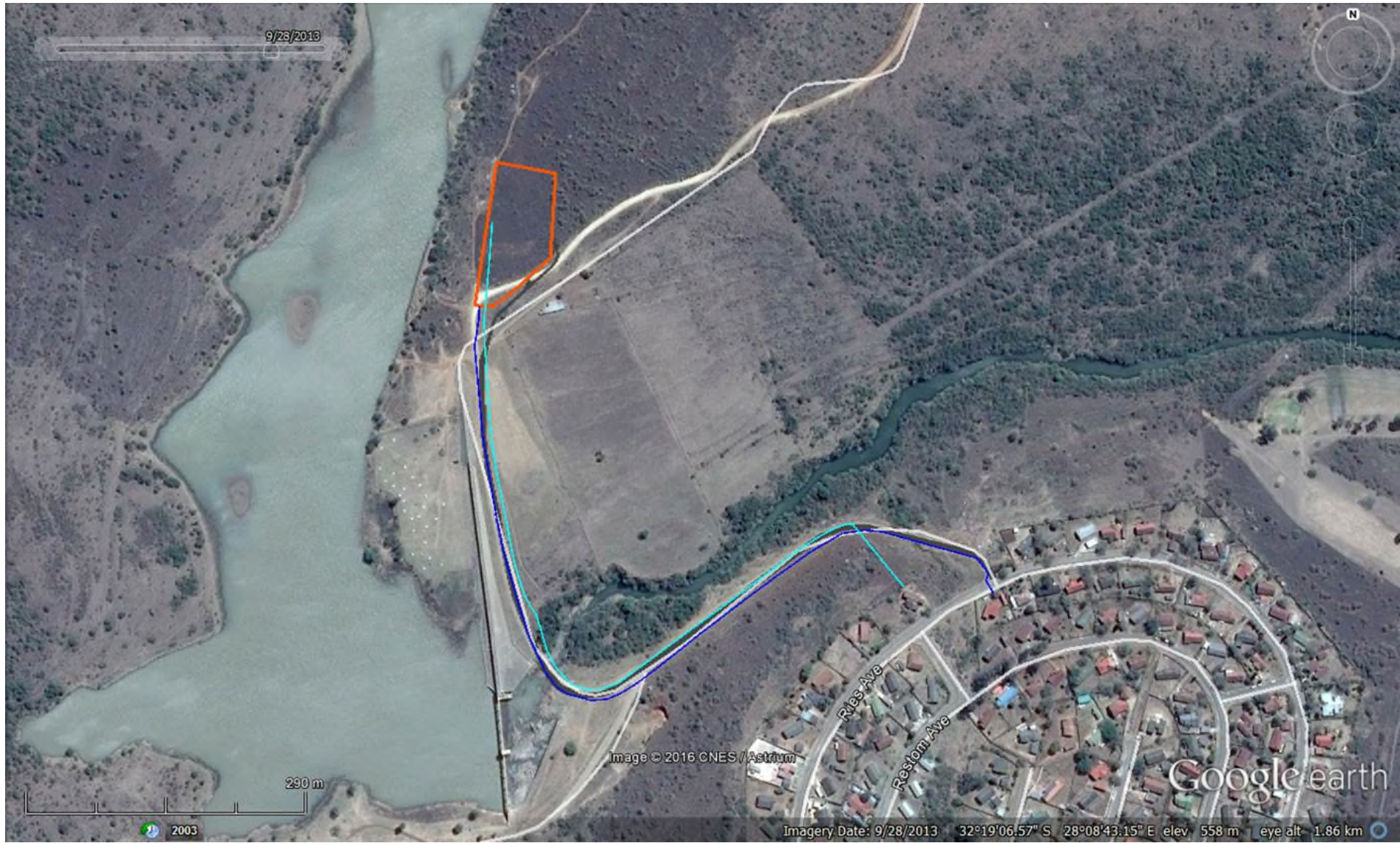
Locality map of the proposed development.