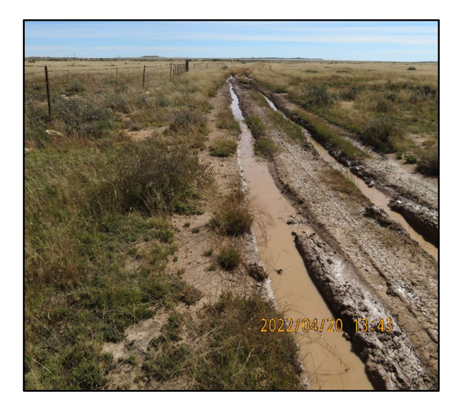
Photo 6: Surface runoff filled farm track along low-lying eastern bank of Brak River (proposed alternative access route crossing from staging area) terrain.

Photo 5: Steeply inclined dolerite ridge side slopes along part of planned Eskom power line route (on Phase 1 footprint)