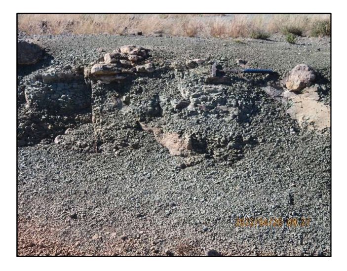
Photo 1: Lenses of slightly weathered fine grained sandstone (pinkish) in highly weathered siltstone (green) at position P4.