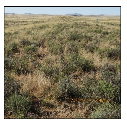
Photo 4: Dolerite ridge at position P34 (taken in strike direction of ridge) – possible quarry site.