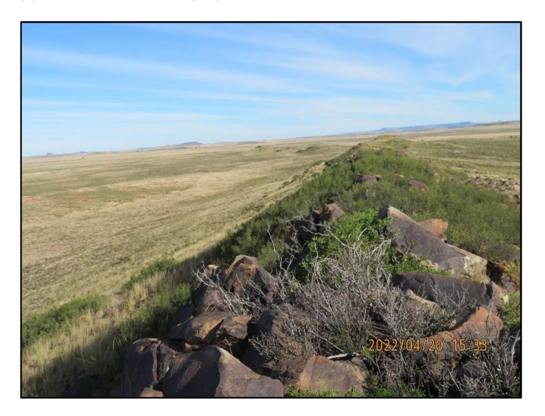
Photo 5: Steeply inclined dolerite ridge side slopes along part of planned Eskom power line route (on Phase 1 footprint)