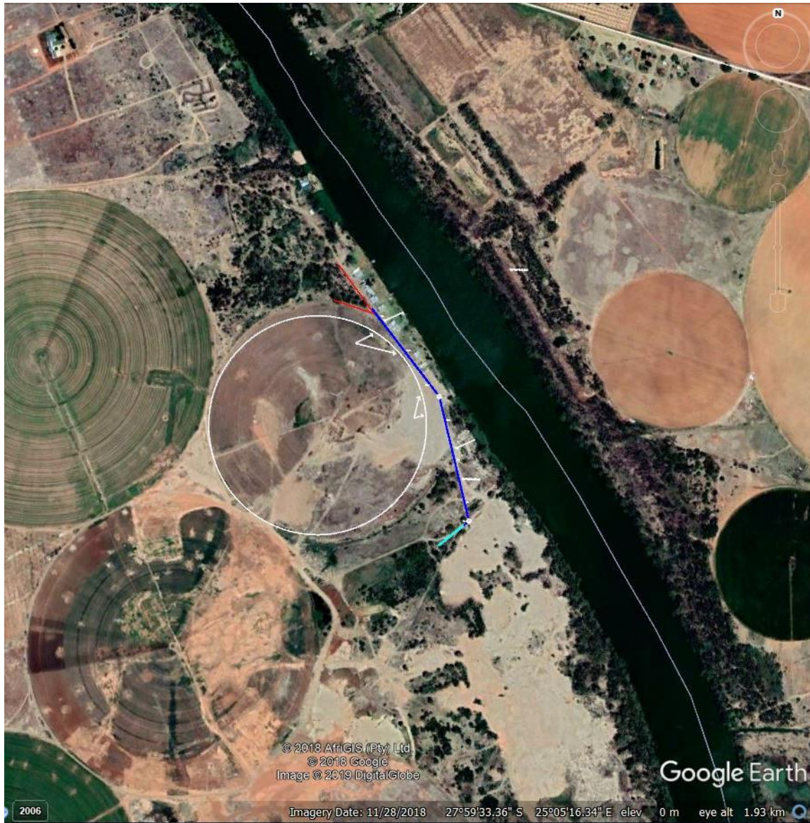
Figure 1: Google Earth photo indicating study site (red, blue and white lines)

The relevant literature and geological maps have been studied for a Palaeontological Desktop Study. The area in which the development is planned is flat with a gentle slope towards the Vaal River that forms the north-eastern border of the farm. The farm is used for agriculture (Fig. 1).