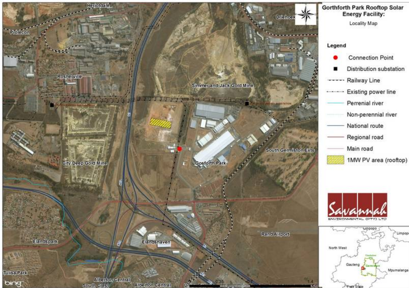
Figure 1: Locality map showing the site for the Gosforth Park 1MW Solar Energy Facility