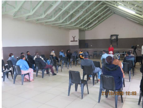
Figure 2: SAHRA Presenting to Swayimane Community