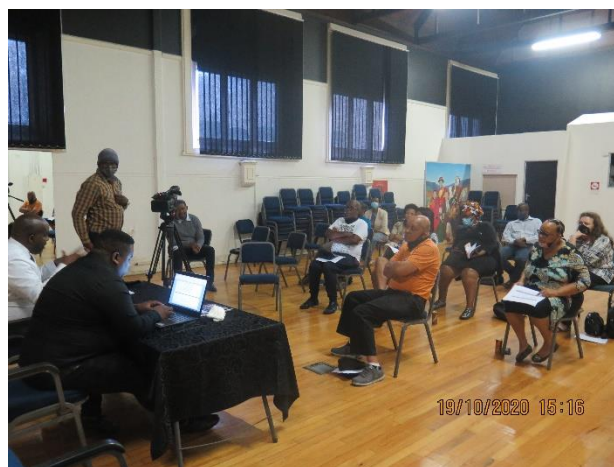
Figure 1: Meeting with the Gwala Family