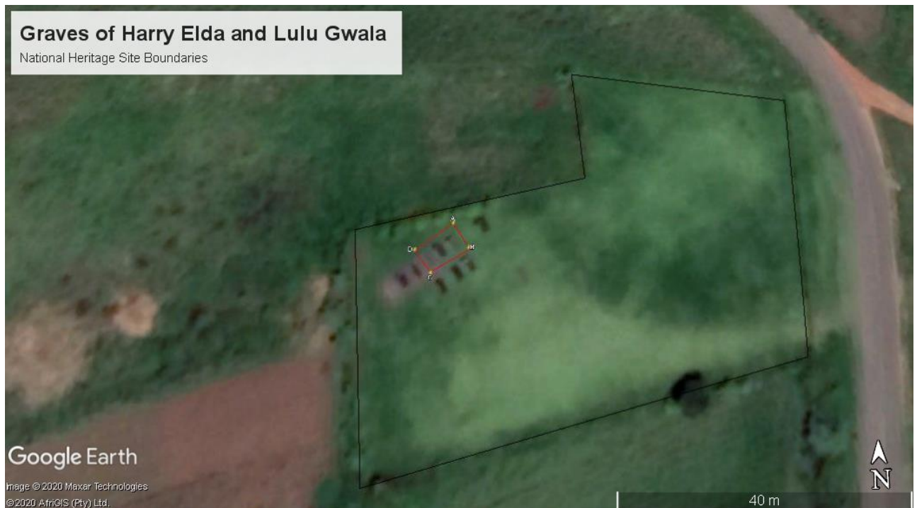
Figure 3: Boundary around the graves of Harry, Elda, and Lulu Gwala