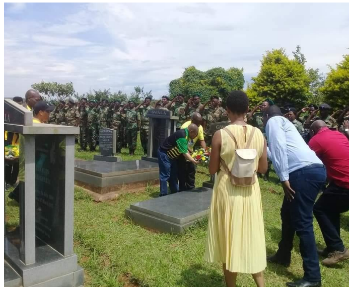
Figure 4: Centenary Commemorations of Harry Gwala