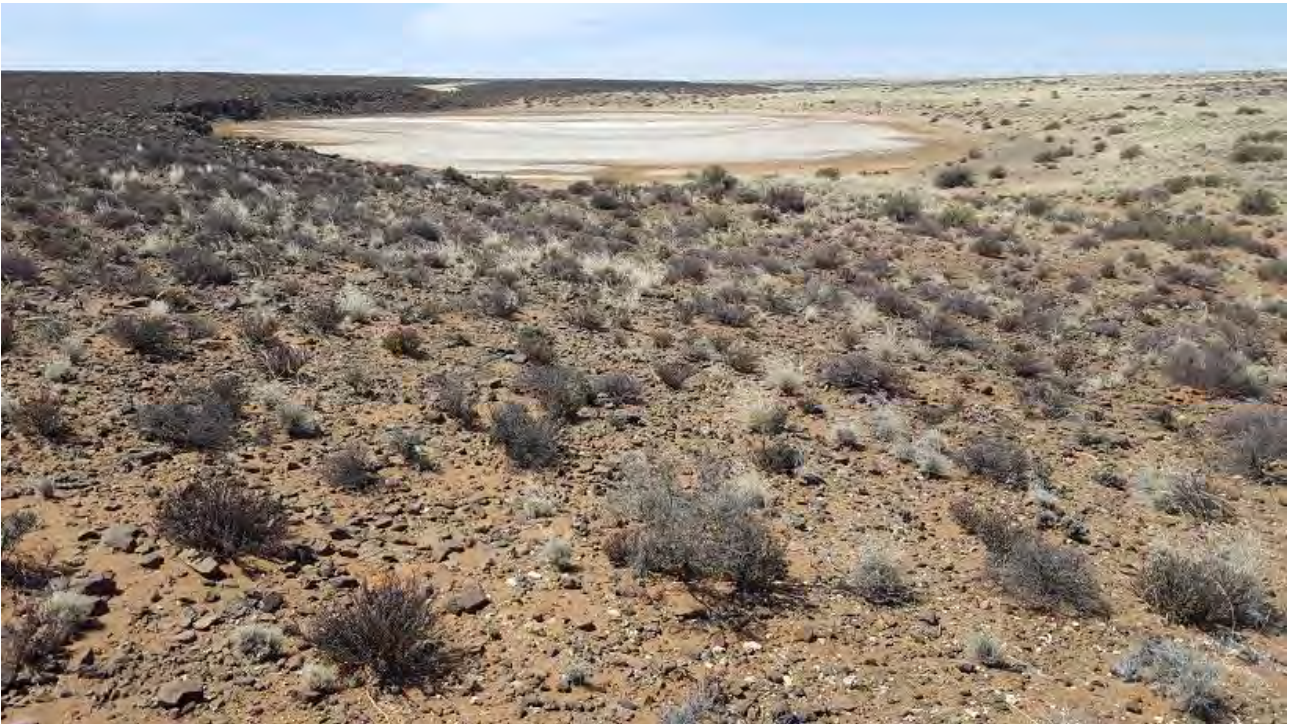
Figure 6. Photograph showing one of the salt pans that occurs in the southern part of the site.