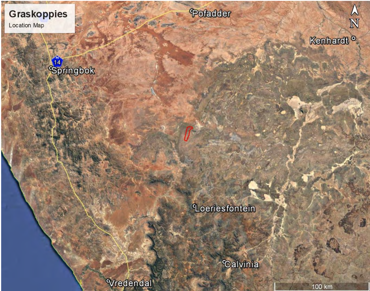
Figure 1. Location map of the proposed Wind Energy Facility development area, north of the town of Loeriesfontein.

The report also fulfils the requirements of Appendix 6 of the 2014 EIA Regulations (See Table 1).