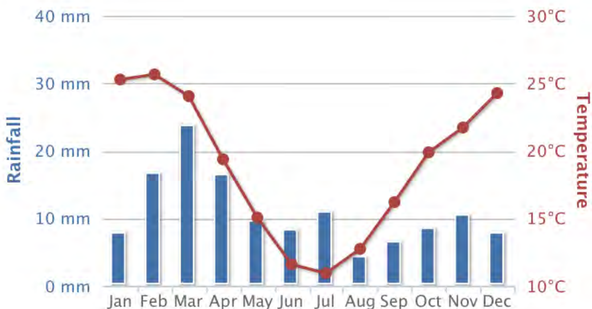
Figure 2. Average monthly temperature and rainfall for the site ( The World Bank Climate Change Knowledge Portal, undated ).