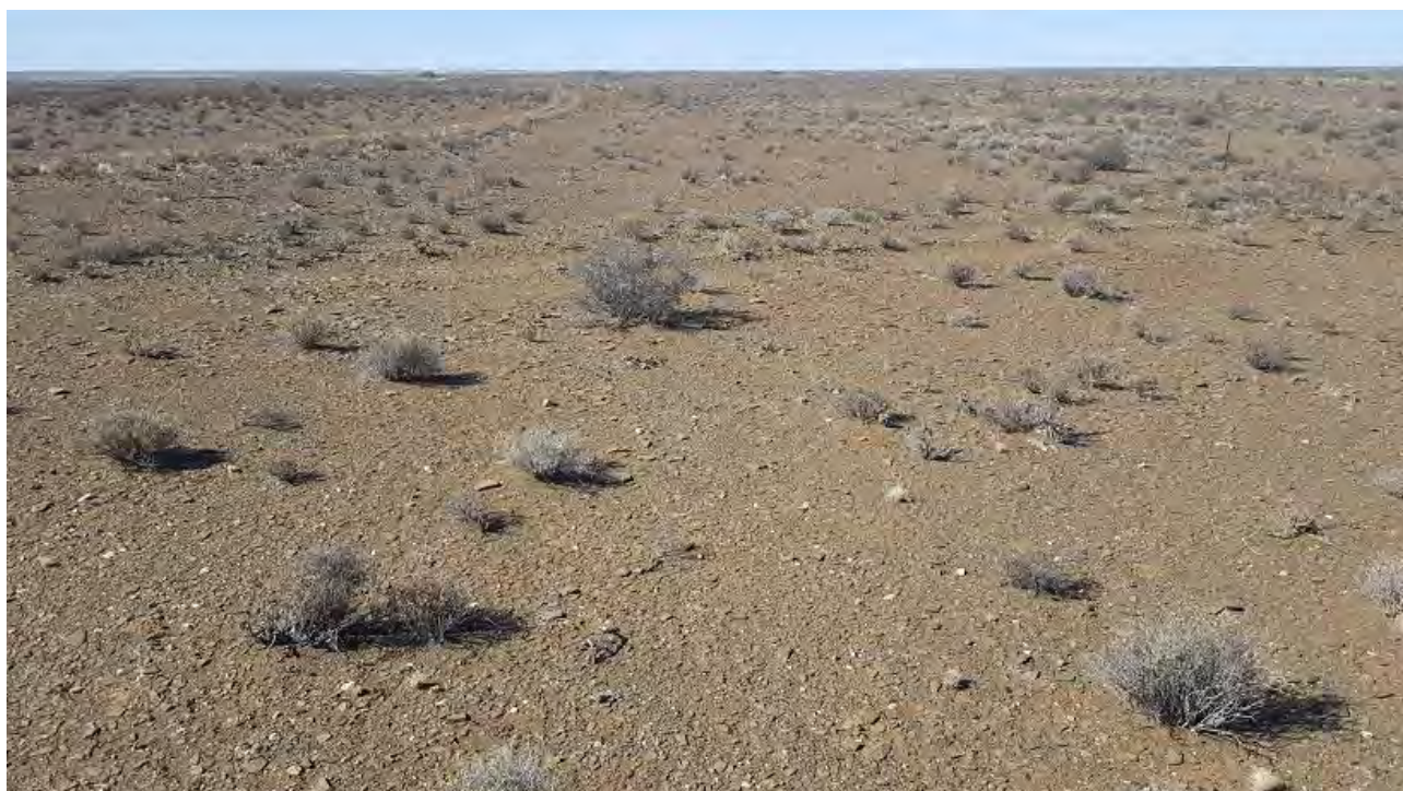
Figure 4. Photograph showing typical landscape and veld conditions on the site (land type Fc422).

The land type classification is a nationwide survey that groups areas of similar soil, terrain and climatic conditions into different land types. There are two land types across the study area, namely Ah25 and Fc422 (see Figure 3). Soils on these land types are similar and are predominantly shallow, sandy soils on underlying rock or hard-pan carbonate. The soils would fall into the Lithic and Calcic soil groups according to the classification of Fey (2010). A summary detailing soil data for the land types is provided in the Appendix in Table A1. The field investigation confirmed the occurrence of shallow, sandy soils on underlying rock or hard-pan carbonate across the entire site. The predominant soil forms are Coega, Mispah, Glenrosa and Askham.