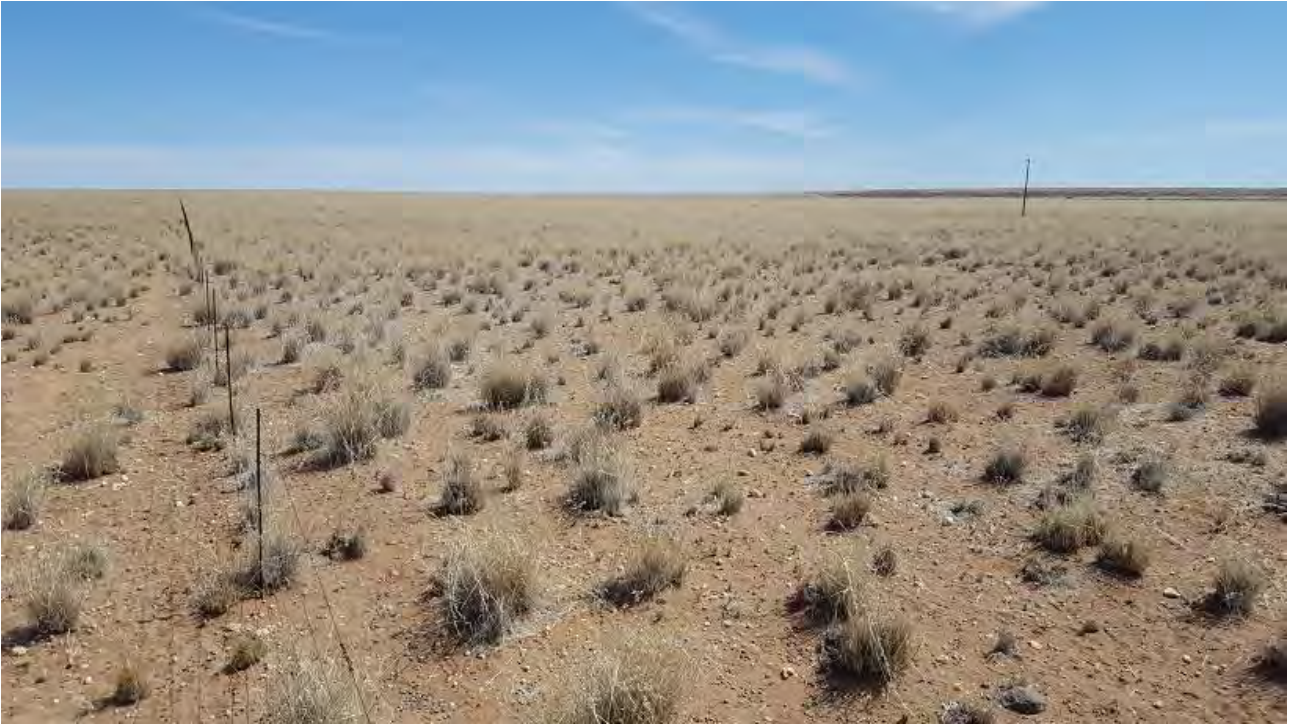
Figure 5. Photograph showing typical landscape and veld conditions on the site (land type Ah25).