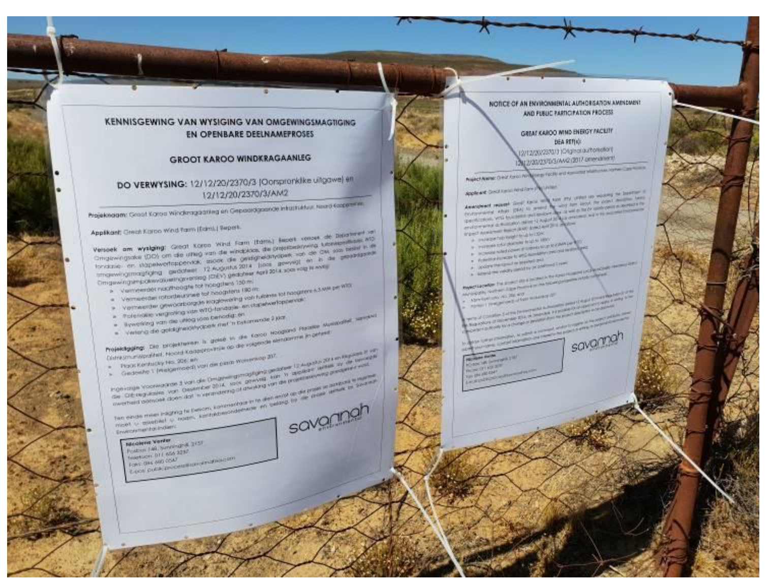
Figure 1: Site notices No. 1: Afrikaans and English –placed on a boundary fence along the unnamed dirt access road providing access to the Great Karoo WEF. Co-ordinate: 32°47′7.57″S; 18°14′26.70″E