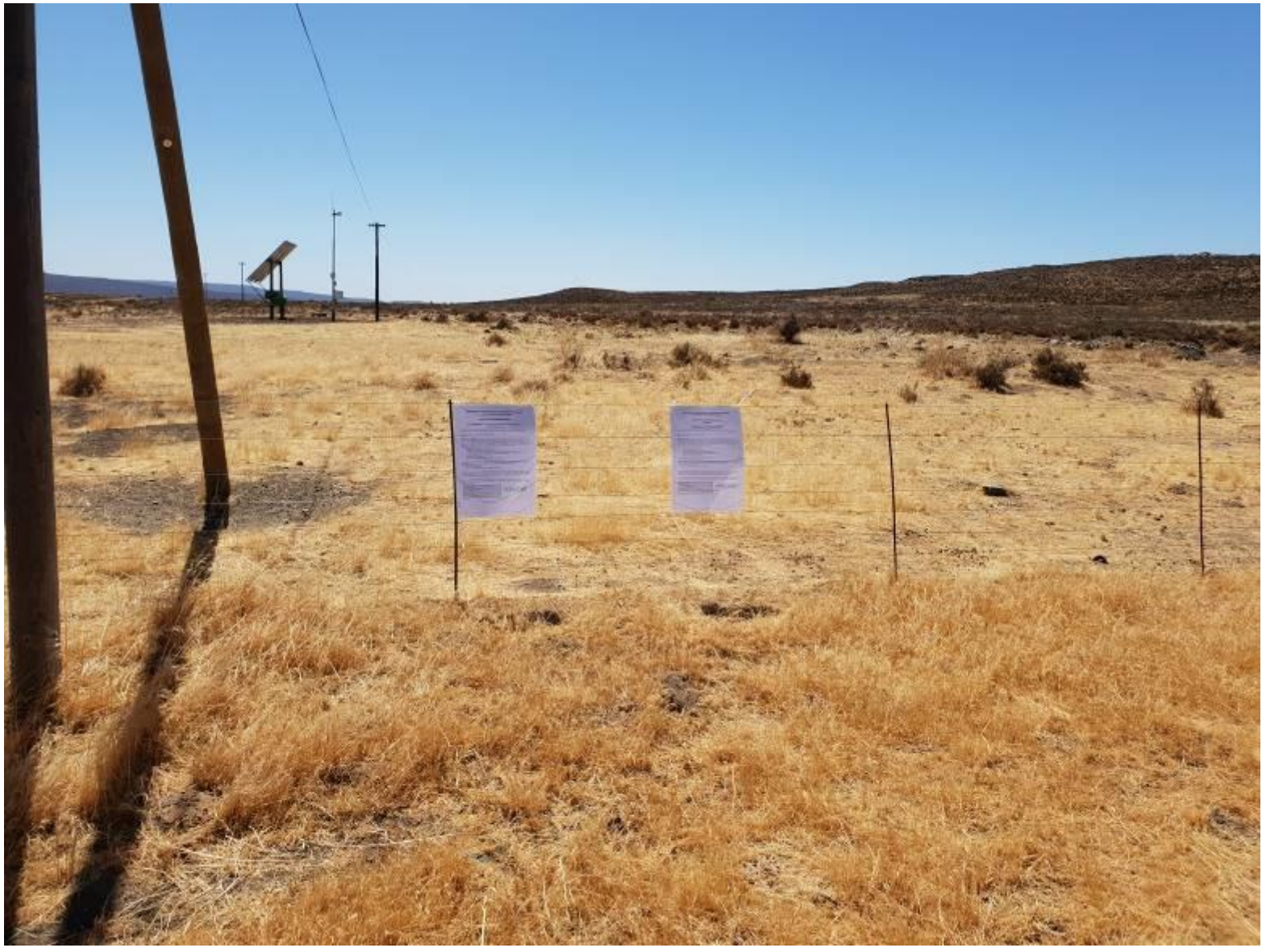
Figure 4: Site notices No. 2: Afrikaans and English –placed on a boundary fence along the unnamed dirt access road providing access to the Great Karoo WEF. <u>Co-ordinates</u>: 32°48'30.02"S; 20°42'38.58"E