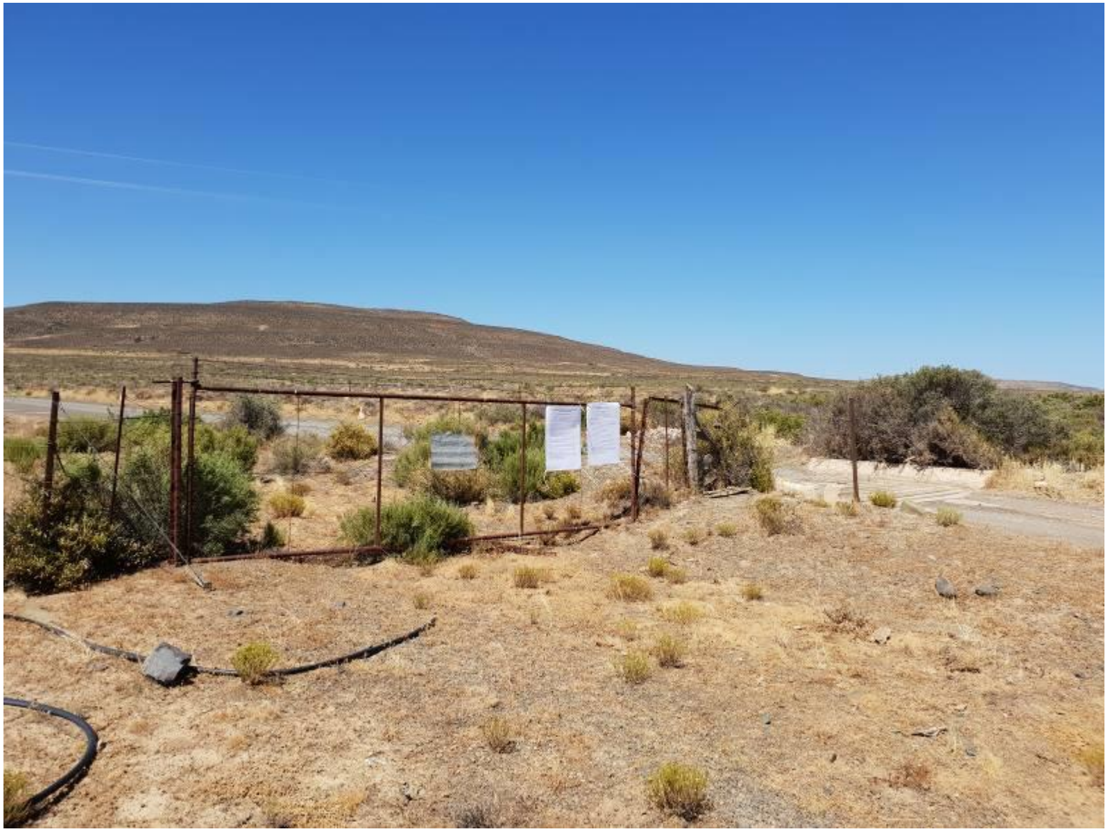
Figure 2: Site notices No. 1: Afrikaans and English –placed on a boundary fence along the unnamed dirt access road providing access to the Great Karoo WEF. <u>Co-ordinates</u>: 32°47′7.57″S; 18°14′26.70″E