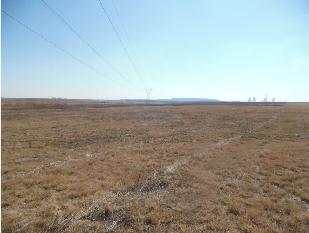
Photograph 1: Landscape in general