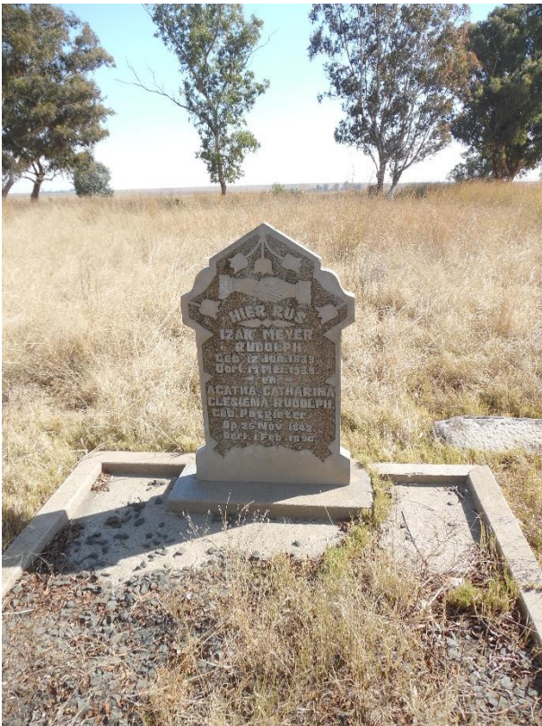
Photograph 8: Headstone 2