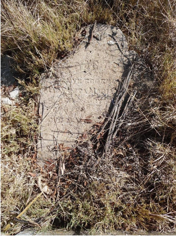
Photograph 7: Headstone 1