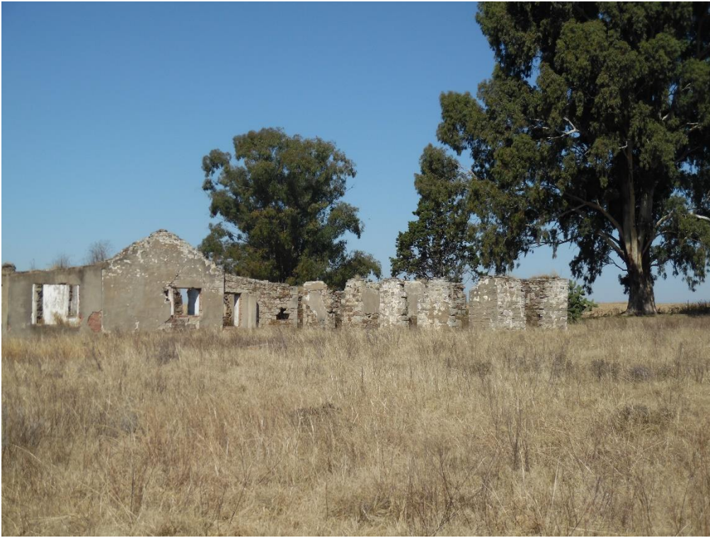
Photograph 4: Structure 1: Main residence with outbuildings