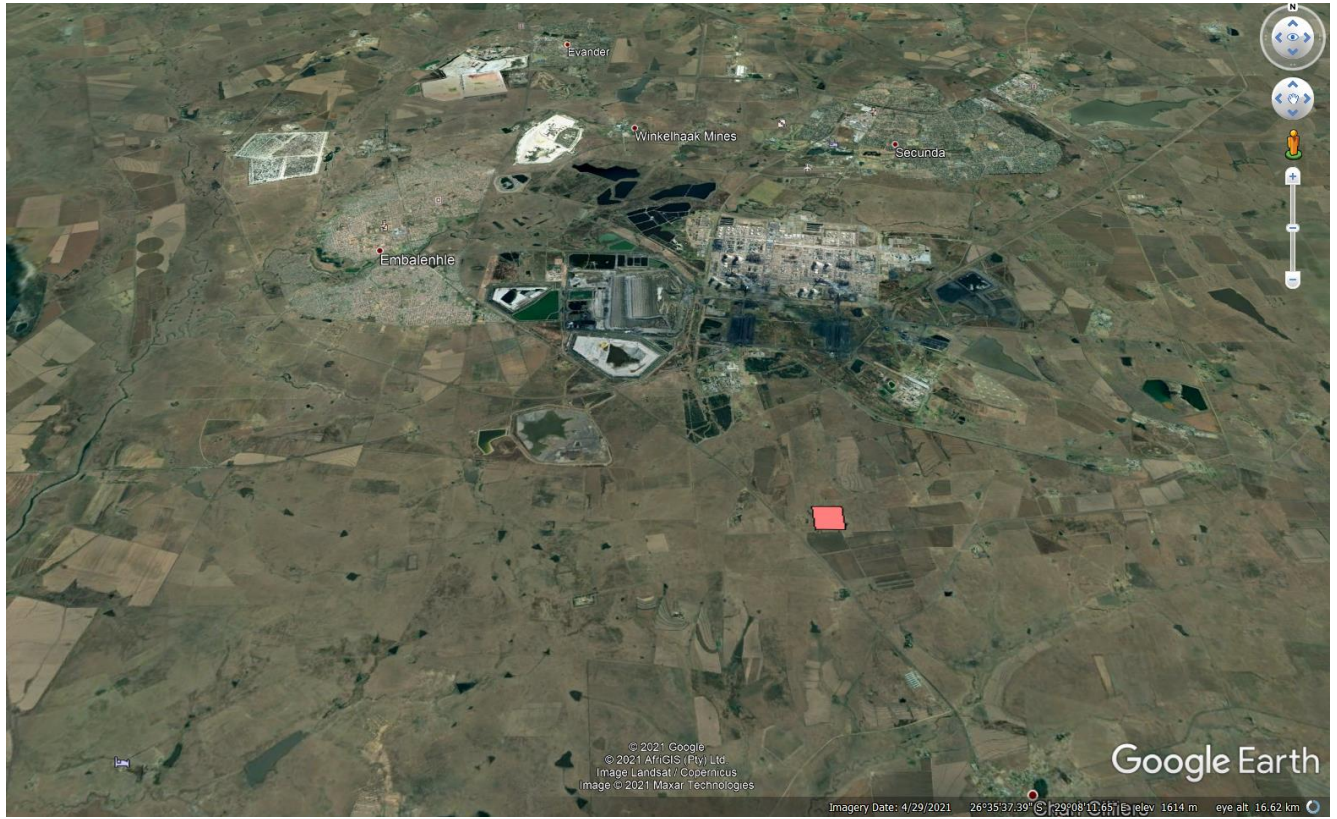
Figure 1: Location of study area