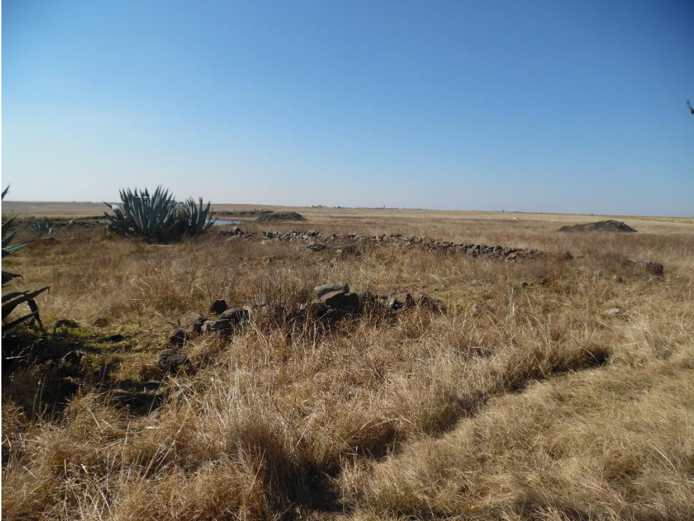
Photograph 5: Animal enclosure