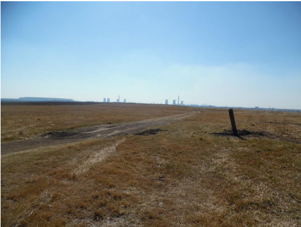
Photograph 2: Landscape in general