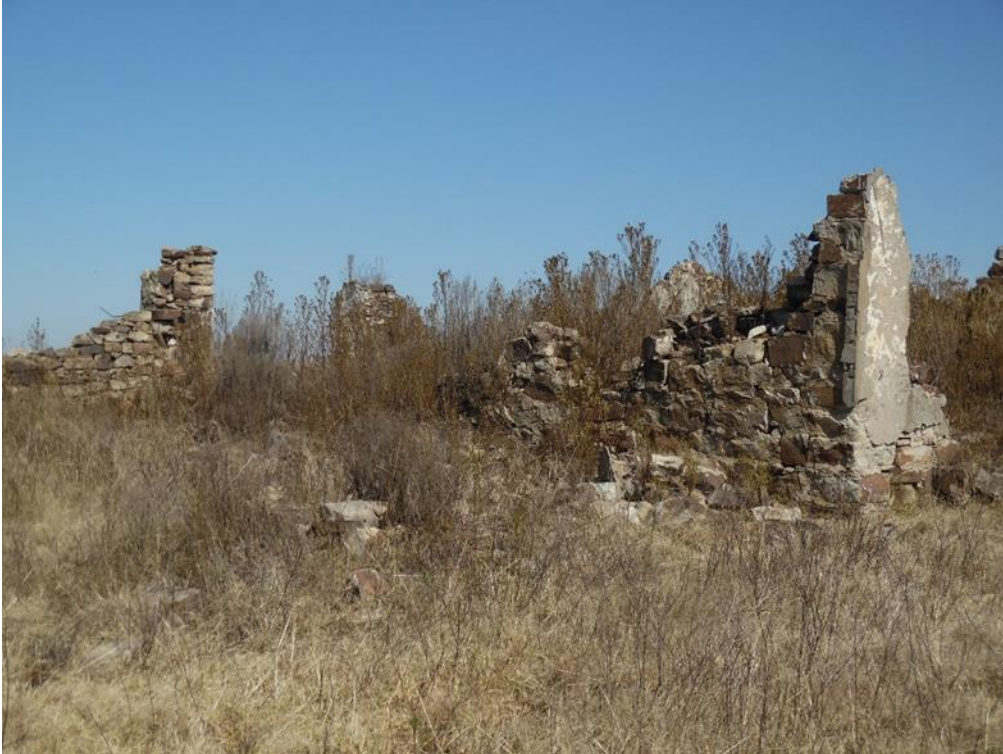
Photograph 4: Secondary structure