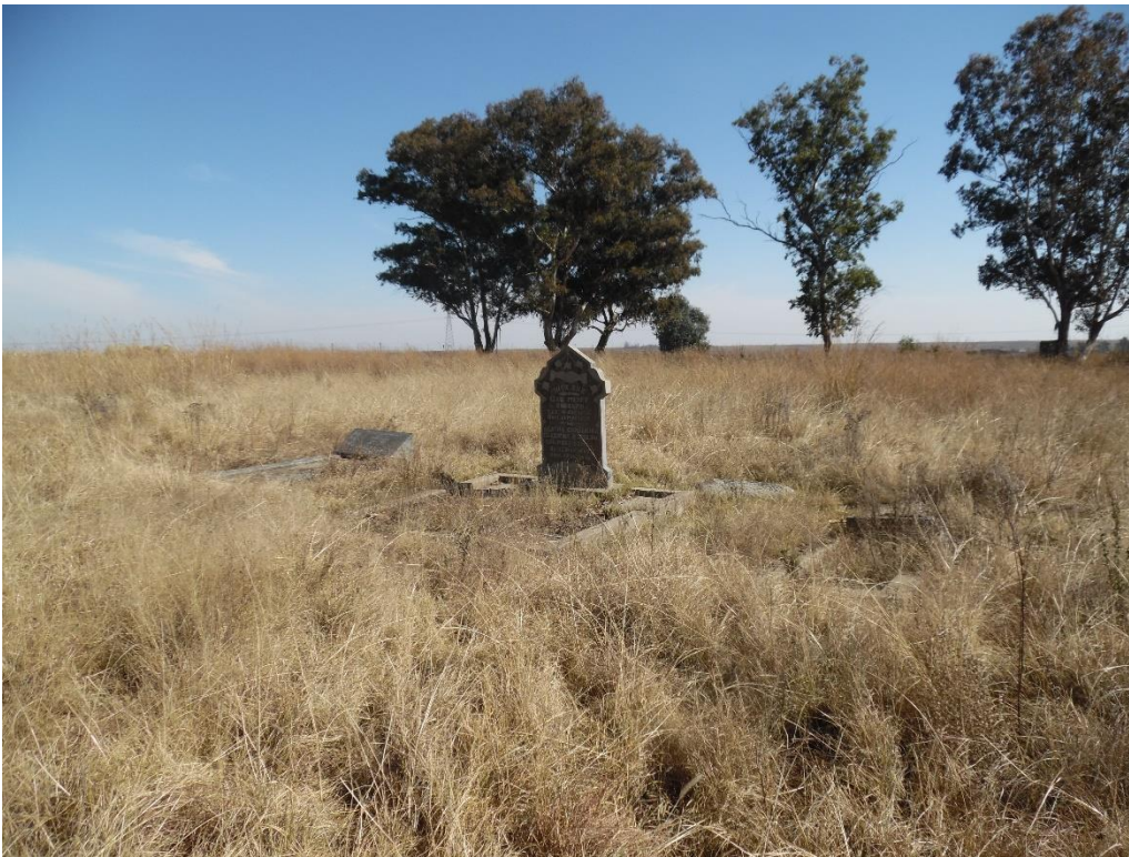
Photograph 6: View of cemetery