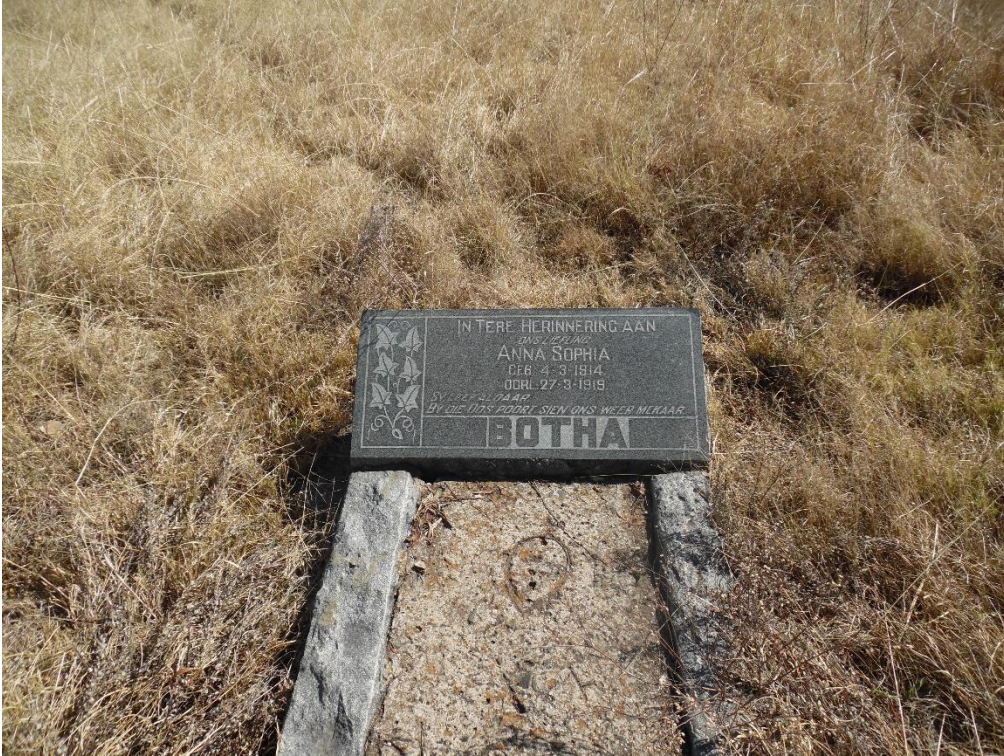
Photograph 9: Headstone 3