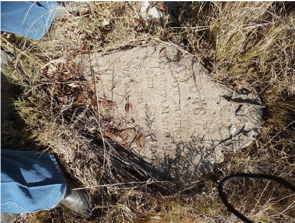
Photograph 10: Headstone 4