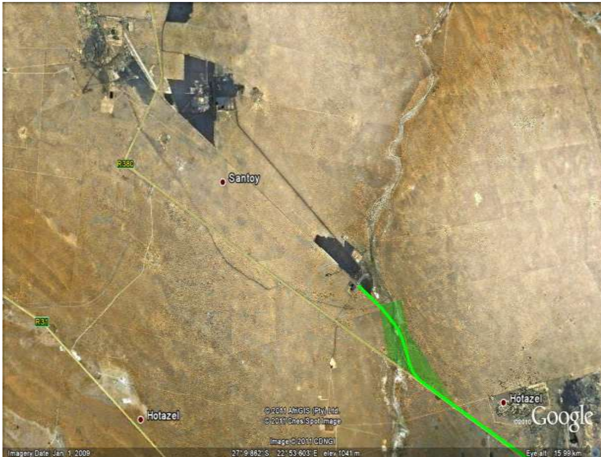
Figure 1: Aerial location of development.

The Gamagara river crosses through the development area, resulting in a number of erosion gullies. The topography of the area is relatively flat, although there are a number of rocky outcrops as well. The most characteristic feature is red sand dunes covered by grass and shrubs, and in some places the red dunes are underlain by calcrete (where the sand has been blown away). In certain areas there are open patches of sand or calcrete where the vegetation is sparser.