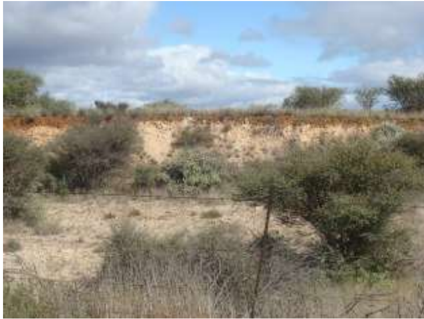
Figure 13: View of one of the sites, with red sand and pebble layer over calcrete formation. Many tools occur in the red pebble layer.