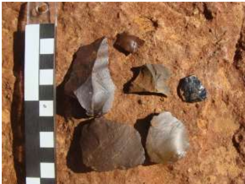
Figure 8: MSA flakes and tools from one of the sites.

According to Kusel (2009: p.8) the Stone Age site recorded during his survey is representative of similar sites occurring near water. As such the site as well as possible sites all along the banks of the Gamagara River represents a very long period of human occupation. These sites are at least of regional importance.