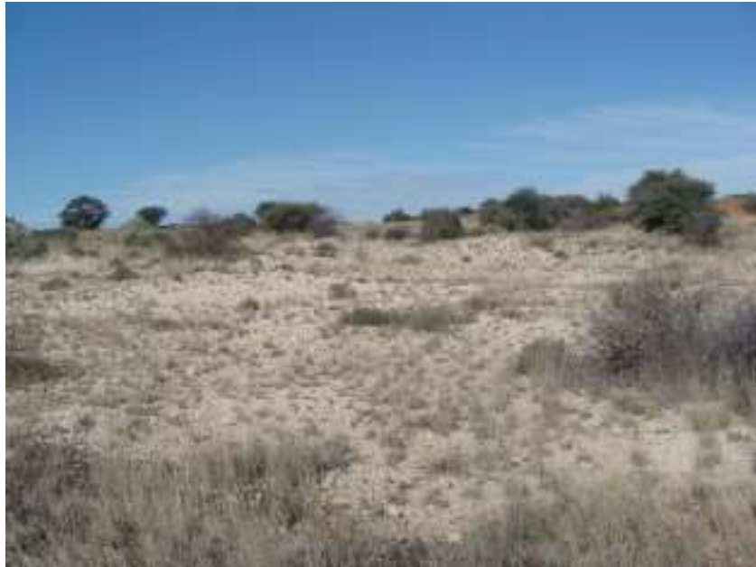
Figure 4: One of the erosion dongas in the area.