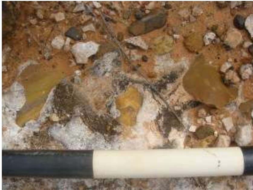
Figure 12: MSA flakes and tools embedded in hard calcrete layer.