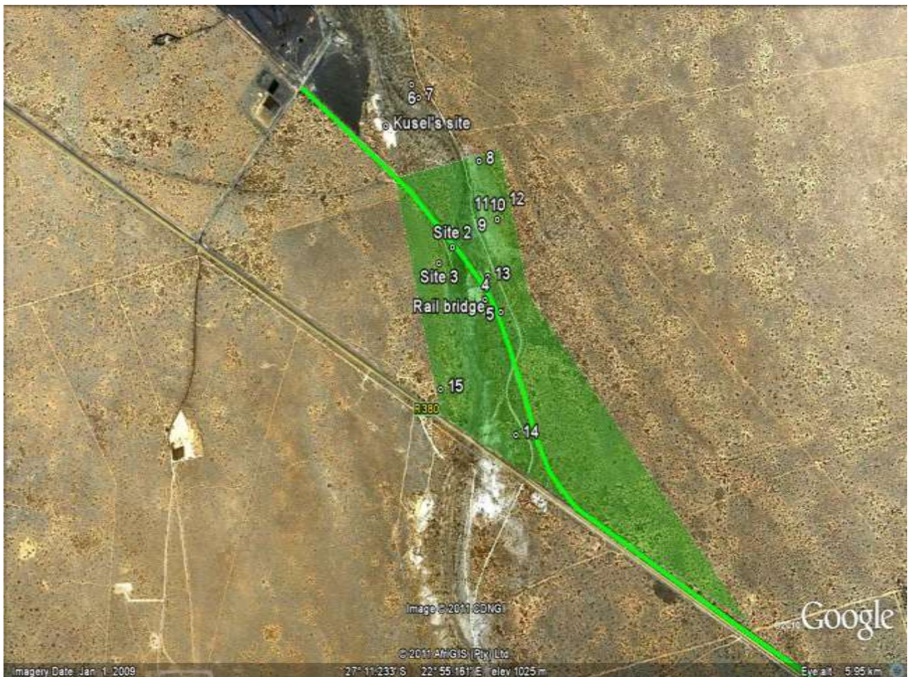
Figure 14: Distribution of sites in the area.