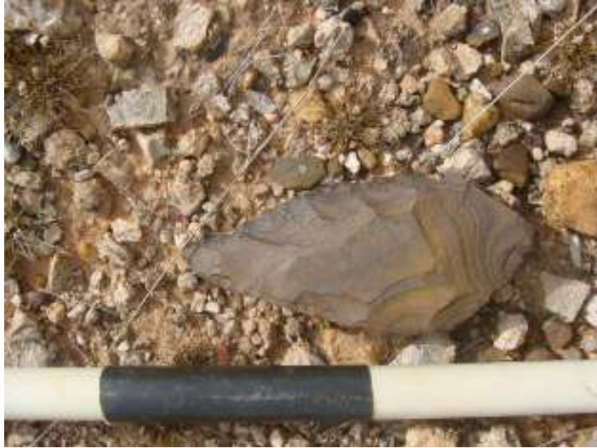
Figure 11: ESA hand axe from Site 12.