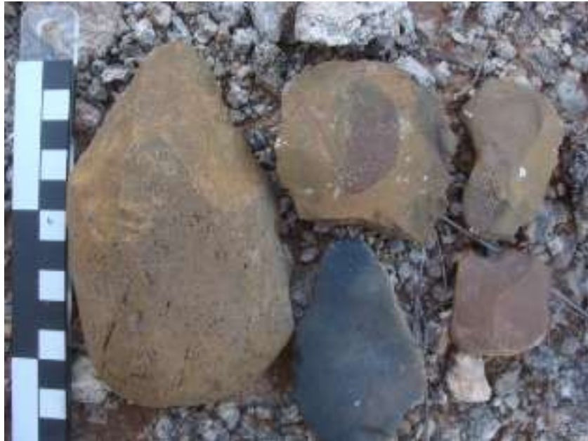
Figure 9: ESA and MSA tools.