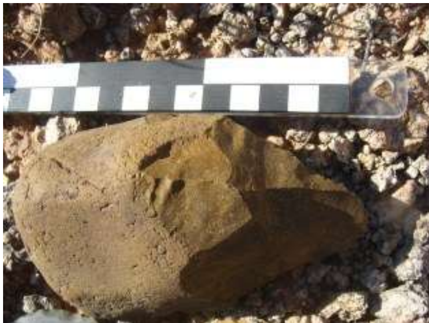
Figure 10: Close-up of ESA tool from the area.