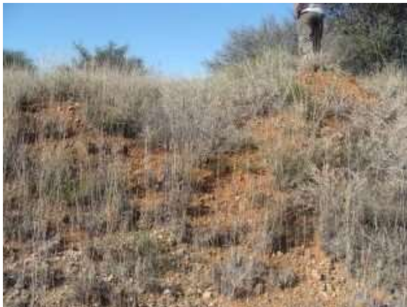
Figure 5: View of one of the red dunes, underlain by calccrete formations.