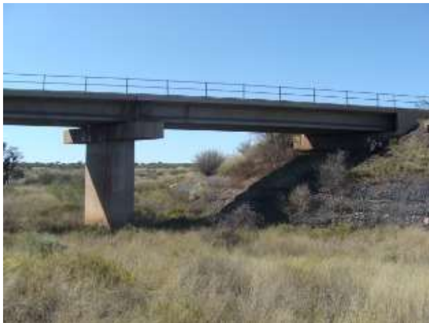
Figure 7: Closer view of existing bridge.