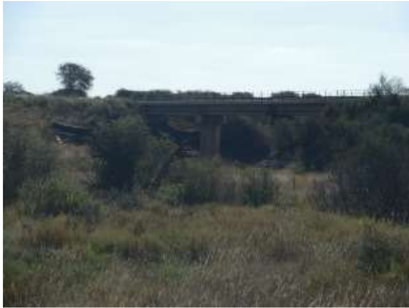
Figure 6: Existing rail bridge over the Gamagara River.