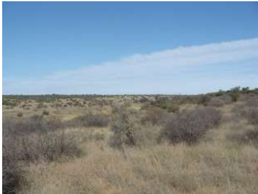
Figure 3: Typical view of area.