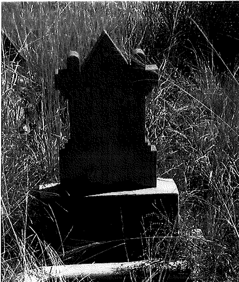
Fig. 1. One of the headstones in the old cemetery.