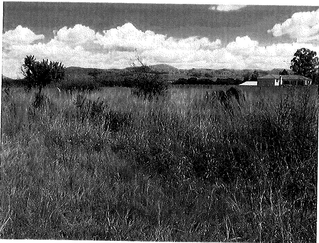
Fig. 3. The old cemetery

Legal requirements : SAHRA permit, Police, provincial permits.