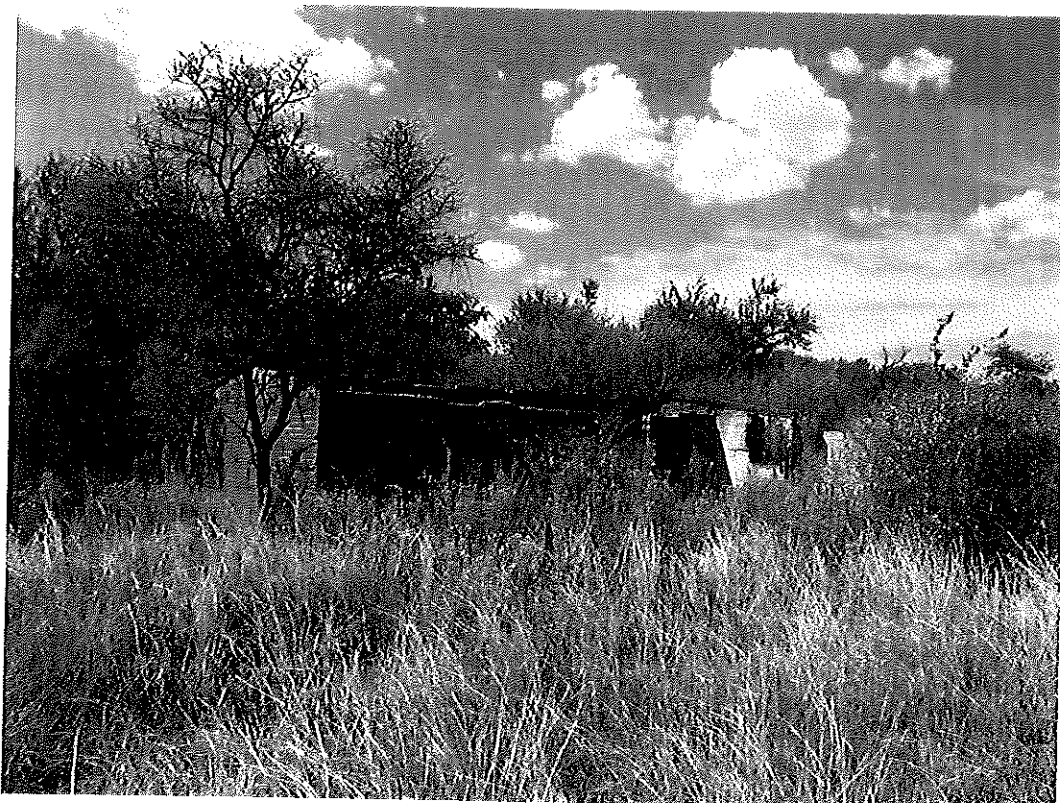
Fig. 5. Some of the old outbuildings. Note the tall vegetation.