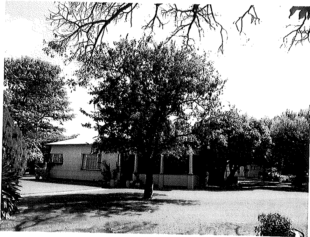
Fig. 4. The old farmhouse.

3. Location: Waterkloof 305JQ: S 25.72482; E 28432