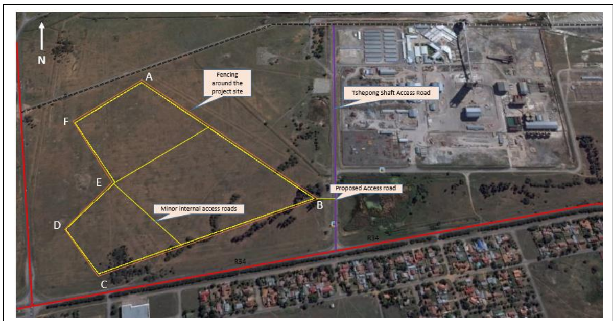
Figure 2: Map indicating access roads for the preferred site layout of the proposed PV Solar Facility

Include the position of the access road on the site plan and required map, as well as an indication of the road in relation to the site ( Refer to Figure 2 and Figure 3 ).