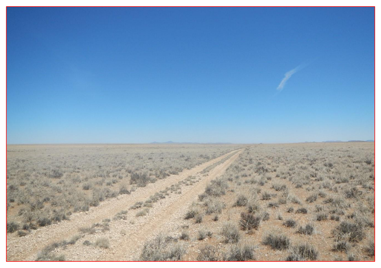
SOUTH AFRICA MAINSTREAM RENEWABLE POWER DEVELOPMENTS (PTY) LTD

Proposed Development of the 235MW Hartebeest Leegte Wind Farm near Loeriesfontein, Northern Cape Province