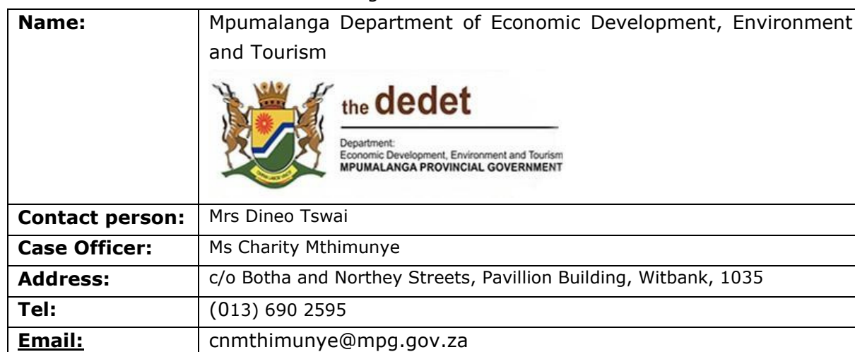
Table 2.4: Details of the commenting authorities – MDEDET

The Mpumalanga Department of Economic Development, Environment and Tourism (MDEDET) and the Department of Water Affairs (DWA) will act as a commenting authority for this application.