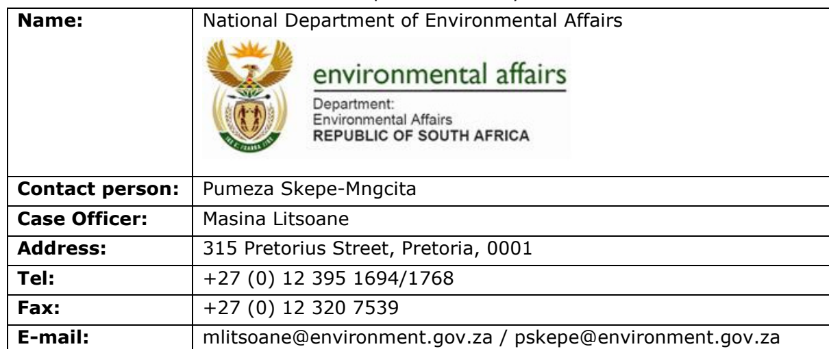
Table 2.3: Details of the relevant competent authority – DEA

The National Department of Environmental Affairs (DEA) will act as the competent authority, while the Department of Water Affairs (DWA) and the Mpumalanga Department of Economic Development, Environment and Tourism (MDEDET) will act as the commenting authority for this application. The mandate and core business of DEA is underpinned by the Constitution and all other relevant legislation and policies applicable to the government.