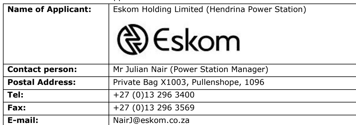
Table 2.1: Details of the applicant

The details of the applicant are shown in Table 2.1 below.