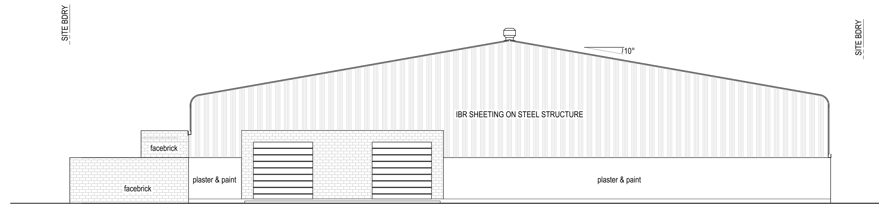
ROLAND CHAPMAN DRIVE - STREET VIEW SOUTH EAST ELEVATION Scale 1:100