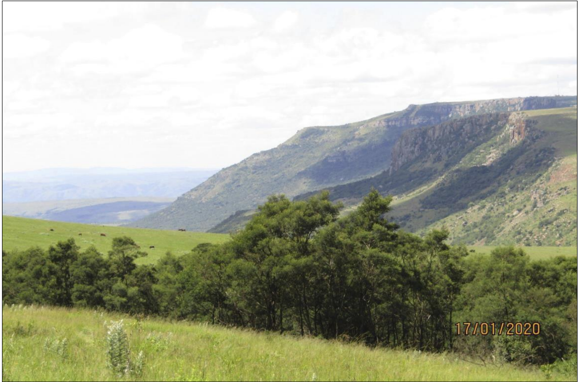
Figure 8: -Grasslands and Woodland with Cattle Grazing in the Background: -