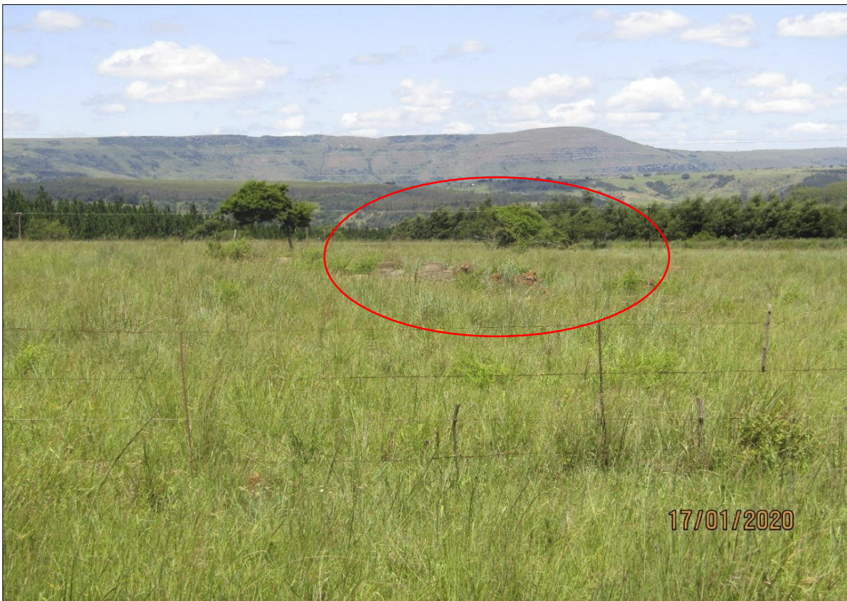
Figure 15: -Graves on the Abandoned Homestead: -