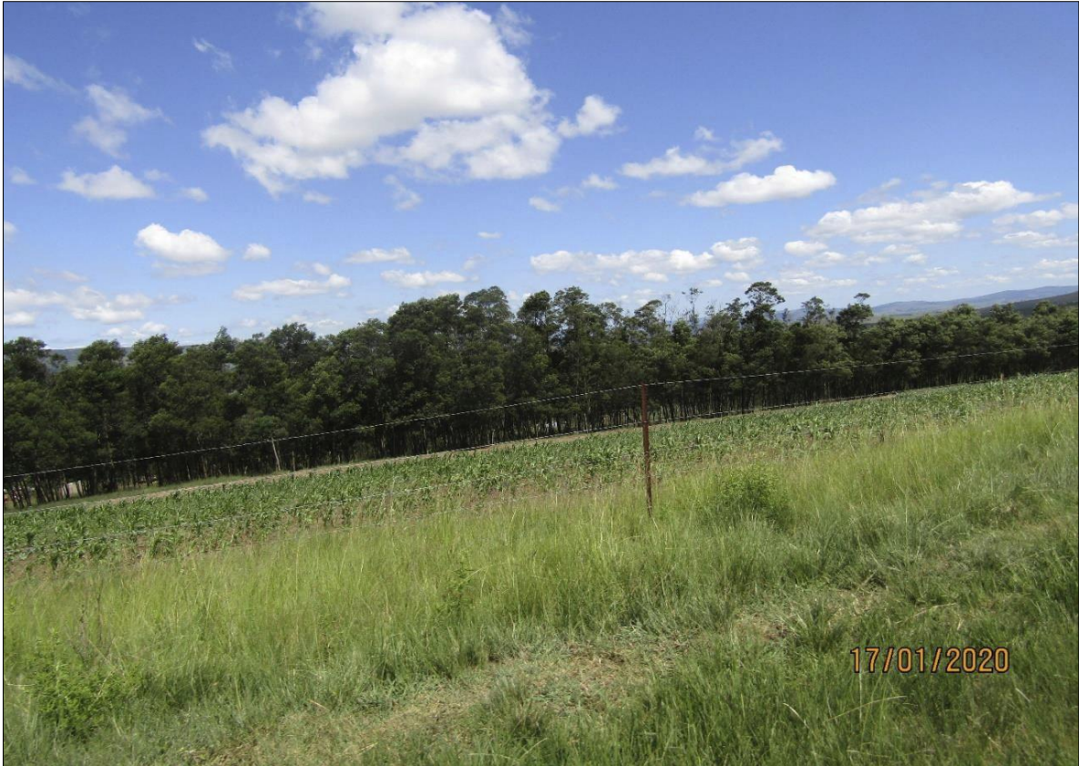
Figure 10: -Maize Field: -