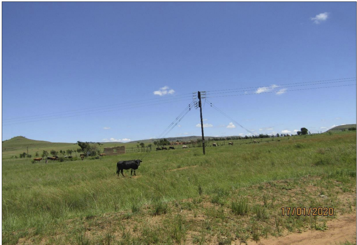
Figure 12: -Cattle Grazing in the Southern Section of the Site: -