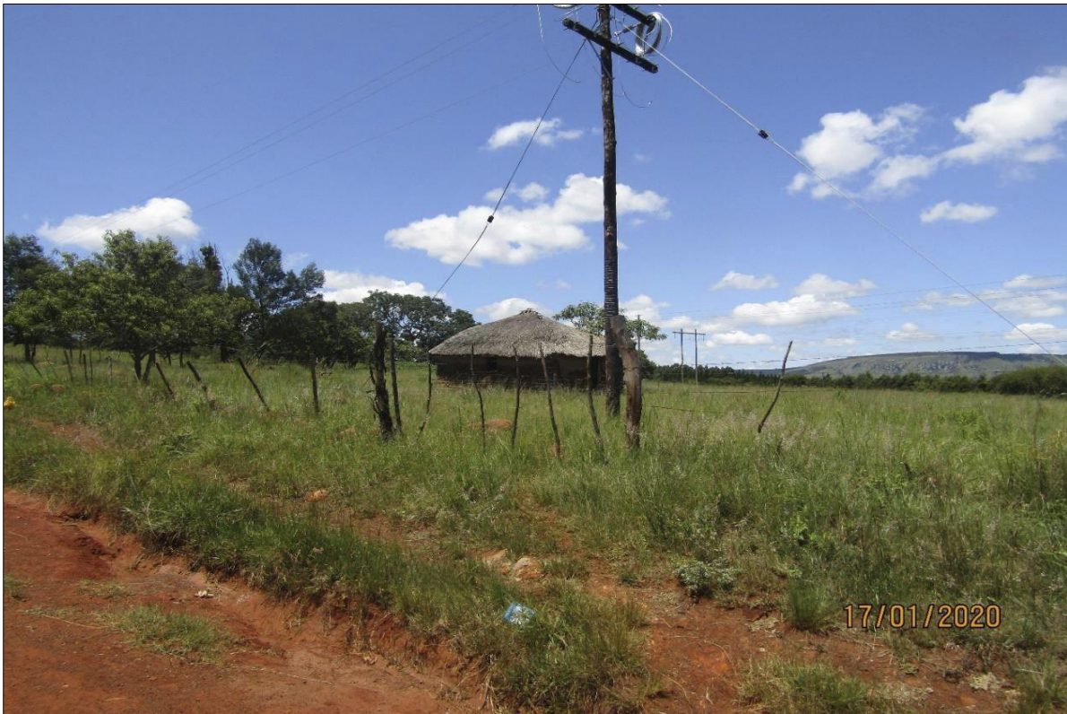
Figure 14: -Abandoned Homestead: -