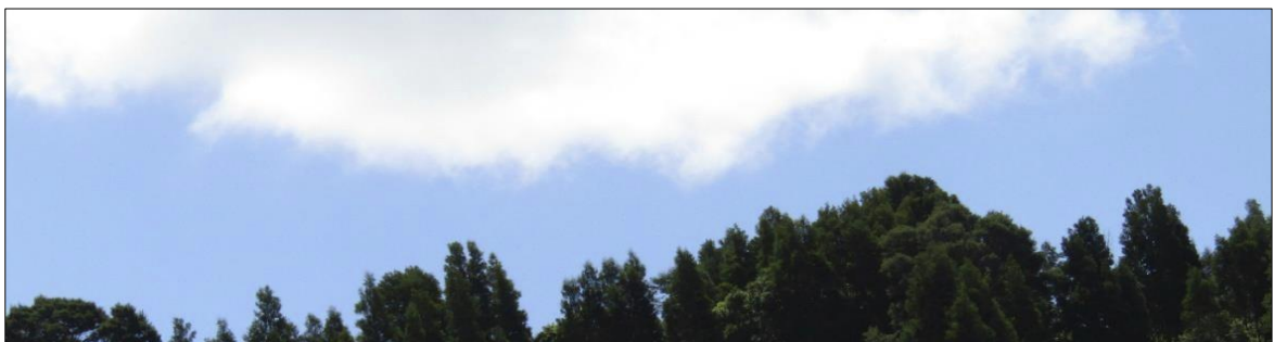
Figure 5: -Woodlands and Plantations in the North of the Prospecting Site: -

Figure 4: -Woodlands, Mainly Characterised by Wattle in the North-East End of the Proposed Prospecting Site: -