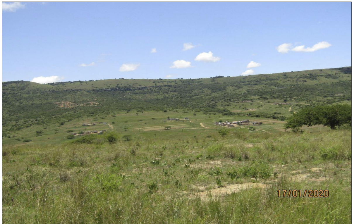
Figure 13: -Homesteads in the Southern Section of the Site: -