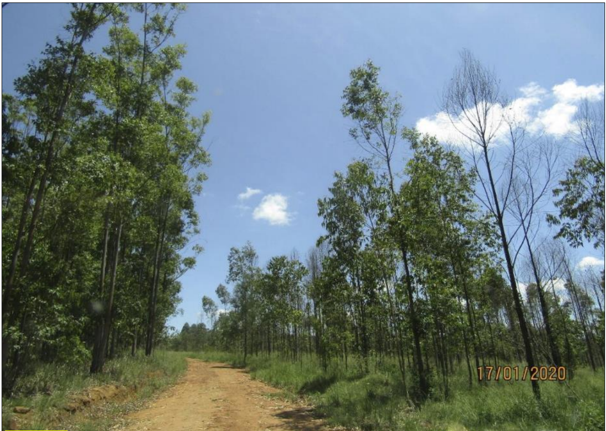
Figure 1 : - Woodlands in the South-East of the Site: -

This section contains the results of the heritage site/find assessment. The phase 1 heritage scoping assessment program is required in terms of Section 38 of the National Heritage Resource Act (Act No. 25 of 1999) , as well as the KZN Amafa and Heritage Institute Act of 2018 (Act No. 5 of 2018) and conducted for the proposed coal prospecting right. The site is characterised by village homesteads (see Figure 13 , Figure 15 and Figure 18 ), plantations and woodlands (see Figure 5 , Figure 6 , Figure 7 , Figure 8 , Figure 9 , Figure 10 and Figure 11 ), agricultural fields (see Figure 14 ), and grazing fields (see Figure 12 , Figure 16 and Figure 17 ). No heritage resources of significance were observed on the entirety of the site outside the homesteads. All cultural heritage resources observed were within homesteads, for example, as indicated in Figure 19 .