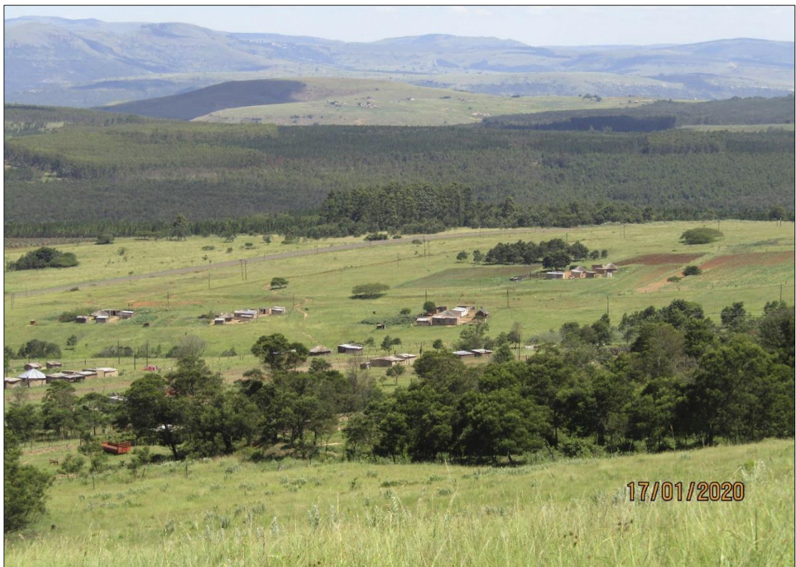
Figure 9: -Local Village with the R69 Road on the Left: -