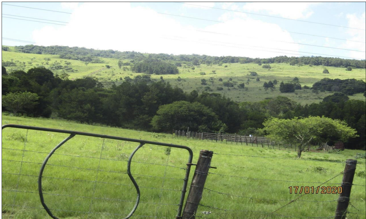
Figure 11: -The North-Eastern Tip of the Site: -