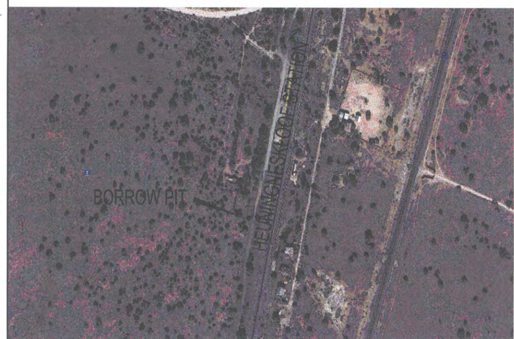
BORROW PIT LOCALITY PLAN

NOTES 1. REFER TO DOCUMENT NO. H500275-3-114-C-RPT 0027 MS, REPORT ON GEOTECHNICAL ENGINEERING SURVEY, FOR DETAILED GEOTECHNICAL TRIAL PIT RESULTS AND RECOMMENDATIONS.