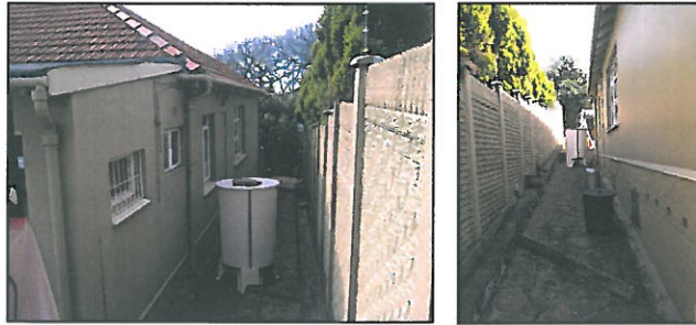
Image on left: Exg. Main House, South-West Elevation with Exg. Path 3.