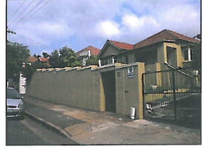
Image on left: Exg. Front Boundary Wall, House View, with Part Exg. Entrance 1 and Exg. Pedestrian Entrance.