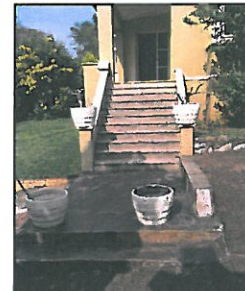
Image on left: Exg. Main House, Part South-East and North-East Elevation.