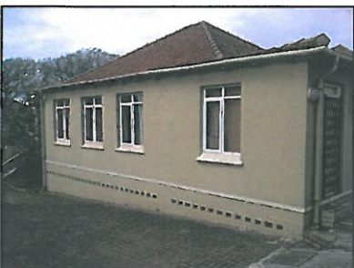
Image on right: Exg. Main House, Front Entrance and Stairs, North-East Elevation.