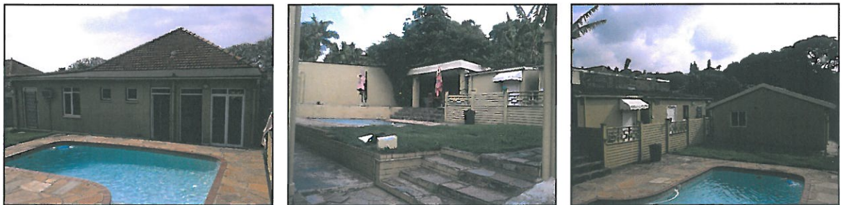
Image on left: Exg. Main House, North-West Elevation and Exg. Outside Terrace with Exg. Swimming Pool.