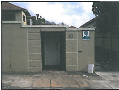
Image on left: Exg. Front Boundary Wall, with Exg. Pedestrian Entrance.