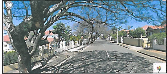
Image on left: View looking down Princess Alice Avenue, House 10 on left.