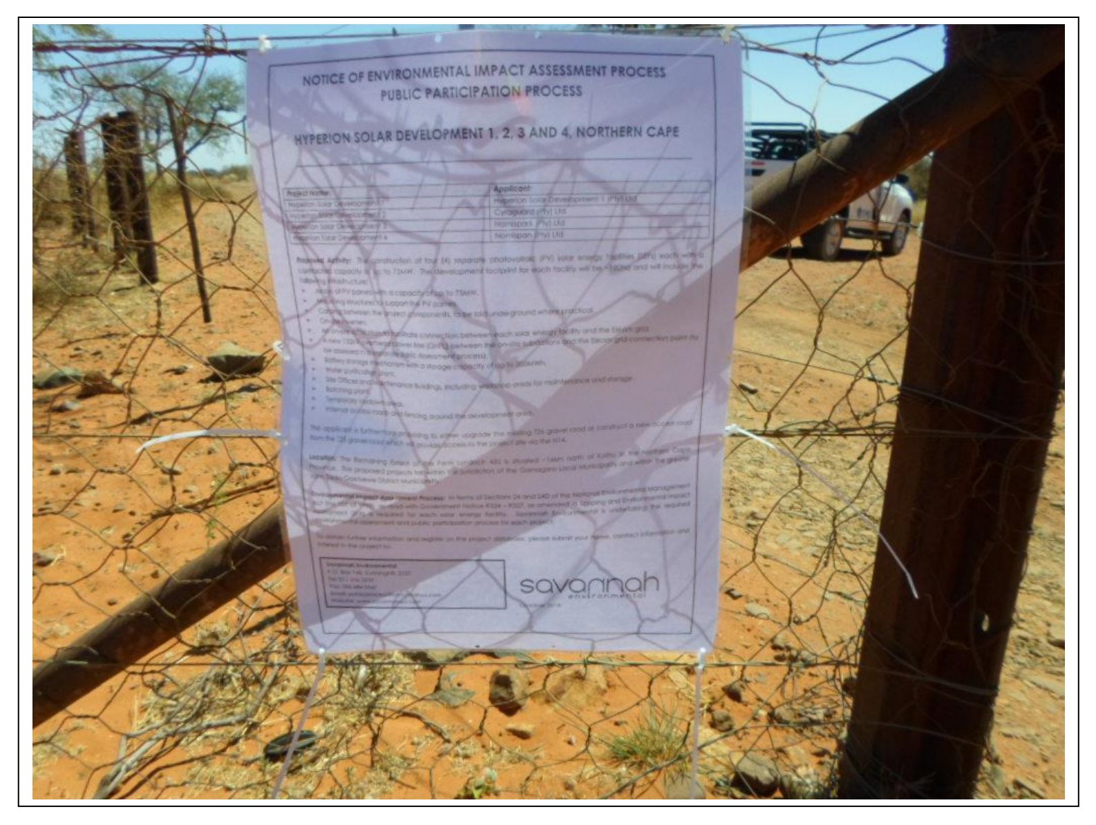
Figure 3: Site notice placed on the boundary fence of the Remaining Extent of the Farm Lyndoch 423 (i.e. the project site) (27°34'12.09"S; 23°05'58.56"E).