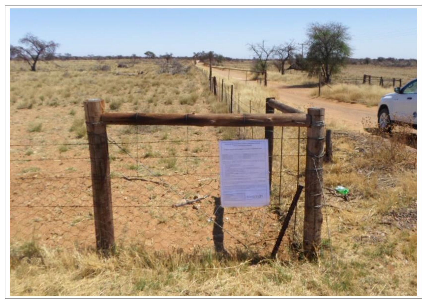
Figure 2: Site notice placed at the T-junction between the existing T26 gravel road and the N14 national route (25°37'02.59"S; 23°04'07.79"E).