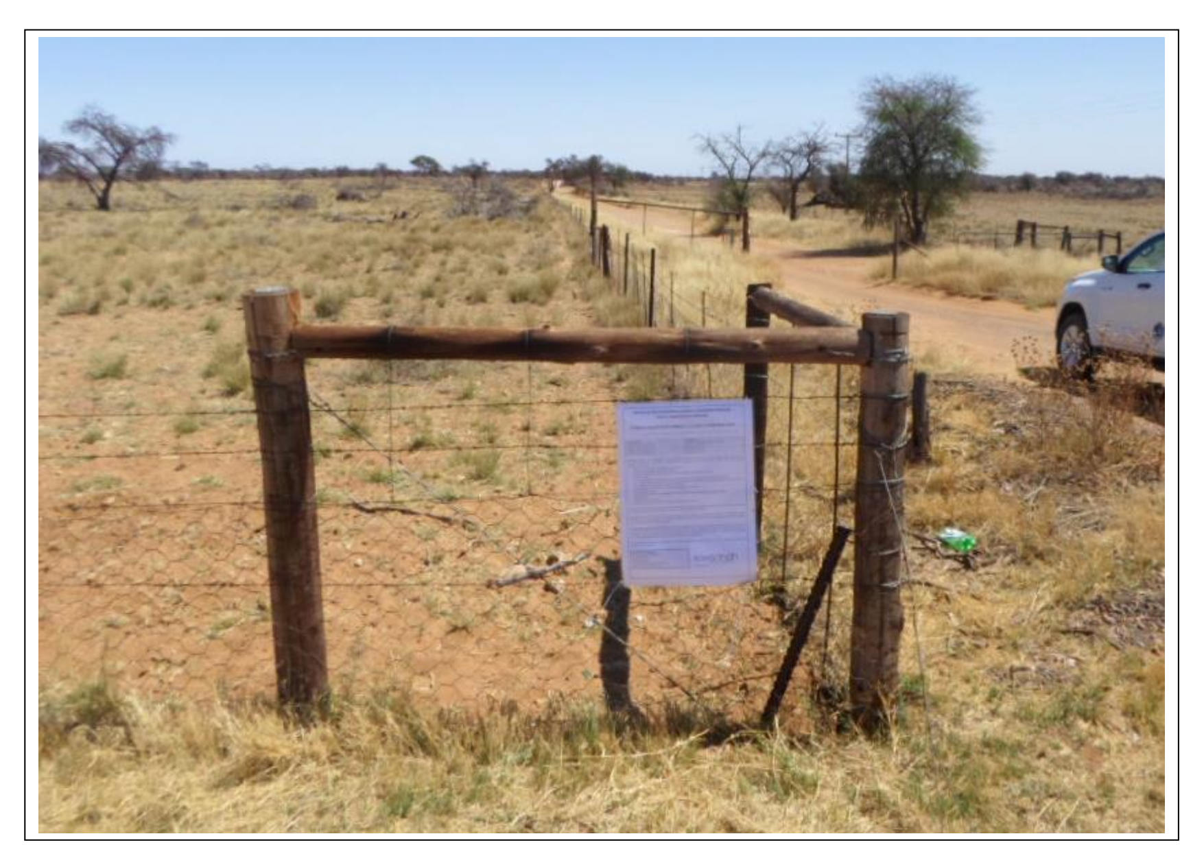
Figure 2: Site notice placed at the T-junction between the existing T26 gravel road and the N14 national route (25°37'02.59"S; 23°04'07.79"E).