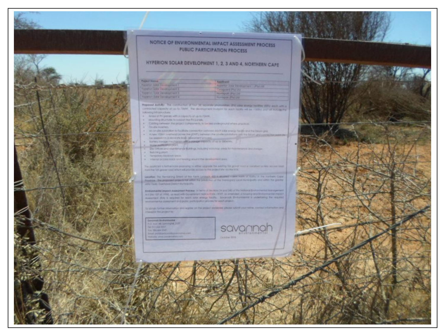
Figure 1: Site notice placed on a boundary fence at the start point of Access Road Alternative 2 along the existing T25 gravel road (27°37′02.59″S; 23°04′07.79″E).