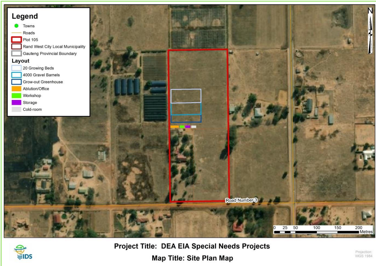
Figure 3: Site Plan