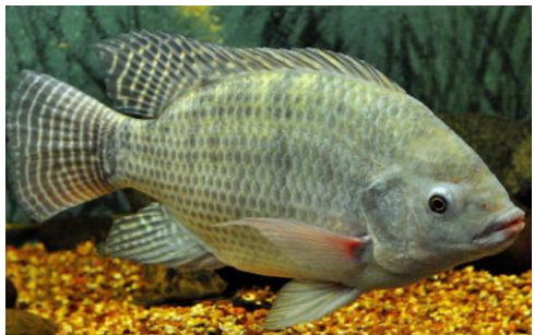
Figure 2: Image of a Nile Tilapia