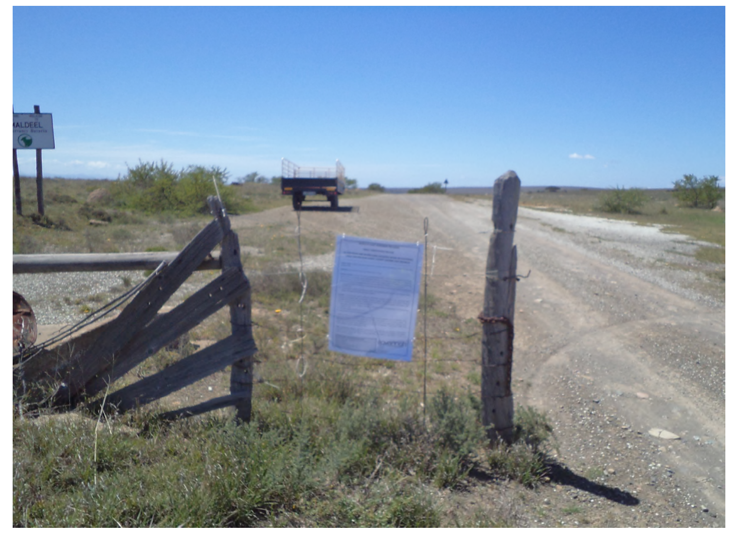
Figure 1: Site Notice placed on the boundary fence of the Remainder of the Farm Brakke Fonteyn 218 along the Regional Road R350. Coordinates; $ 32°56'38.90", E 26°07'34.1"