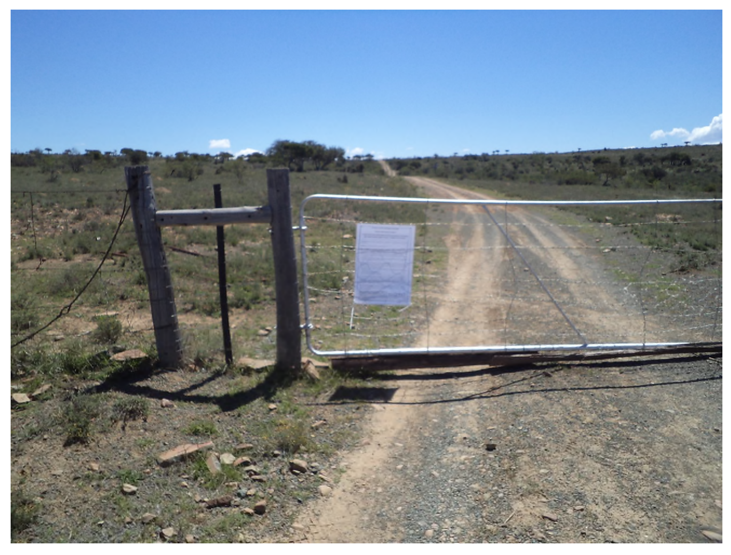
Figure 5: Site Notice placed on the gate of the Farm Brak Fontein 220 along the Main Road.

Coordinates; $ 32°53'46.20", E 26°08'49.90".