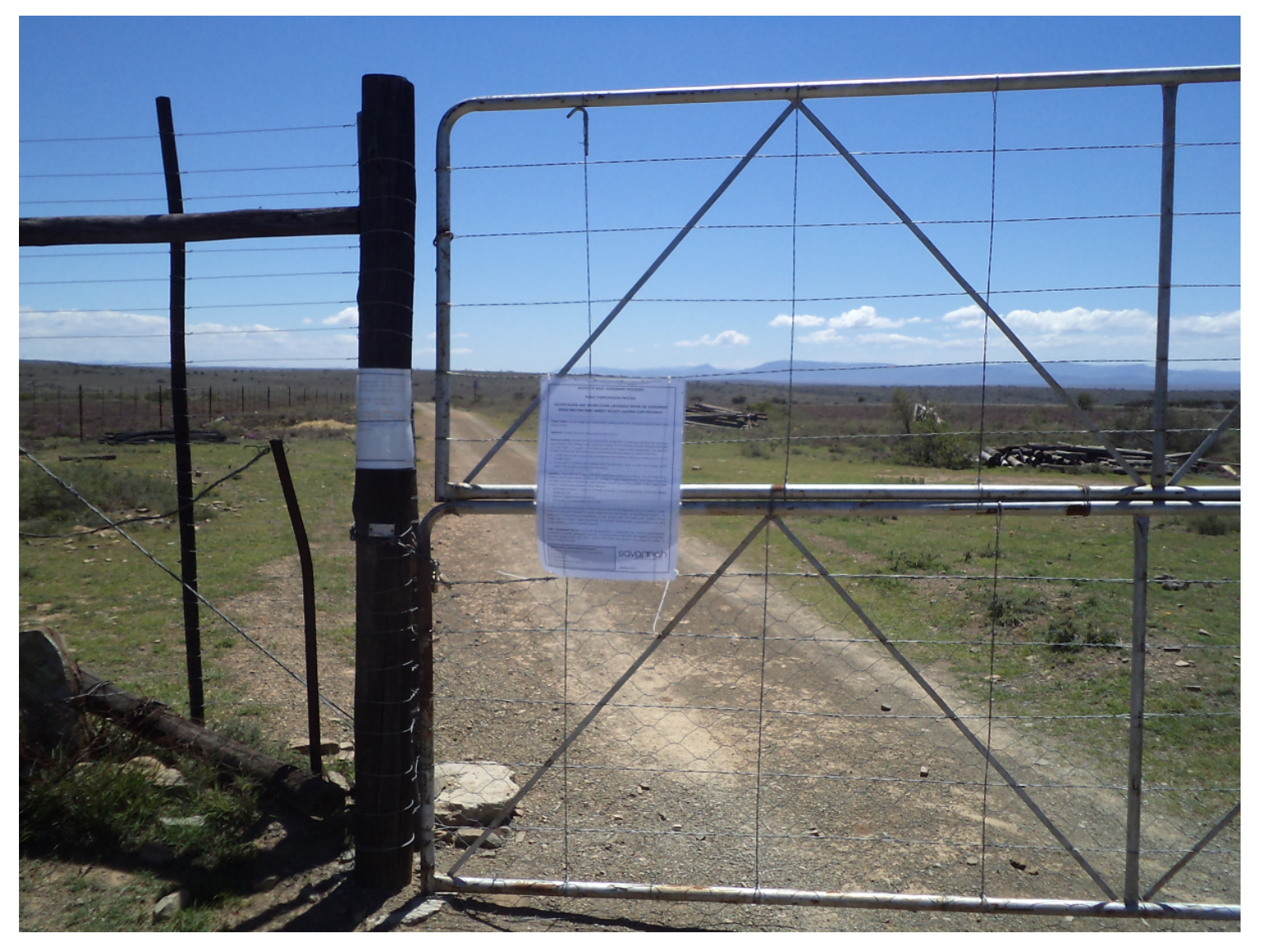
Figure 4: Site Notice placed on the gate of the Farm Vogel Fontein 219 along the Main Road.

Coordinates; $ 32°54'54.20", E 26°09'09.10".