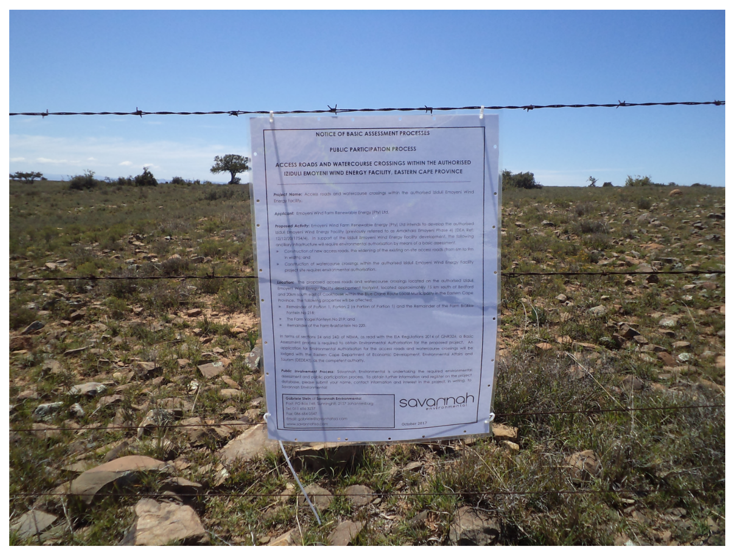
Figure 2: Site Notice placed on the boundary fence of Portion 2 (a portion of Portion 1) of the Farm Brakke Fonteyn 218 along the R350. Coordinates; $ 32°56'32.00", E 26°07'29.1".