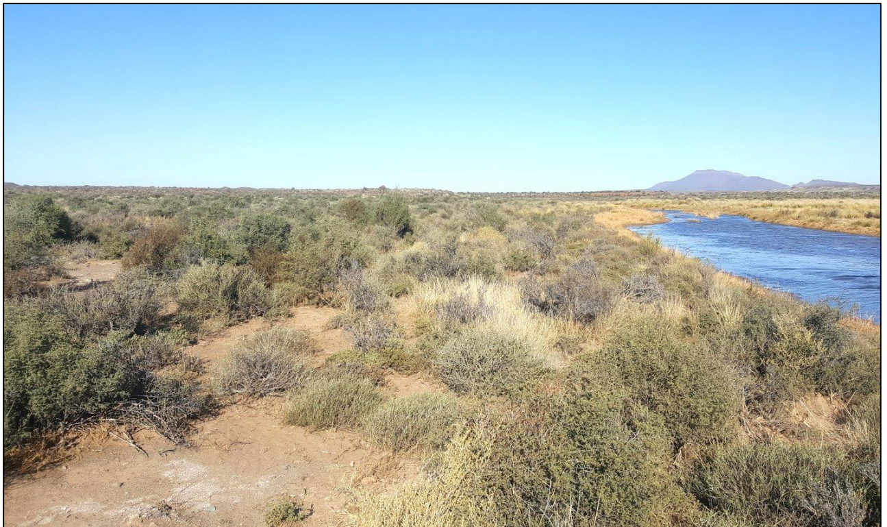
Figure 6. Riparian floodplain vegetation within the Klipkraal 4 site with vegetation that can be considered allied with the Southern Karoo Riviere vegetation type.