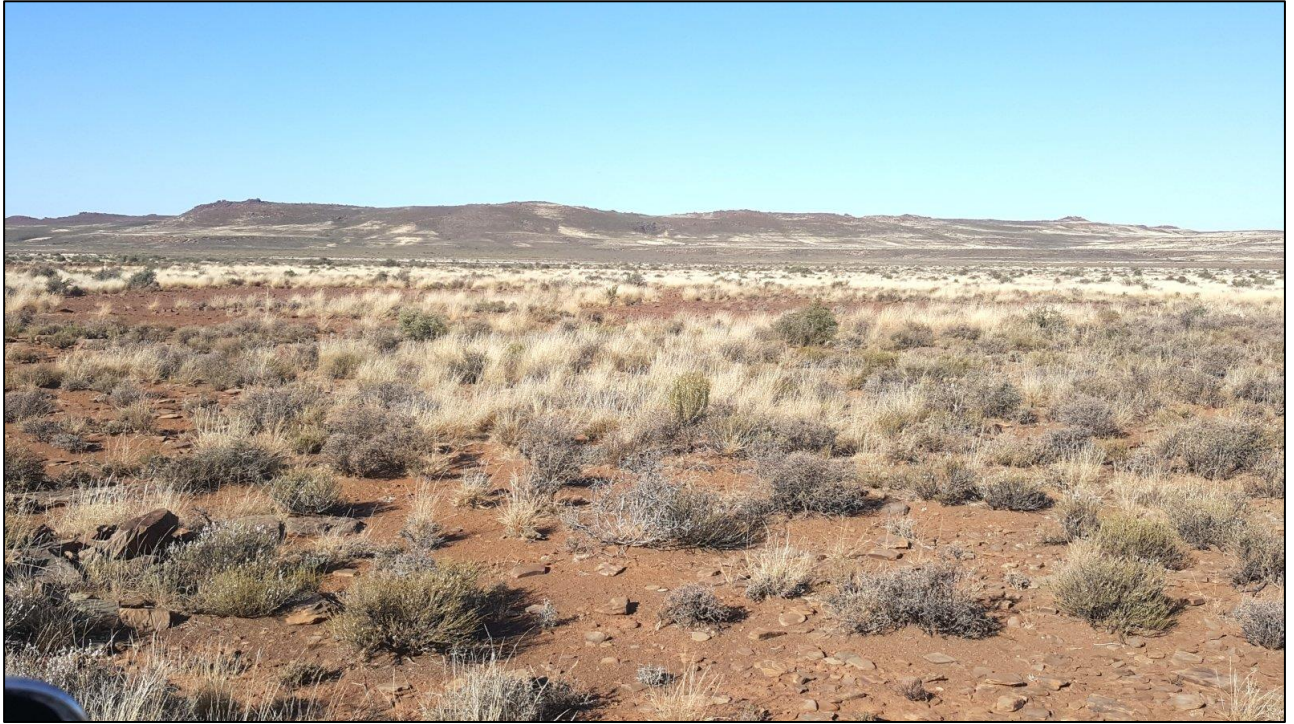
Figure 3. Typical open plains within the south of the Klipkraal 4 project area, representative of the Eastern Upper Karoo vegetation type, showing the homogenous nature of the site and affected vegetation.

S. rabieana , S. tuberculata , Sarcocaulon patersonii and Psilocaulon coriarium . Grasses include Aristida congesta , Enneapogon desvauxii , Stipagrostis ciliata , S. obtusa , Aristida adscensionis , A. diffusa , Eragrostis obtusa , Fingerhuthia africana , Tragus berteronianus and T. koelerioides .