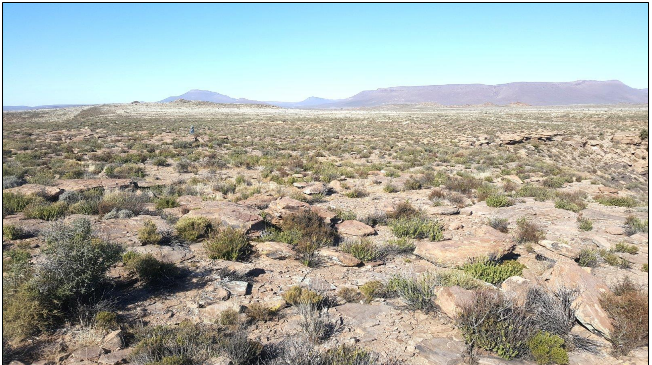
Figure 4. Typical higher elevation plains vegetation from the Klipkraal 4 project area, representative of the Western Upper Karoo vegetation type.

Although there are no areas mapped under the VegMap as Upper Karoo Hardeveld within the site, the site verification indicates that there is a small extent of Upper Karoo Hardeveld within the site. The majority of the hills within the Klipkraal 4 site are however capped with mudstone and there are only a few areas of the more typical dolerite outcrops that characterise the Upper Karoo Hardeveld vegetation type. The Upper Karoo Hardeveld vegetation type is associated with 11 734 km 2 of the steep slopes of koppies, buttes mesas and parts of the Great Escarpment covered with large boulders and stones. The vegetation type occurs as discrete areas associated with slopes and ridges from Middelpos in the west and Strydenburg, Richmond and Nieu-Bethesda in the east, as well as most south-facing slopes and crests of the Great Escarpment between Teekloofpas and eastwards to Graaff-Reinet. Altitude varies from 1000-1900m. Mucina & Rutherford (2006) list 17 species known to be endemic to the vegetation type. This is a high number given the wide distribution of most karoo species and illustrates the relative sensitivity of this vegetation type compared to the surrounding Eastern Upper Karoo.