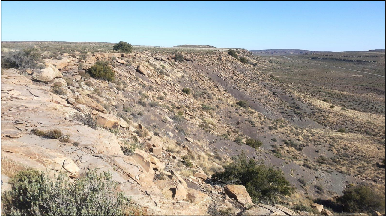
Figure 5. Typical example of a low hill and associated slope from within the Klipkraal 4 site, capped with mudstone.

Although not all areas associated with this vegetation type have been mapped in the VegMap, the vegetation along the major rivers within the Klipkraal 4 site corresponds with the Southern Karoo Riviere vegetation type. In the area, the riparian areas are mapped as Bushmanland Vloere in the VegMap, but this is not an appropriate designation for these areas and the riparian areas within the site, correspond better with the Southern Karoo Riviere vegetation type. The Southern Karoo Riviere vegetation type is associated with the rivers of the central karoo such as the Buffels, Bloed, Dwyka, Gamka, Sout, Kariega and Sundays Rivers. About 12% has been transformed as a result of intensive agriculture and the construction of dams. Although it is classified as Least Threatened, it is associated with rivers and drainage lines and as such represents areas that are considered ecologically significant. Common and dominant species in the drainage lines and within the adjacent floodplain vegetation include Sporobolus ioclados , Helichrysum pentzioides , Drosanthemum lique , Pentzia globosa , Salsola aphylla , Tribulis terrestris , Felicia muricata , Atriplex vestita , Zygophyllum retrofractum , Cynodon dactylon , Chrysocoma ciliata , Stipagostis namaquensis , Lycium pumilum , Lycium cinereum , Artemisia africana , Tripteris spinescens , Exomis microphylla and Derris denudata . No plant species of concern were observed within these areas.