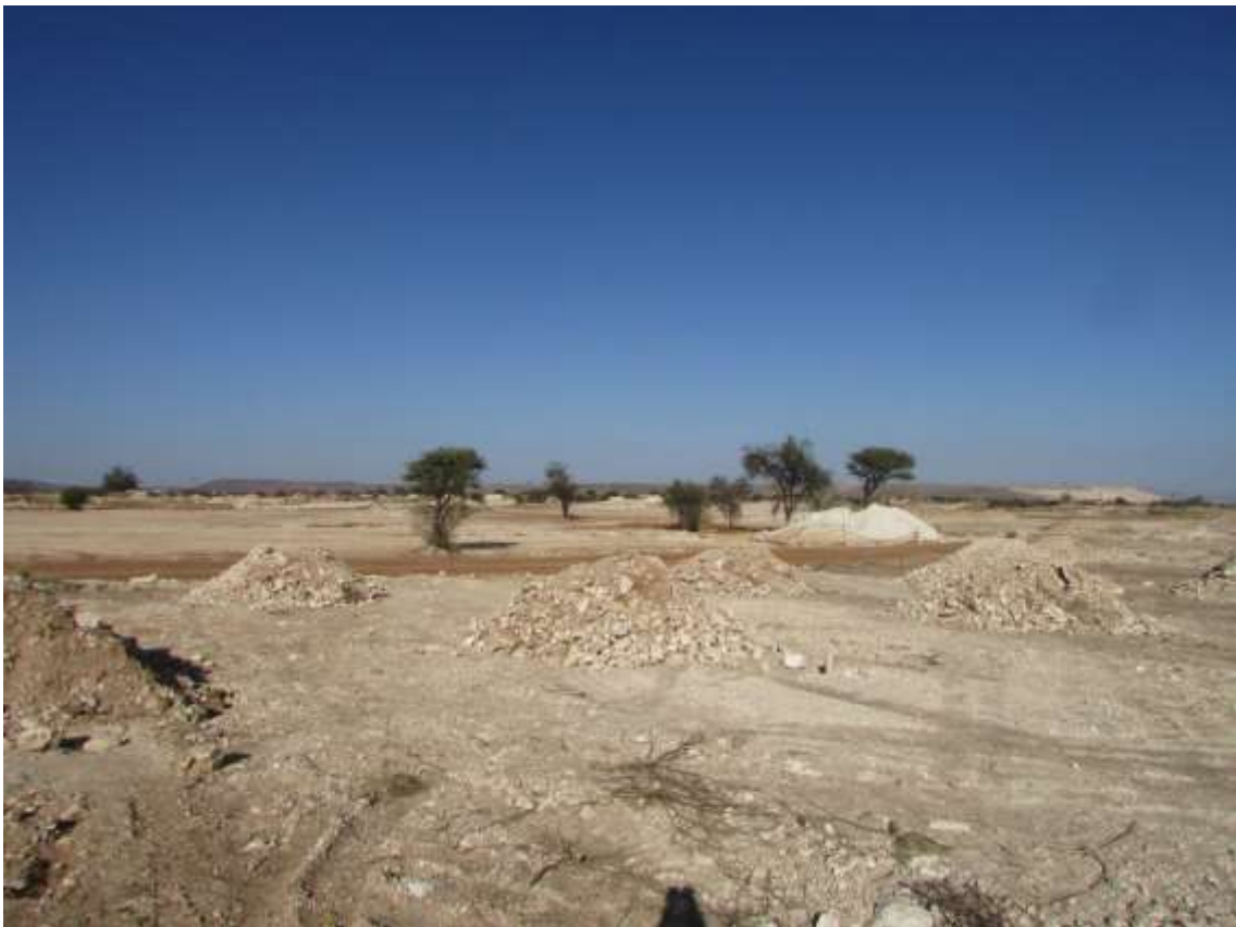
Figure 14: Another general view of a part of the development area.