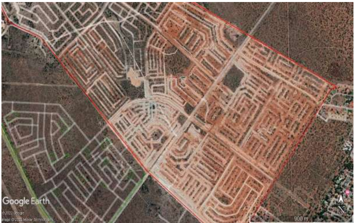
Figure 3: A closer view of the study & development area in March 2022 showing the extent of the earthworks related to the installation of services (sewerage, water pipelines & internal road networks).