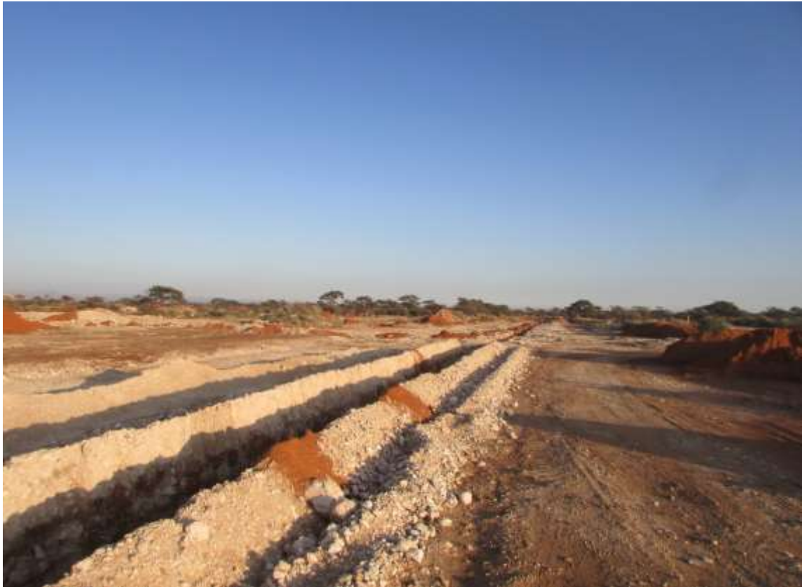
Figure 5: Some of the trenches and areas checked in June 2022.