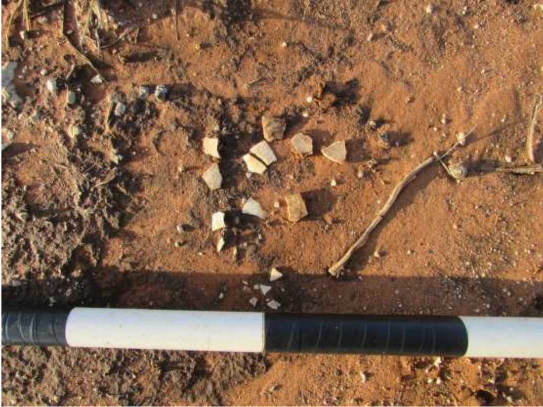
Figure 7: Pieces of Ostrich Egg Shell.