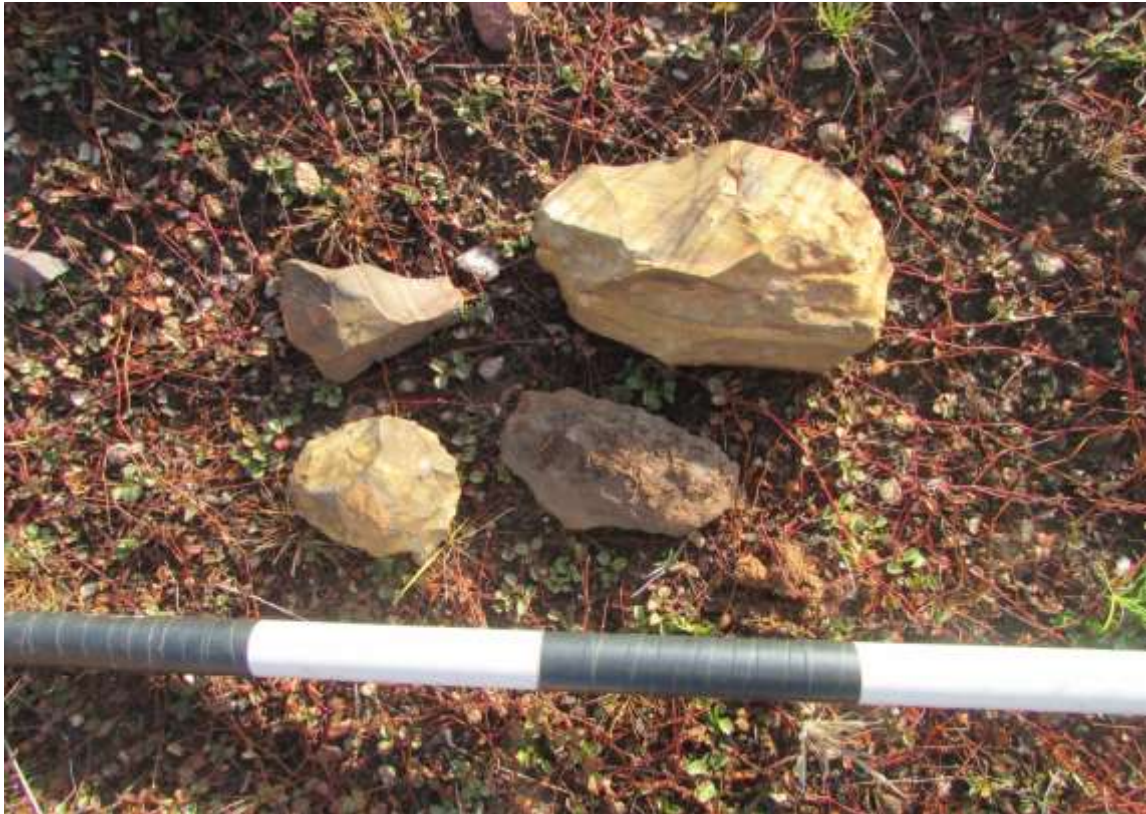
Figure 11: More Stone Age tools in the old borrow pit site.