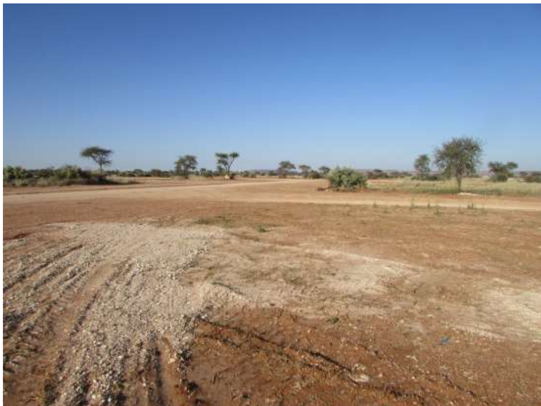
Figure 12: Another section of the Development where internal roads have been established and services had been installed.