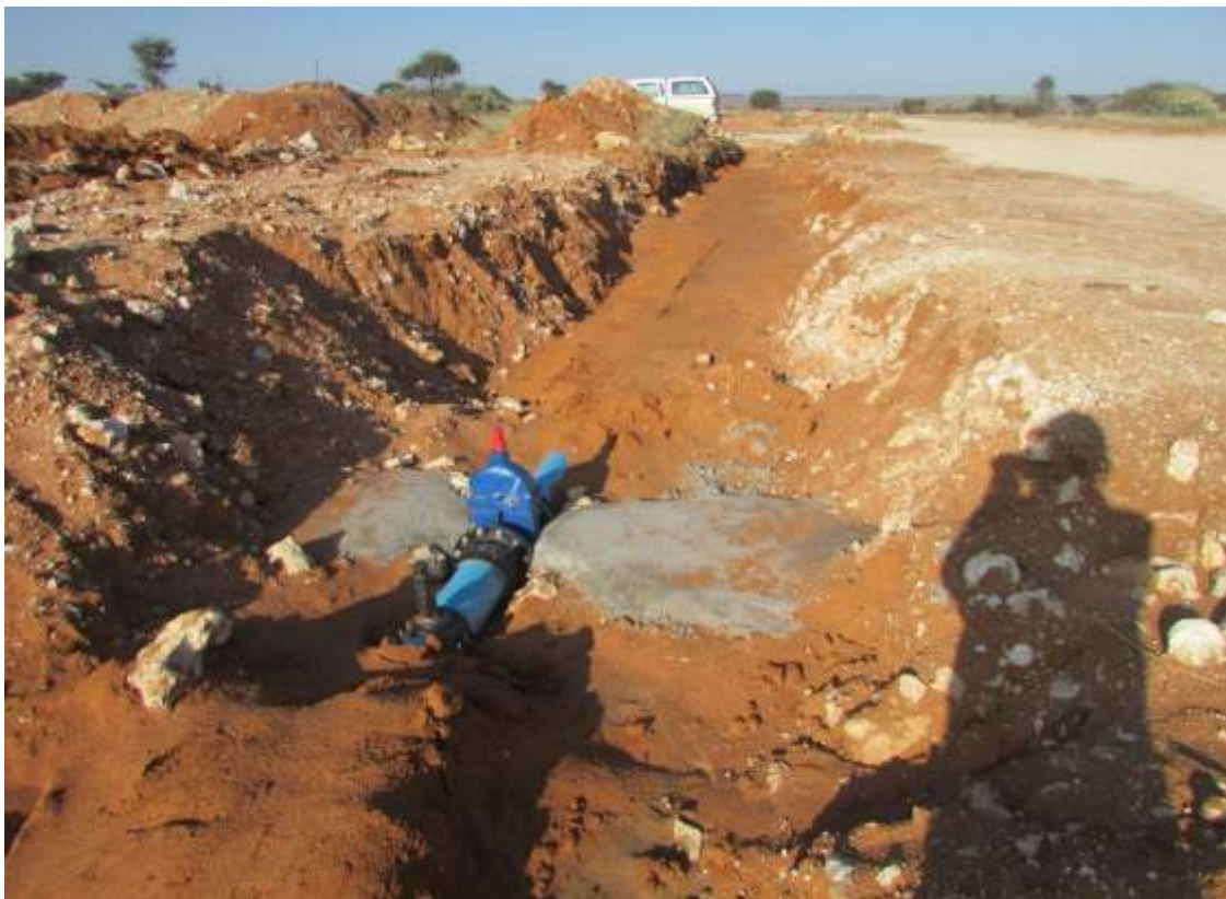
Figure 6: Some of the trenches have been closed and services installed.