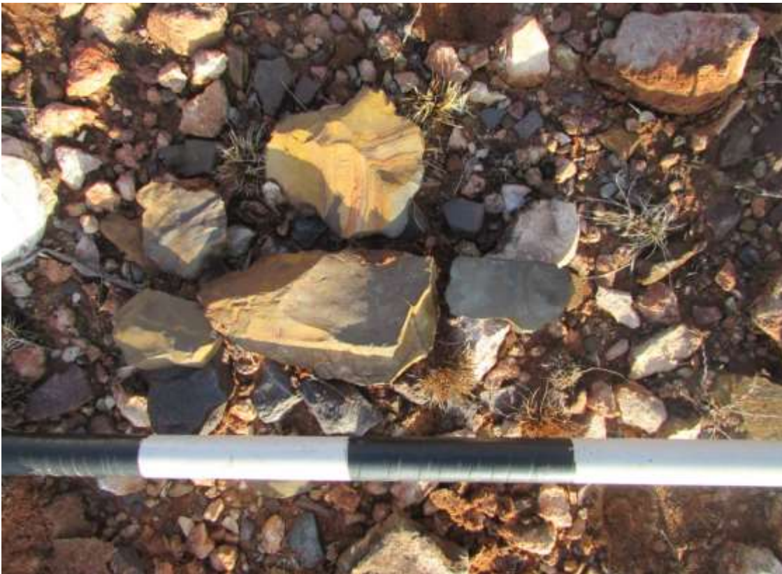
Figure 10: Stone Age tools in the old borrow pit area (found in June 2022).