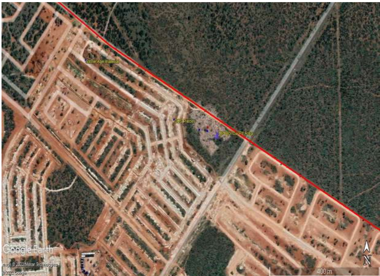
Figure 4: Areas where Stone Age material was recorded during the 3 rd Monitoring Site Visit in June 2022. The old borrow pit locality is also indicated again (Google Earth 2022).