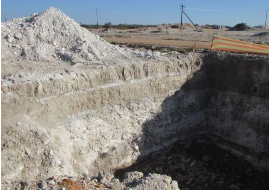
Figure 15: A deep trench/test pit in a part of the development area. Note the very thick calcrete layers.

It is believed that the 3 rd Monitoring Site Visit was conducted successfully. The next visit will be scheduled in due course and will aim at investigating new areas that will be opened-up and developed subsequently, including areas not investigated during the 1 st to 3 rd Monitoring Site Visits. If any extensive archaeological deposits are then found to be present, recommendations on the way forward will be provided in the subsequent reports.