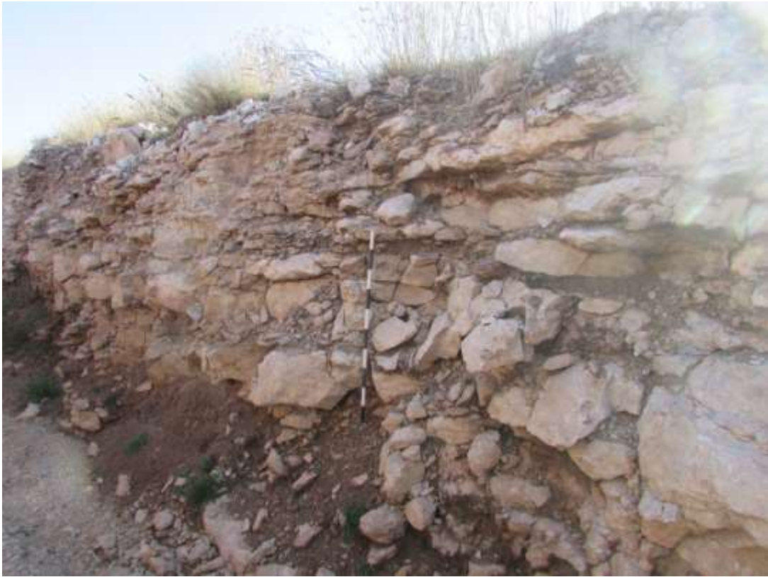
Figure 13: One of the new trenches inspected in June 2022. Note the thick calcrete.