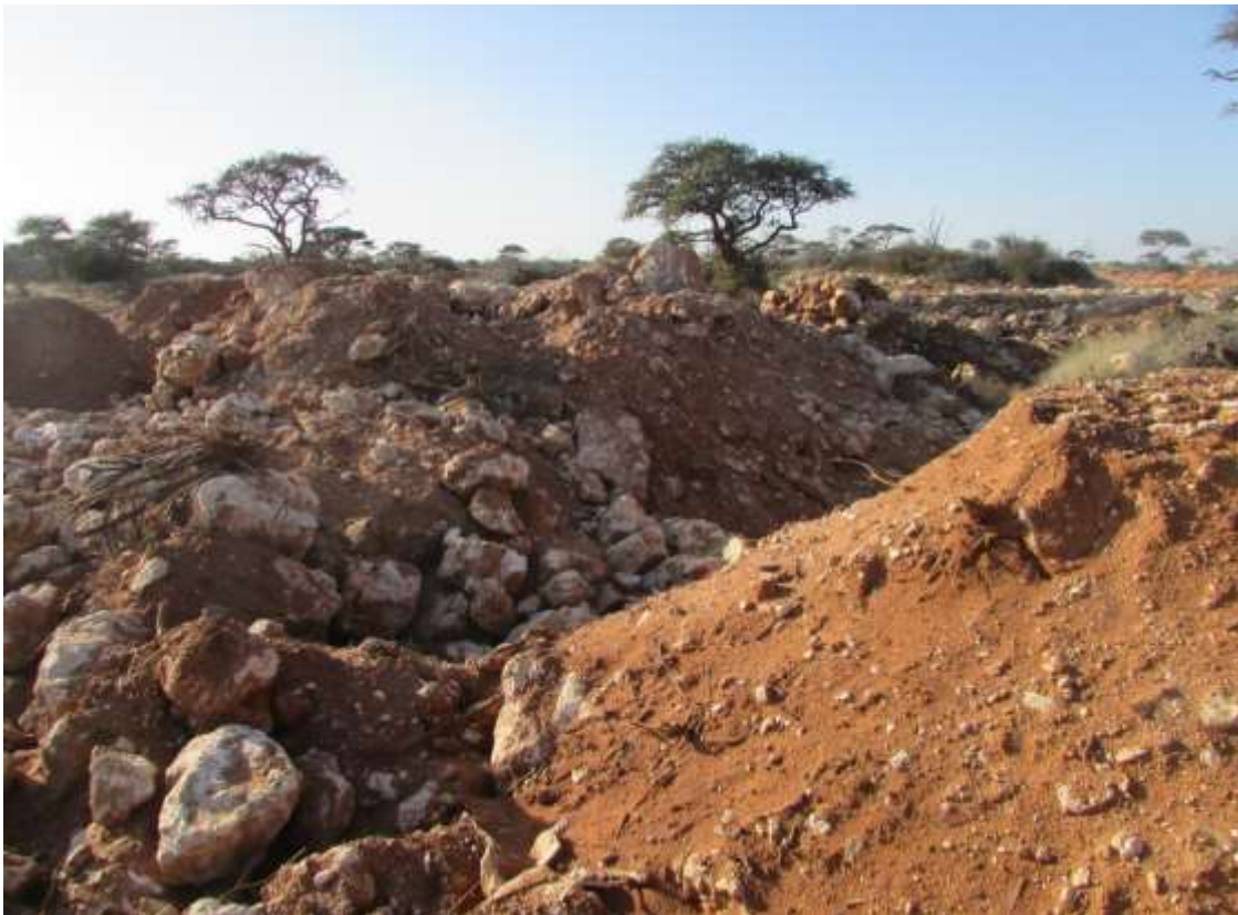
Figure 8: Some of the new waste rock and soil dumps inspected in June 2022.