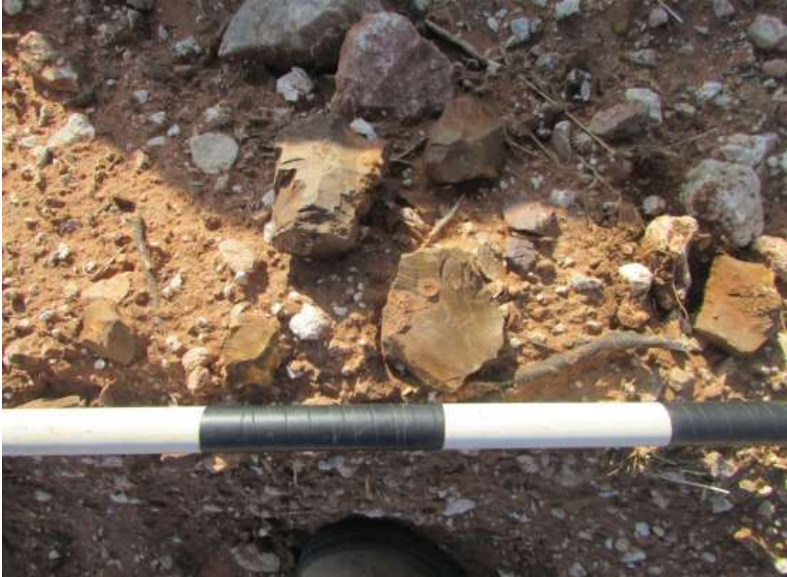
Figure 9: Cores, waste-flakes and a possible scraper found here.