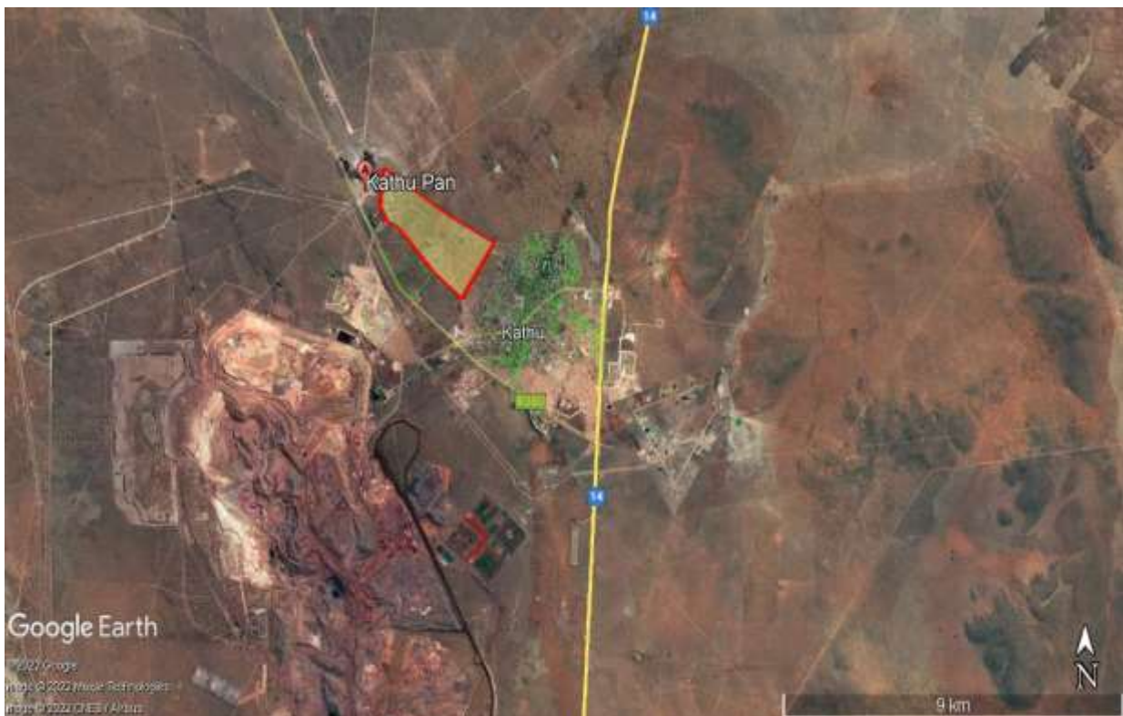
Figure 1: General location of study area (Google Earth 2022).

The topography of the study area is relatively flat, with few if any rocky outcrops. The original vegetation cover consists of low shrubs and thorn trees and very little grass cover. The area is characterized by stretches of white and red sands (Aeolian) and calcrete outcrops. An old dry streambed runs roughly from east to west through the area, while a section of the old (tarred) Sishen-Kuruman road runs from north to south on the eastern side of the area. The old (now dysfunctional) Khai Appel Recreational Resort/Caravan Park is located on its western boundary, while new residential (township) developments are found on its eastern boundary. A number of old dry pans are located in the larger area, as well as recent quarries for various materials in some areas. A small section close to its eastern boundary has also been recently cleared of trees. The area is however not heavily disturbed by past agricultural activities and rural/urban developments. The Sishen Iron Mine is located a few kilometers to the south of the area.