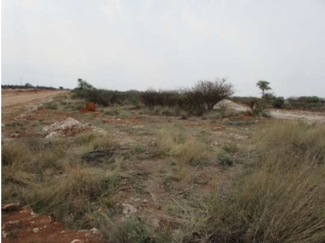
Figure 11: View of a section of the original natural drainage line, with development work undertaken around it.