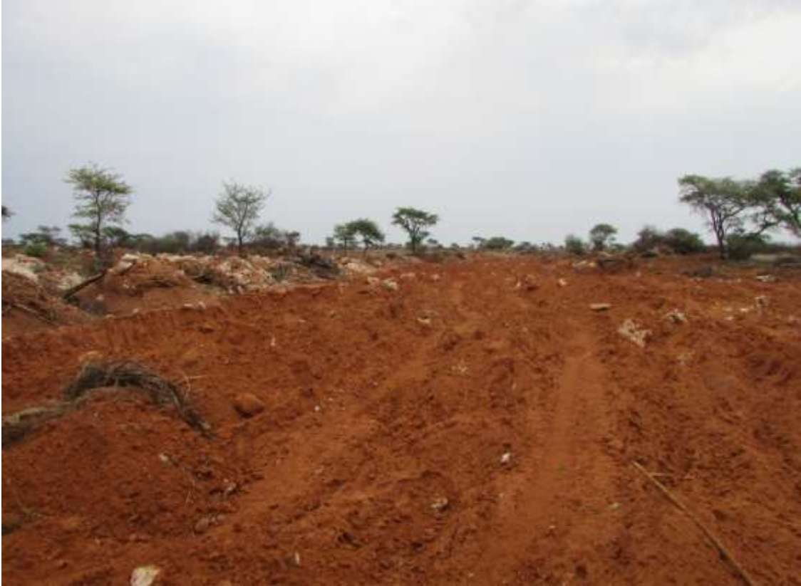
Figure 7: Large-scale working in the north-western section. Note the thick cover of red sands here.