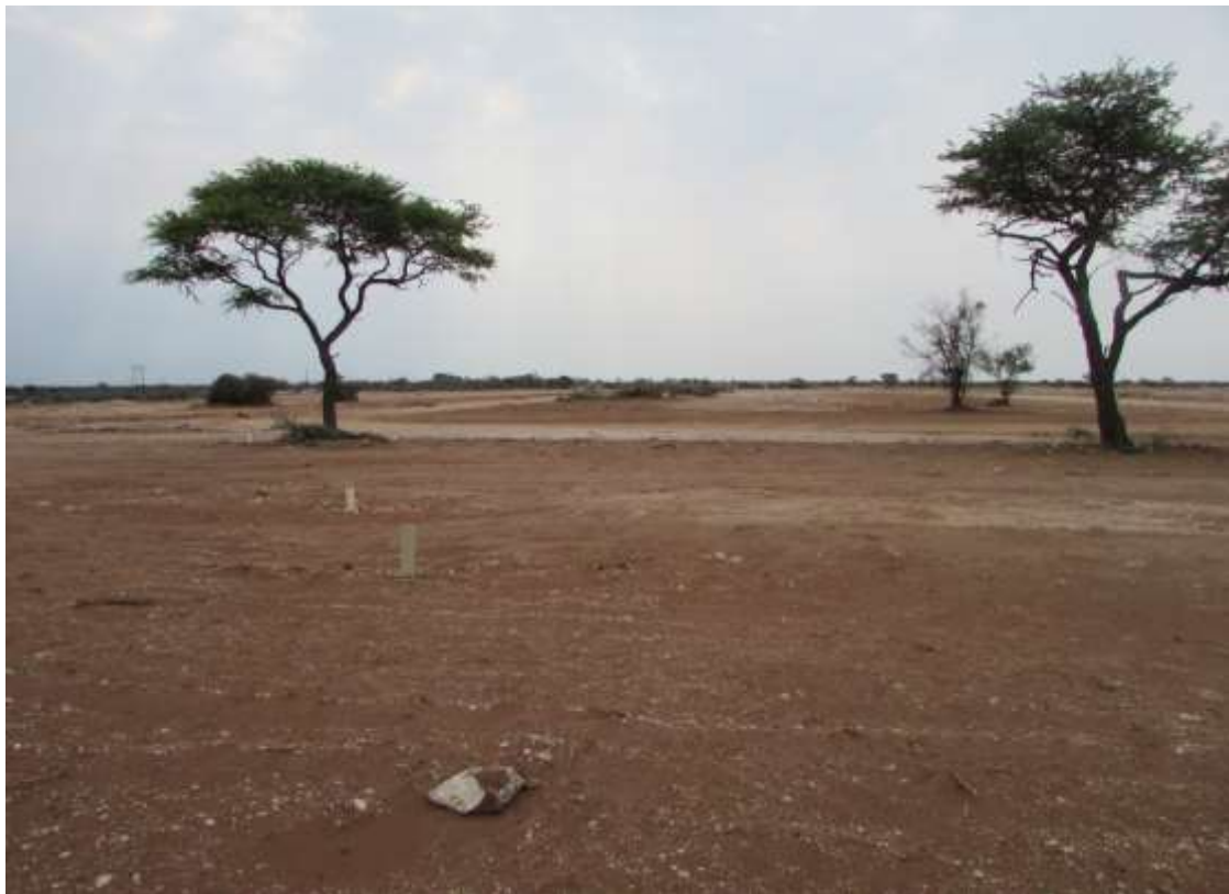
Figure 12: Another view of a portion of the area in the south-western section of the development.