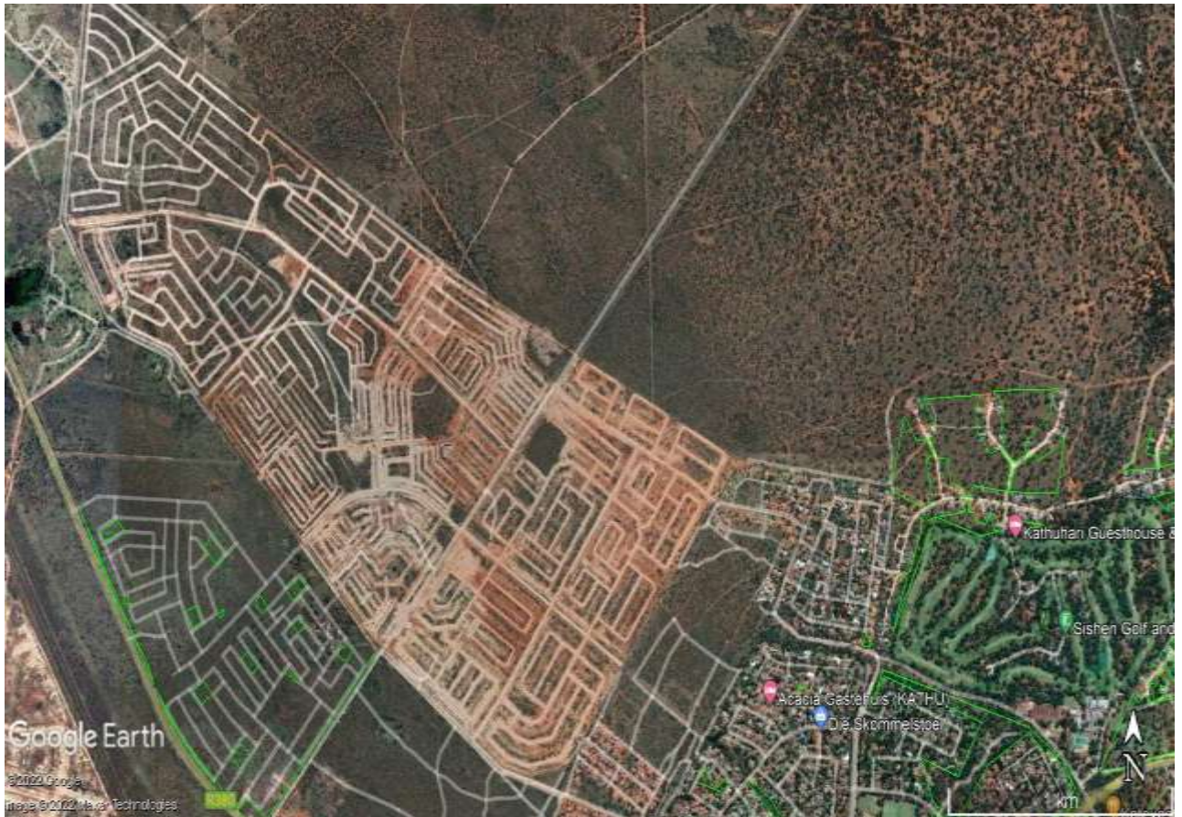
Figure 3: A closer view of the study & development area in October 2022 showing the extent of the earthworks related to the installation of services (sewerage, water pipelines & internal road networks.