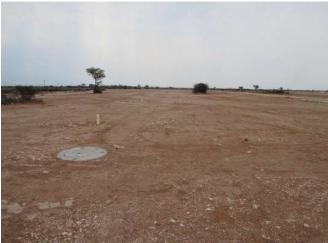
Figure 10: View of a section of the area in the south-western portion of the development showing services such as water & sewerage installed.