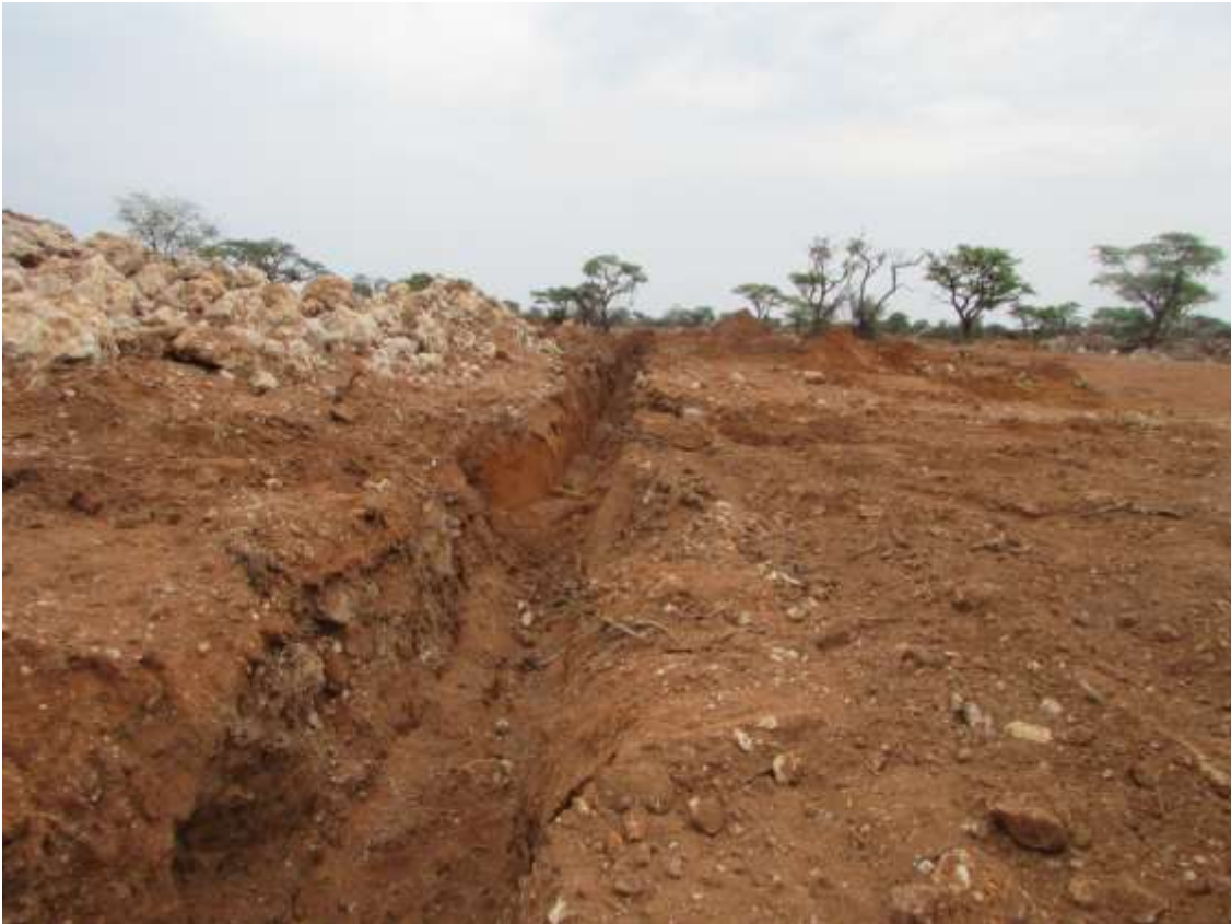
Figure 5: One of the trenches in the north-western part of the development.