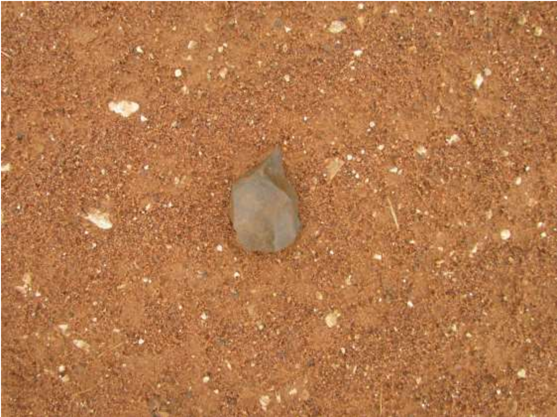
Figure 8: Single MSA core found on the surface of the area.