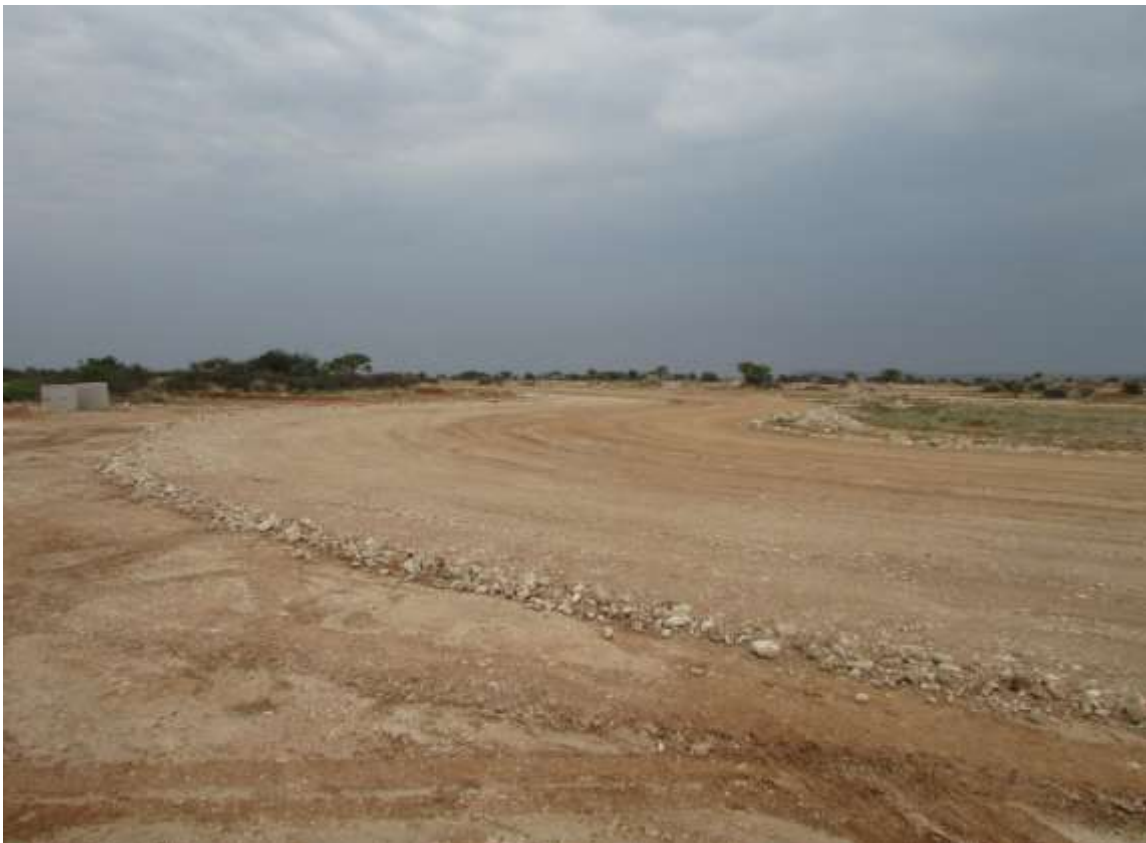
Figure 4: A view of a section of the area showing some of the internal roads that have been compacted.

No find-spots were recorded during the 4th field visit, with only a single core identified on the surface in one of the areas. In the north-western section of the development area (where the red Kalahari sand cover is the thickest) heavy digging/quarrying had taken place, but no archaeological material or deposits were identified here. Extensive work has also taken place around the drainage line area, with water pipelines and related services installed. Again, no dense scatters of material or in situ archaeological deposits were visible in the areas inspected.