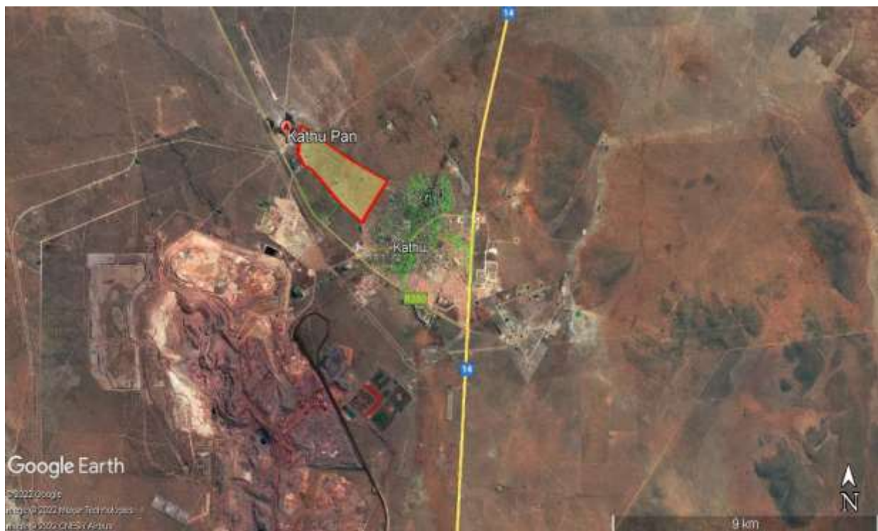
Figure 1: General location of study area (Google Earth 2022).

The topography of the study area is relatively flat, with few if any rocky outcrops. The original vegetation cover consists of low shrubs and thorn trees and very little grass cover. The area is characterized by stretches of white and red sands (Aeolian) and calcrete outcrops. An old dry streambed runs roughly from east to west through the area, while a section of the old (tarred) Sishen-Kuruman road runs from north to south on the eastern side of the area. The old (now dysfunctional) Khai Appel Recreational Resort/Caravan Park is located on its western boundary, while new residential (township) developments are found on its eastern boundary. A number of old dry pans are located in the larger area, as well as recent quarries for various materials in some areas. A small section close to its eastern boundary has also been recently cleared of trees. The area is however not heavily disturbed by past agricultural activities and rural/urban developments. The Sishen Iron Ore Mine is located a few kilometers to the south of the area.