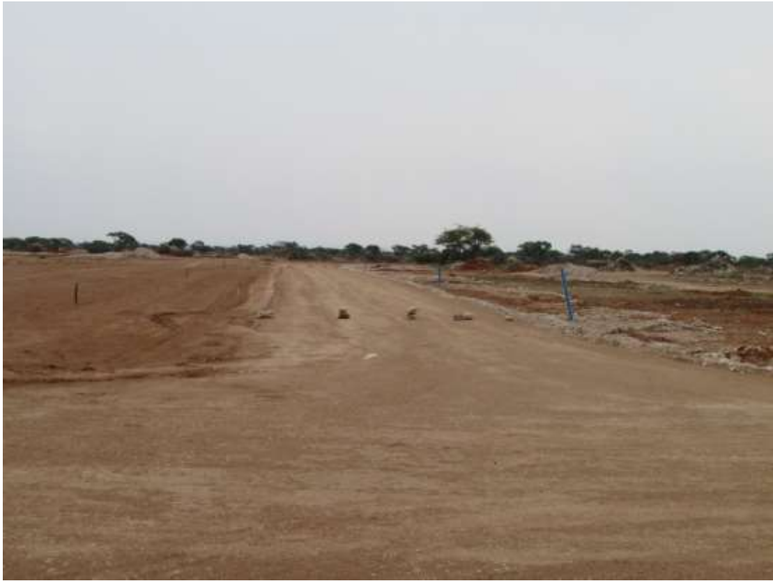
Figure 9: Work on the development's internal road system is ongoing.