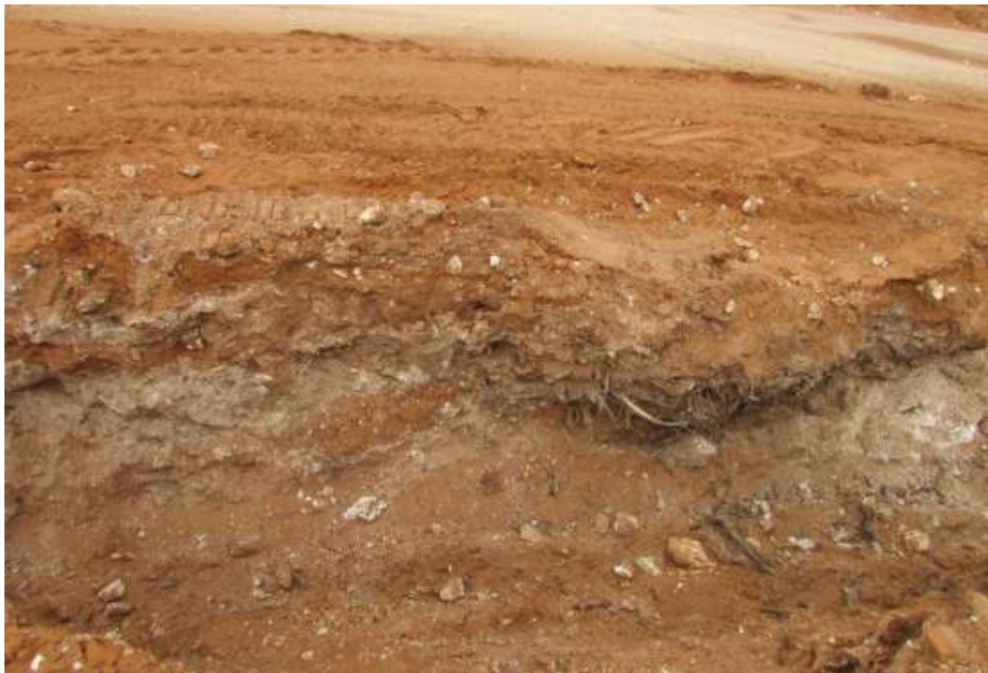
Figure 6: Red Kalahari (Aeolian) sand overlies the calcrete layers below.