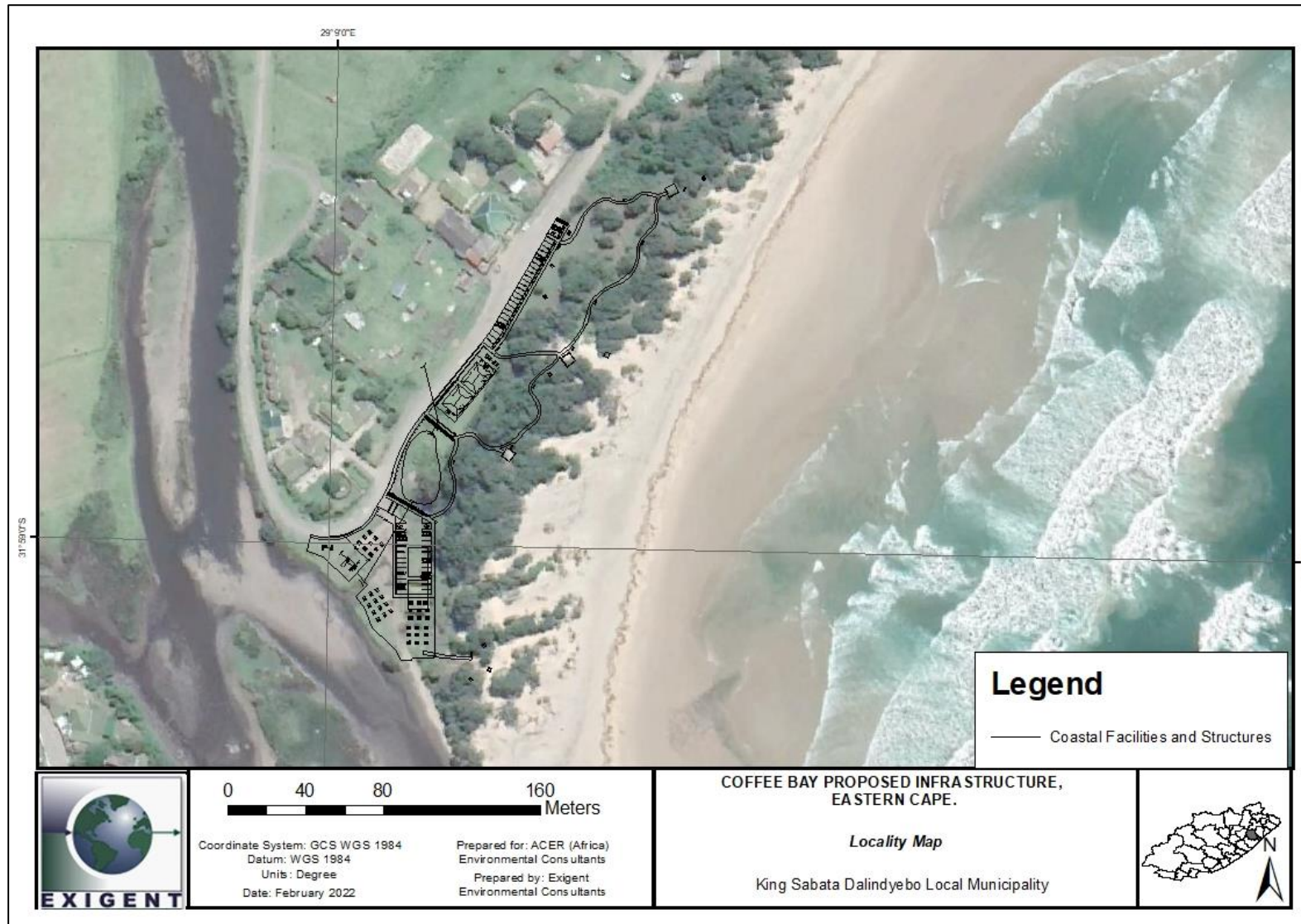
Figure 1 Locality map showing the proposed development at Coffee Bay (BA 1)