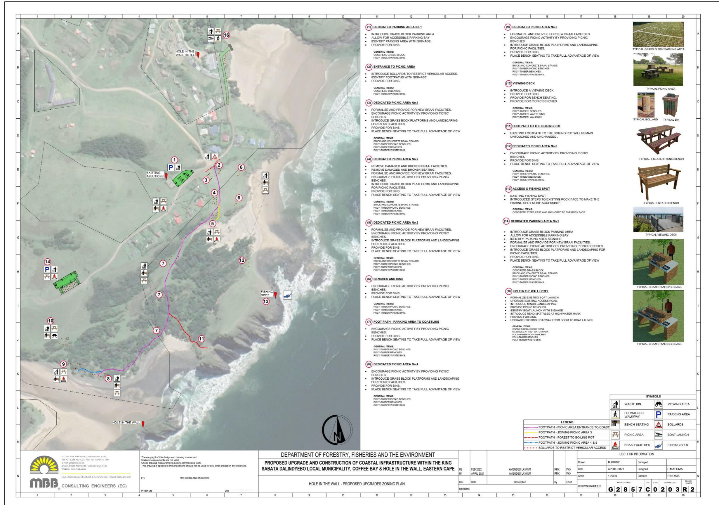
Figure 4 Hole in the Wall – Proposed Infrastructure Layout Plan