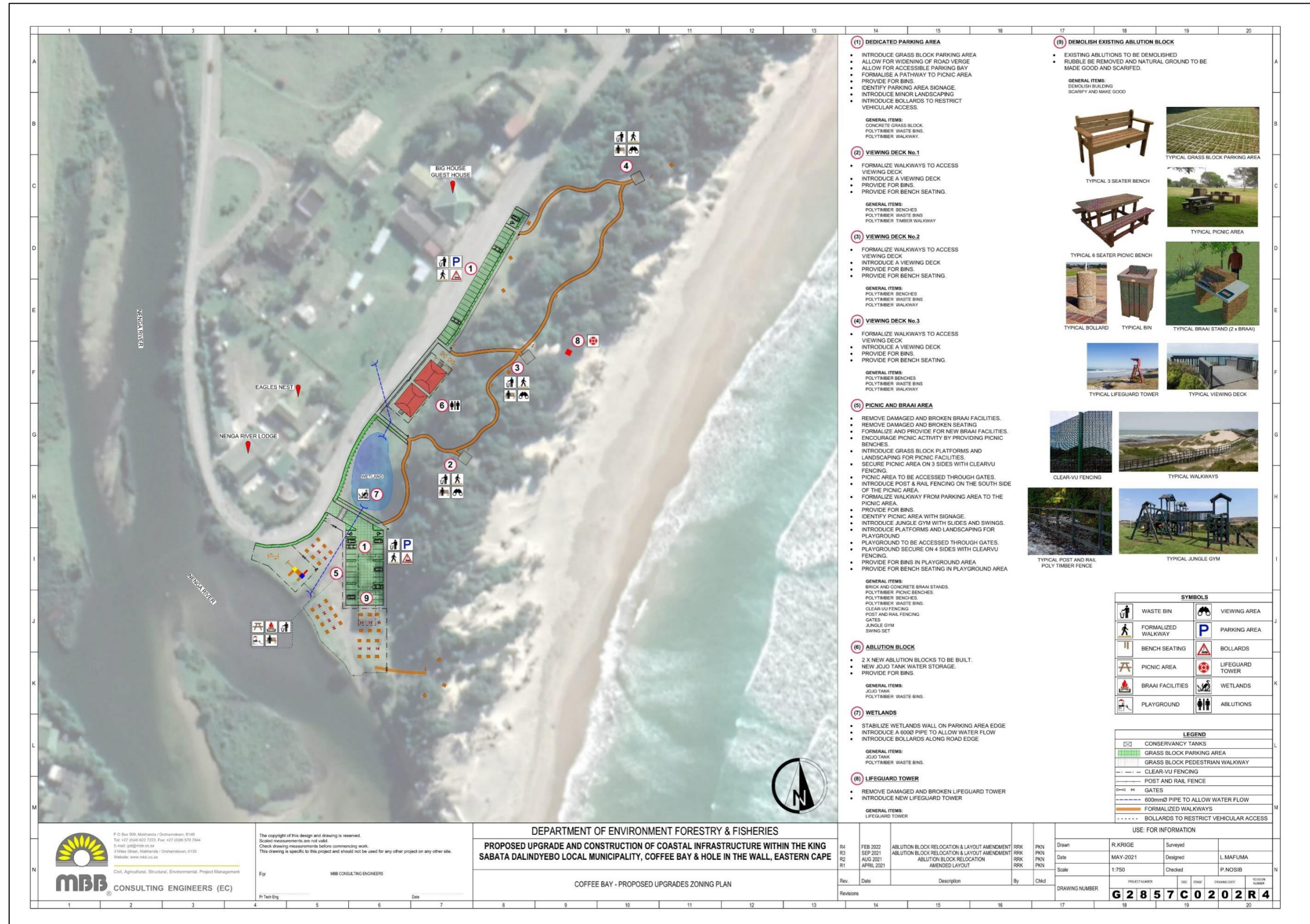
Figure 3 Coffee Bay – Proposed Infrastructure Layout Plan