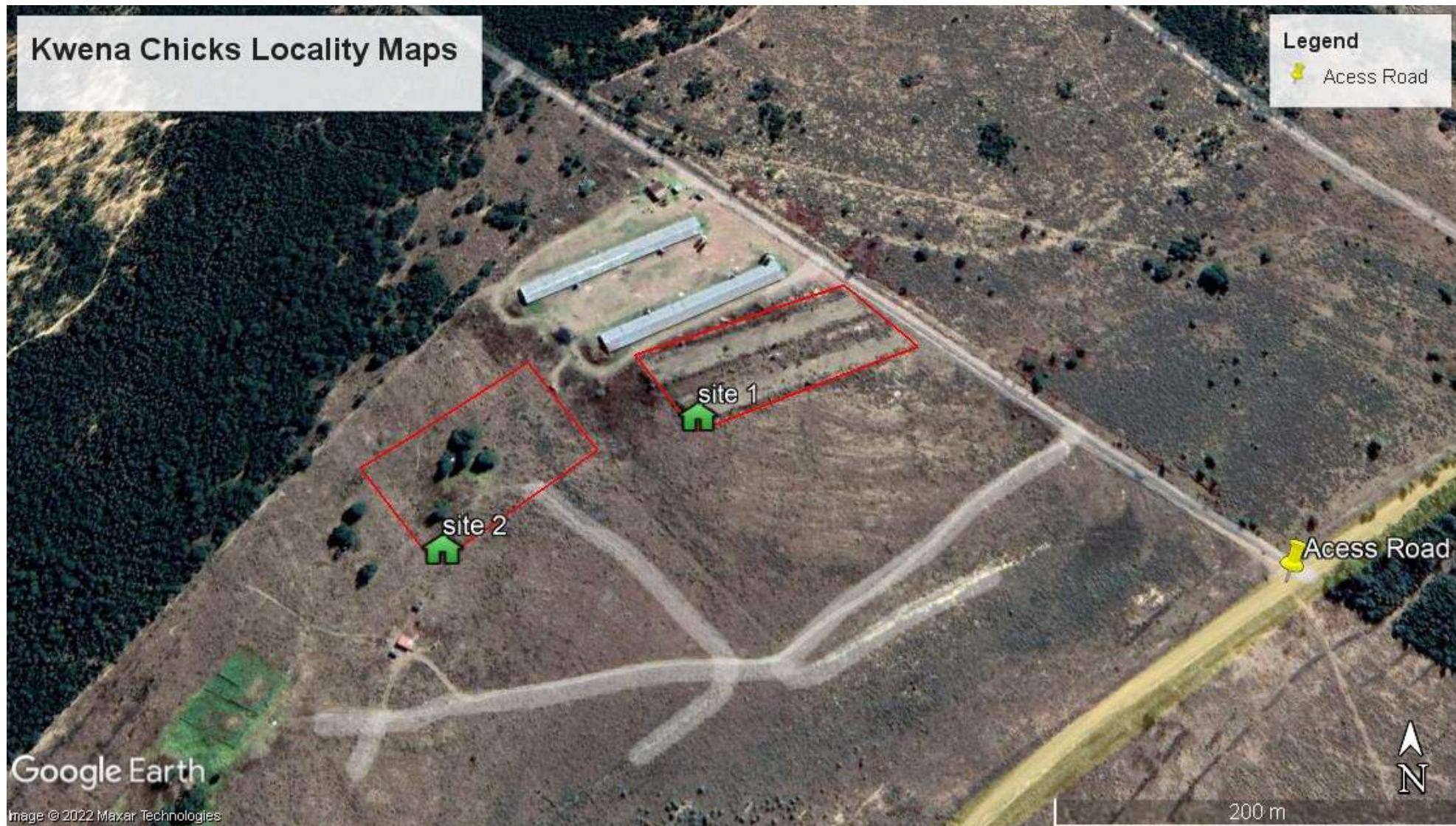
Figure 1: Locality map