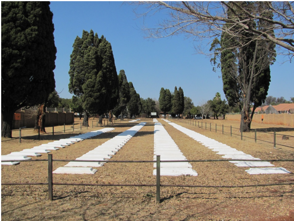
Figure 2. Graves at Karee str, Kanonkop Middelburg