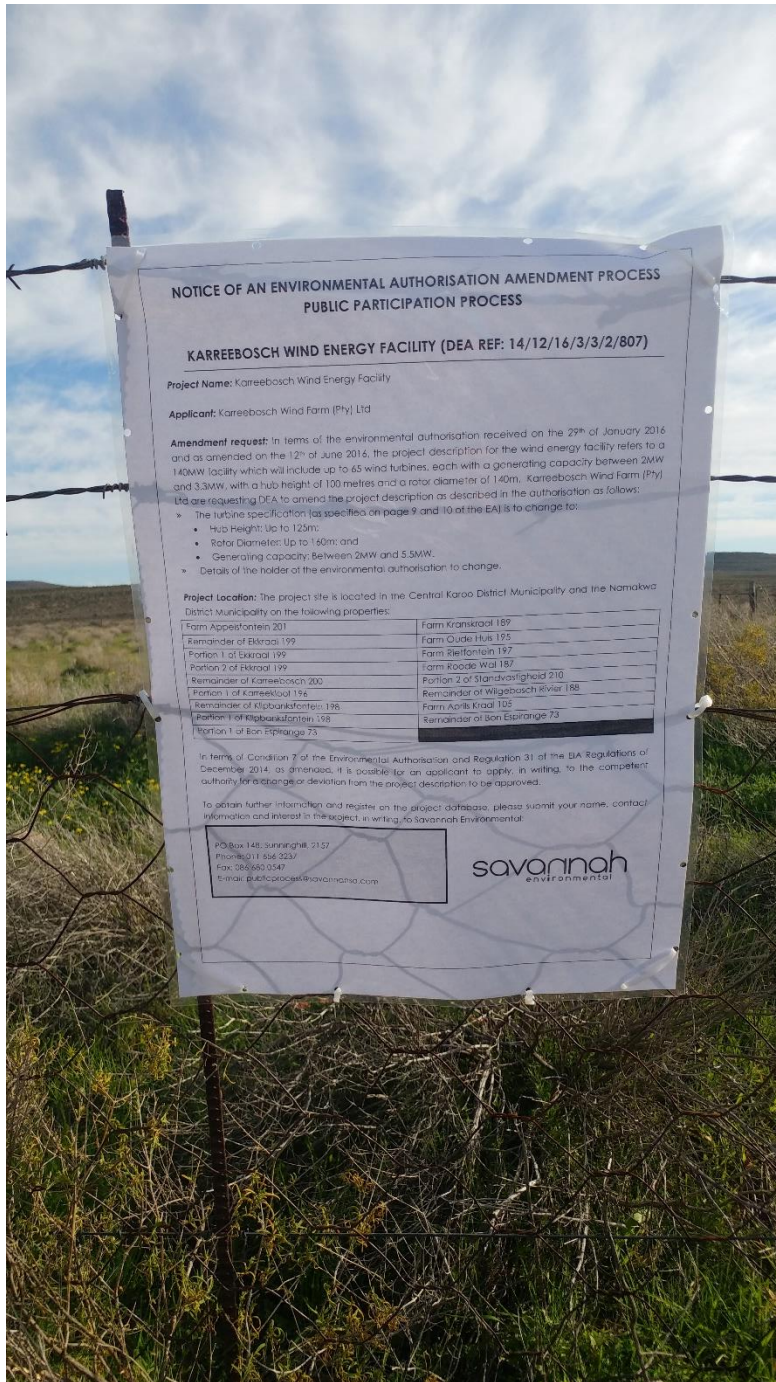
Figure 1: Site Notice (English) placed along the R354 on the boundary fence of the Remainder of Karreebosch 200 (GPS Location: 32°47'27.88"S; 20°32'14.36"E)