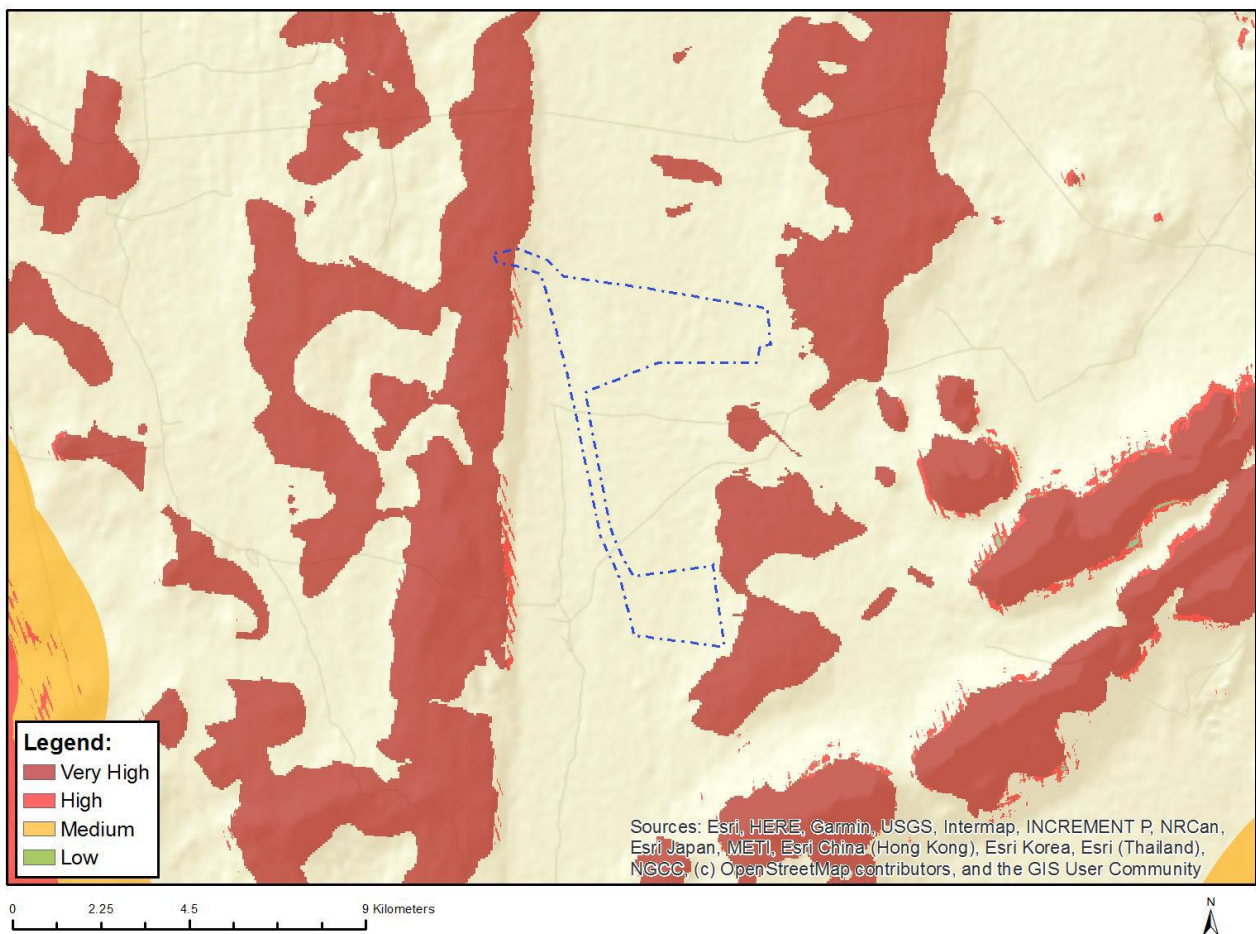
Map 1: Relative landscape (solar) theme sensitivity as per the DFFE Screening Tool for the proposed Daisy and Kleinzee Solar PV Facilities and associated grid connection infrastructure

The DFFE screening tool generated for the Daisy and Kleinzee Solar PV Facilities and associated grid connection infrastructure indicated that the facilities have a very high sensitivity owing to the fact that the sites are located on mountain tops and high ridges. Refer to Map 1 .